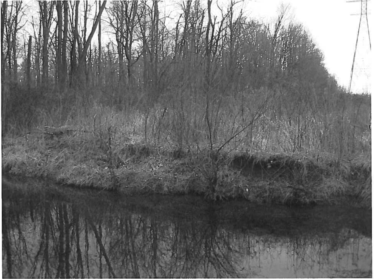
Photo 60: Wetland W010, view north. In foreground is UNT to East Branch Nimishillen Creek.