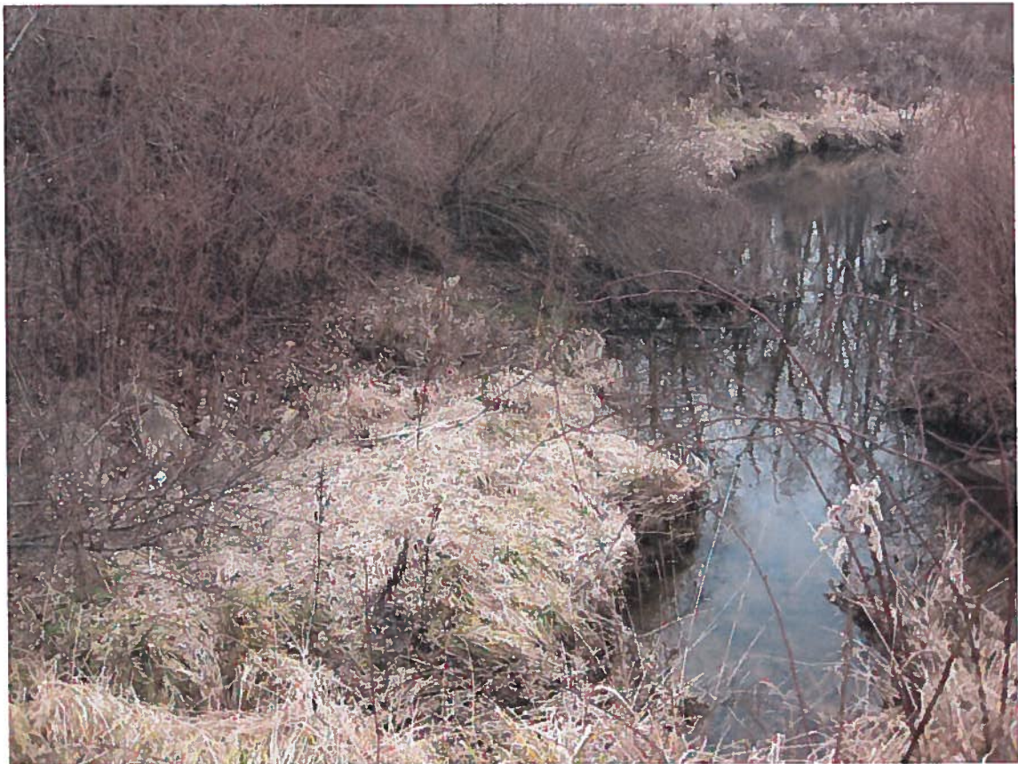
Photo 64: Wetland W013, view south. W013 abuts S013, an UNT to the East Branch of Nimishillen Creek.