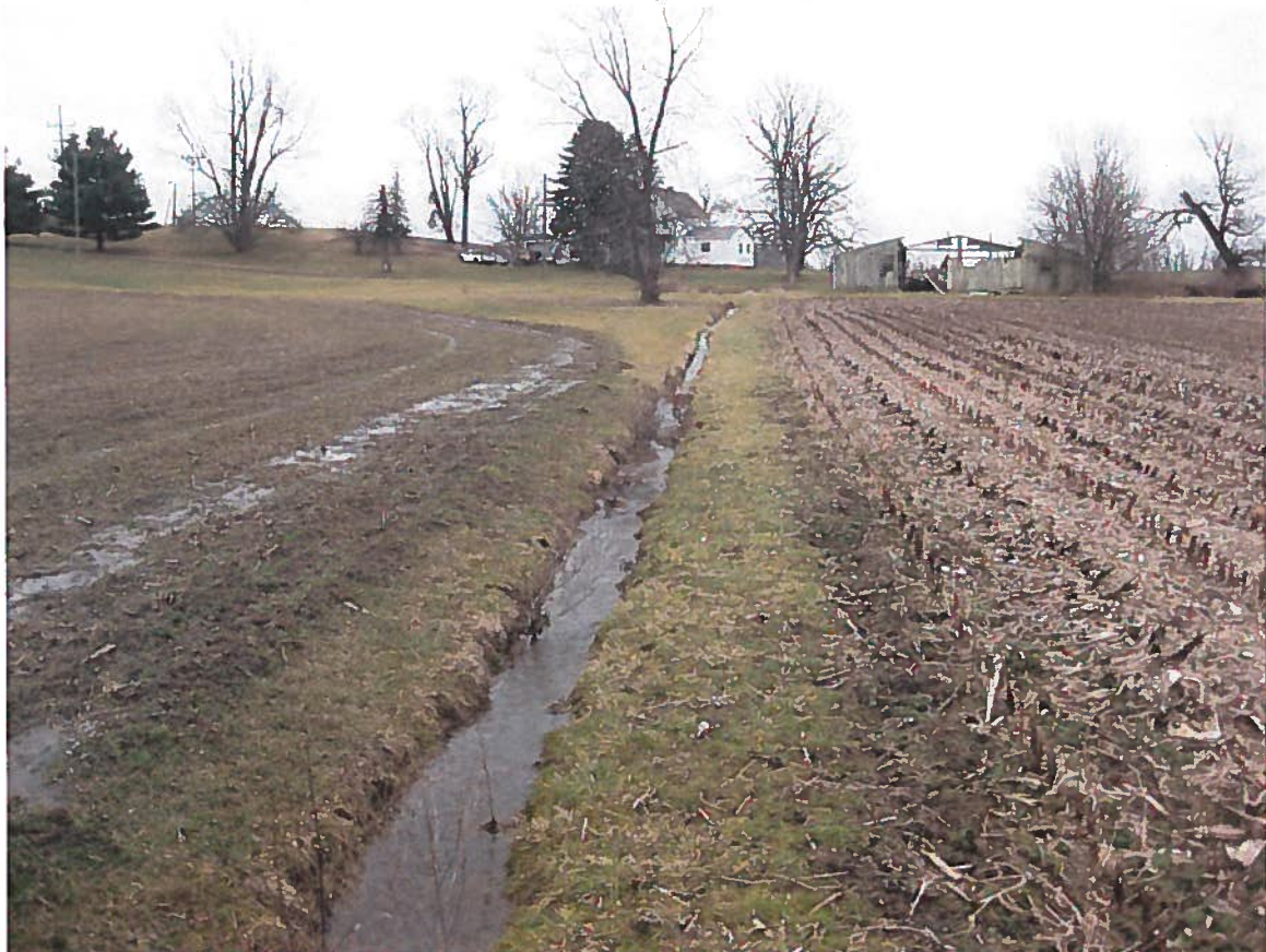
Photo 15: Stream 10, an UNT to East Branch Nimishillen Creek, view east upstream.