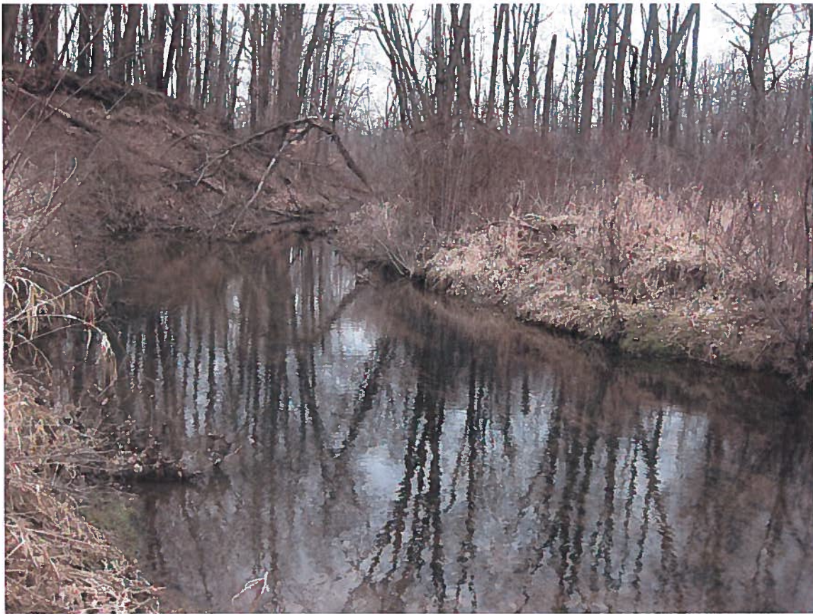
Photo 18: Stream S011, and UNT to East Branch Nimishillen Creek, view west downstream.