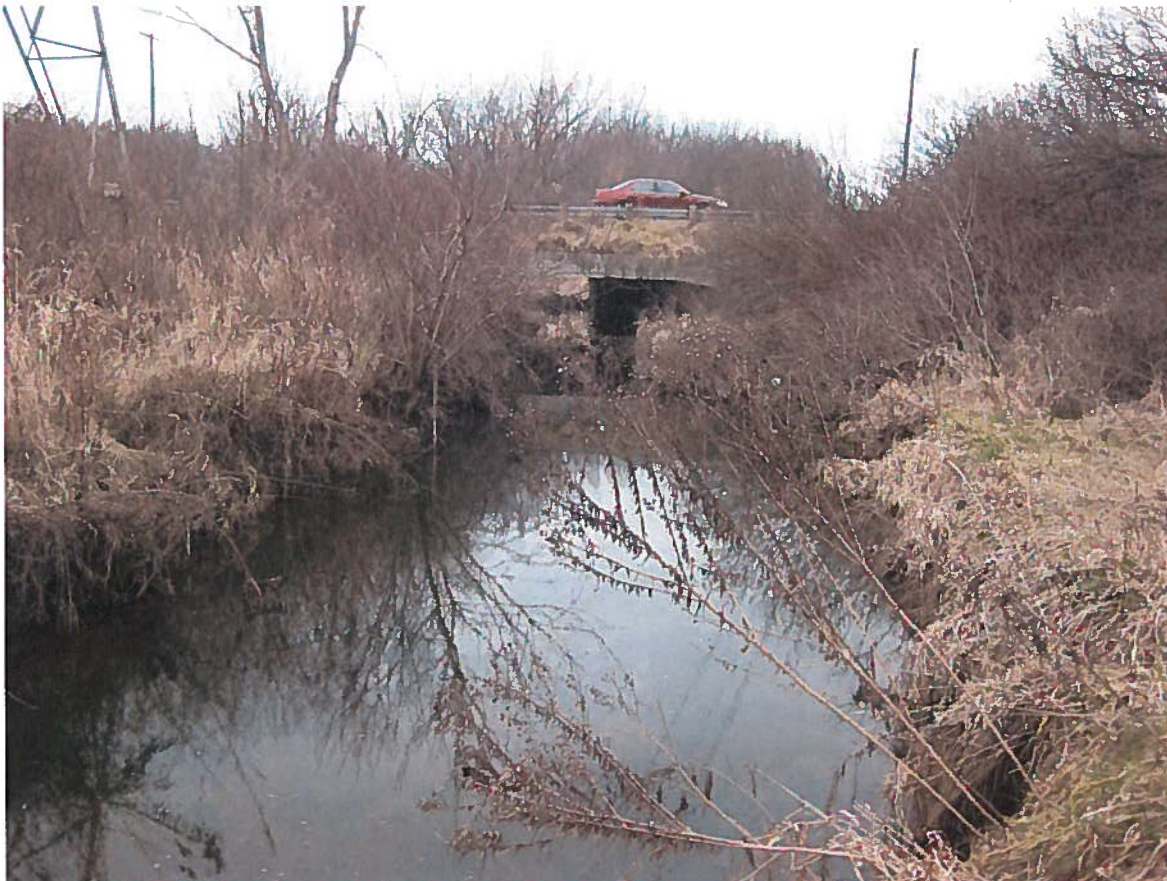
Photo 24: Stream S013, an UNT to East Branch Nimishillen Creek, view north upstream.