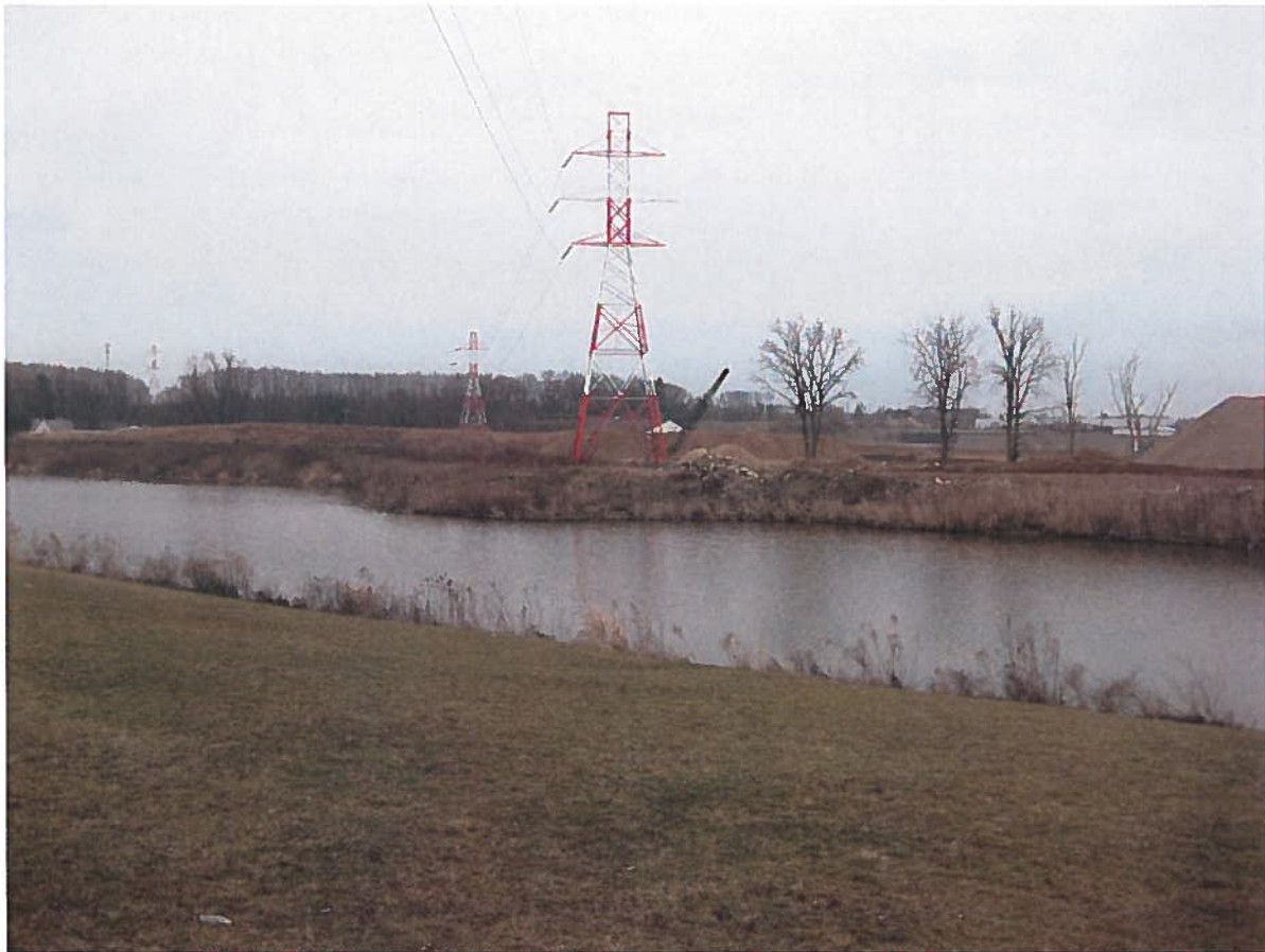
Photo 44: Pond P04, a large pond within the survey area; view southeast.