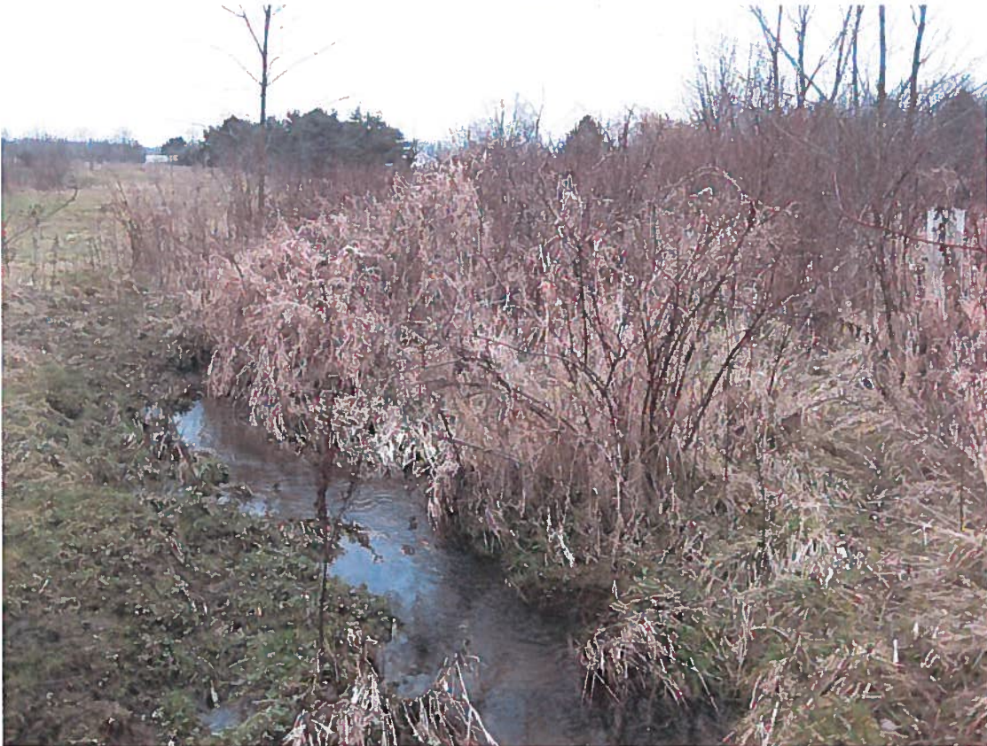
Photo 12: Stream S09, an UNT to East Branch Nimishillen Creek, view southeast upstream.