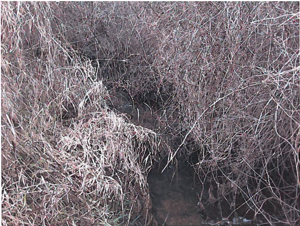
Photo 37: Stream S018, an UNT to the Middle Branch Nimishillen River, view south upstream.