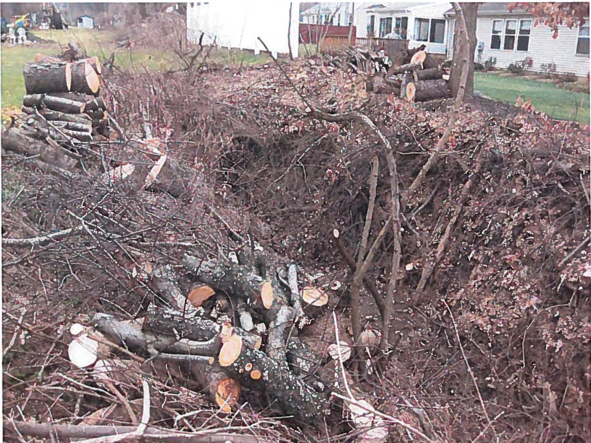
Photo 42: Stream S020, an UNT to Middle Branch Nimishillen Creek, view upstream to the east.