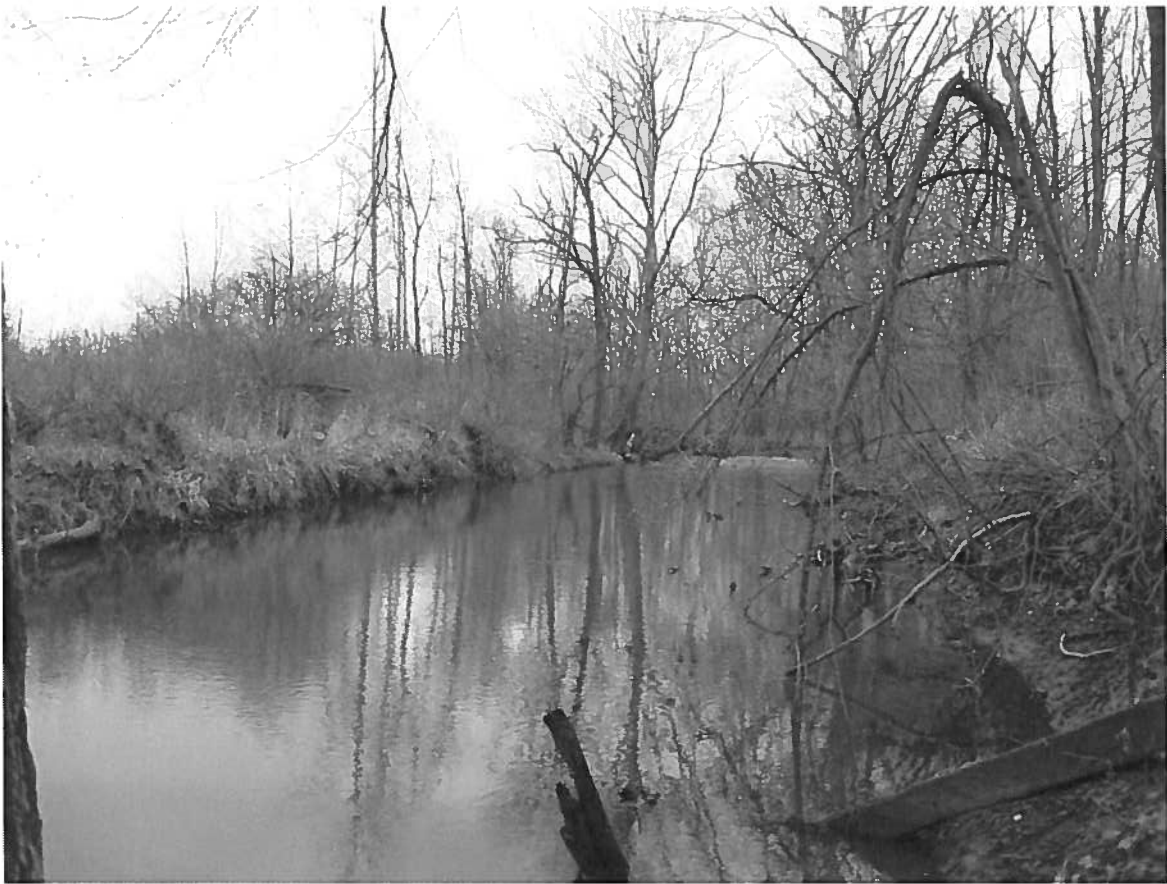
Photo 21: Stream S012, the East Branch of Nimishillen Creek, view east upstream.