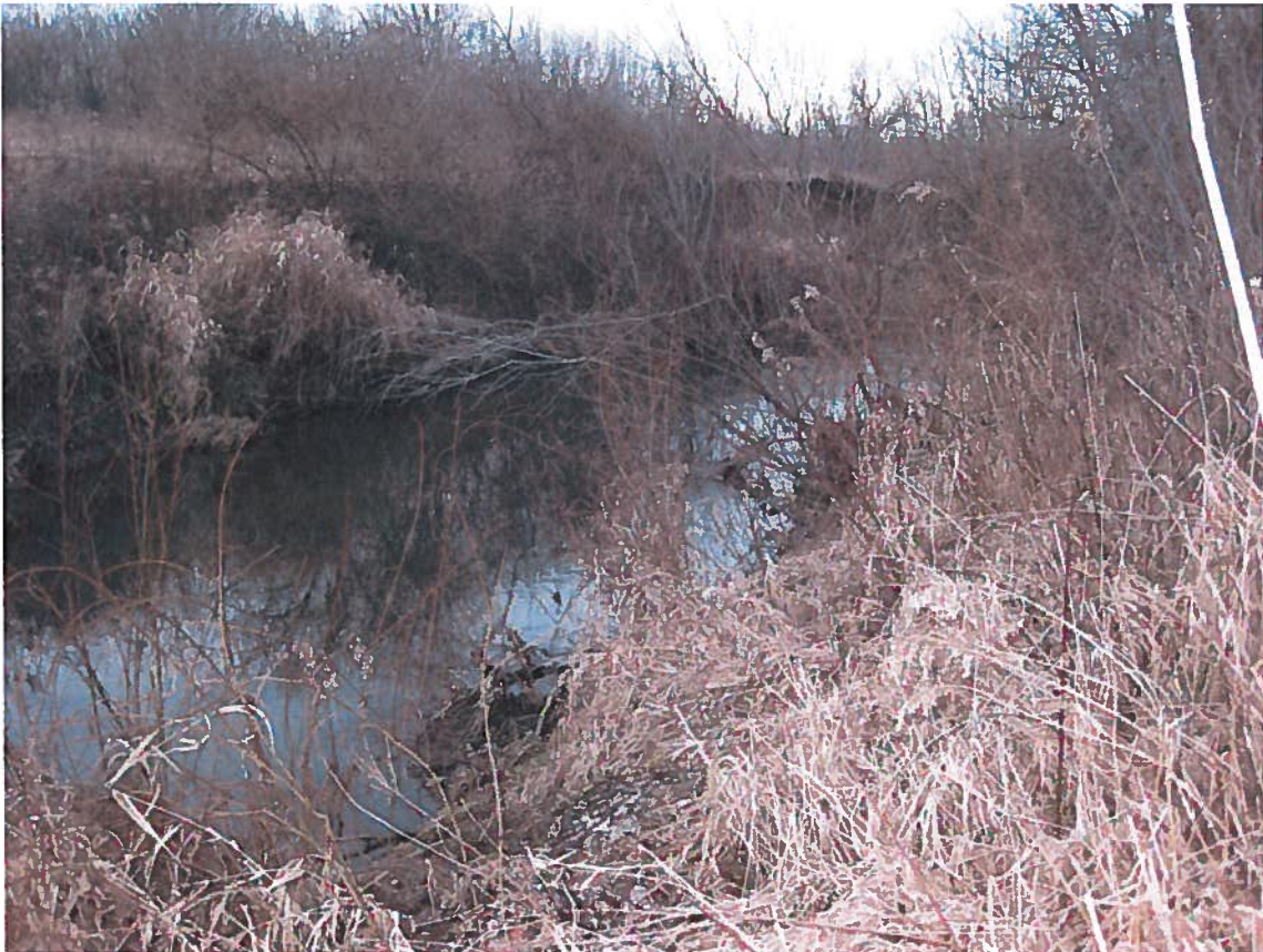
Photo 10: Stream S05, UNT to West Branch Nimishillen, upstream view north.