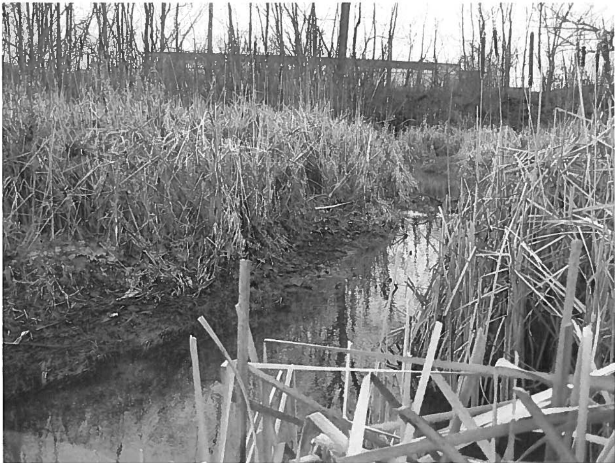
Photo 27: Stream S014 as it flows through wetland W014, upstream view south.