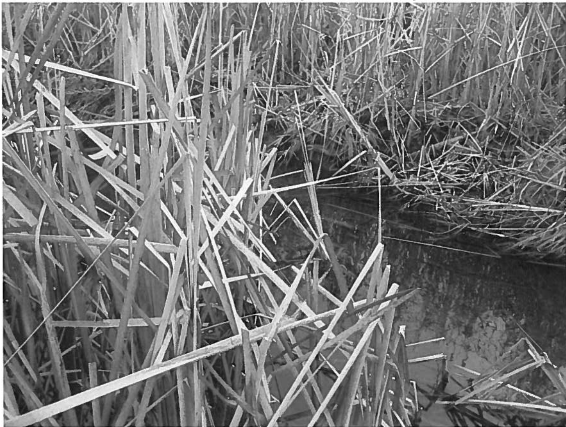
Photo 28: Stream S014, an UNT to East Branch Nimishillen Creek, downstream north.