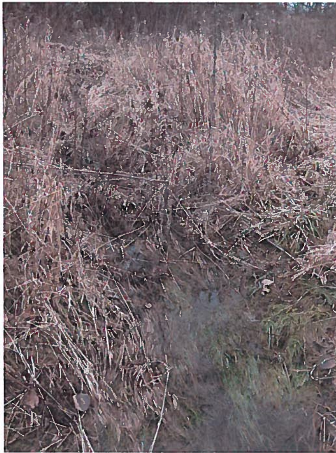
Photo 35: Stream S017, an UNT to East Branch of Nimishillen Creek, upstream view north.