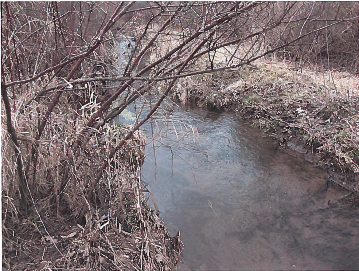
Photo 39: Stream S019, an UNT to Middle Branch Nimishillen Creek, view north.