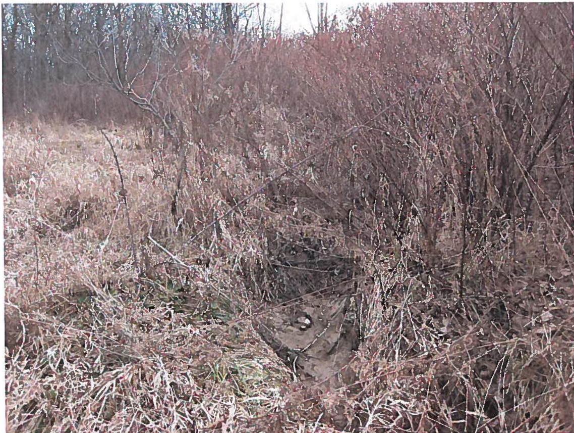
Photo 30: Stream S015, an UNT to East Branch Nimishillen Creek, view east upstream.