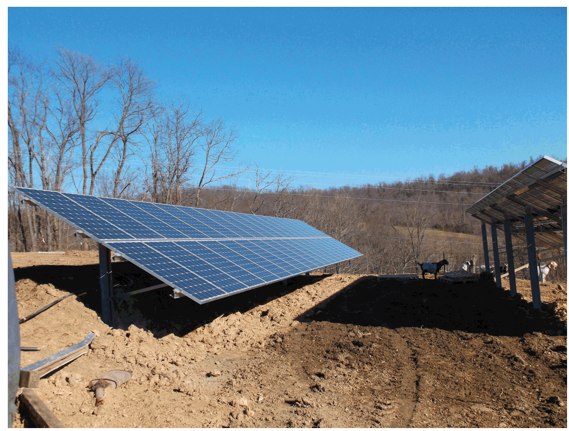
November 16, 2012

The Applicant is applying for certification in Ohio for a facility using one of the following qualified resources or technologies (Sec. 4928.01 ORC):