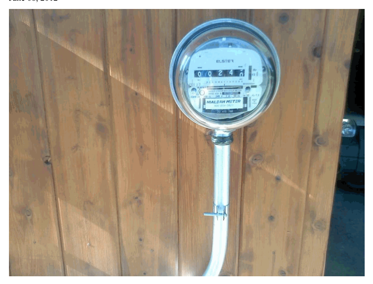
June 08, 2012

N.1.e Report the total meter reading number at the time the photograph was taken and specify the appropriate unit of generation (e.g., kWh): 240.0 KWH