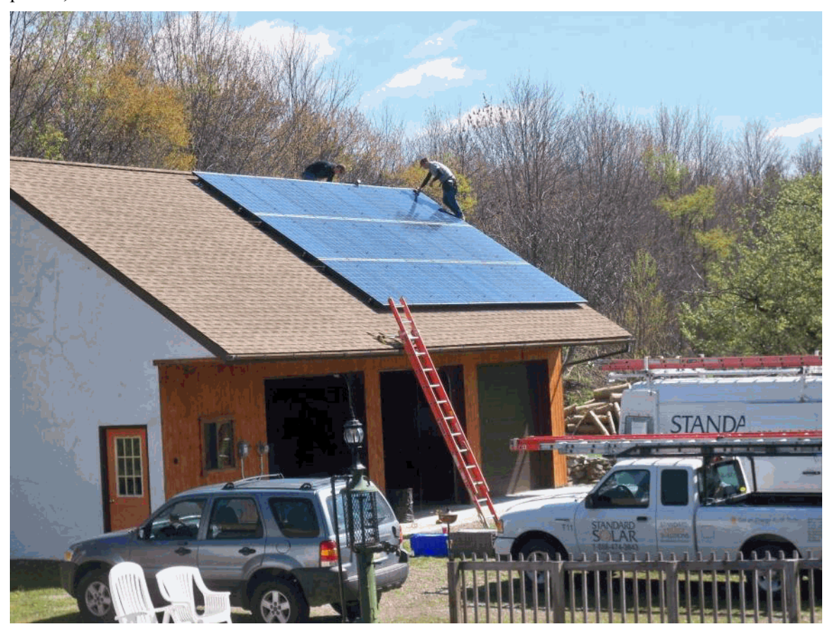
The Applicant is applying for certification in Ohio for a facility using one of the following qualified resources or technologies (Sec. 4928.01 ORC):