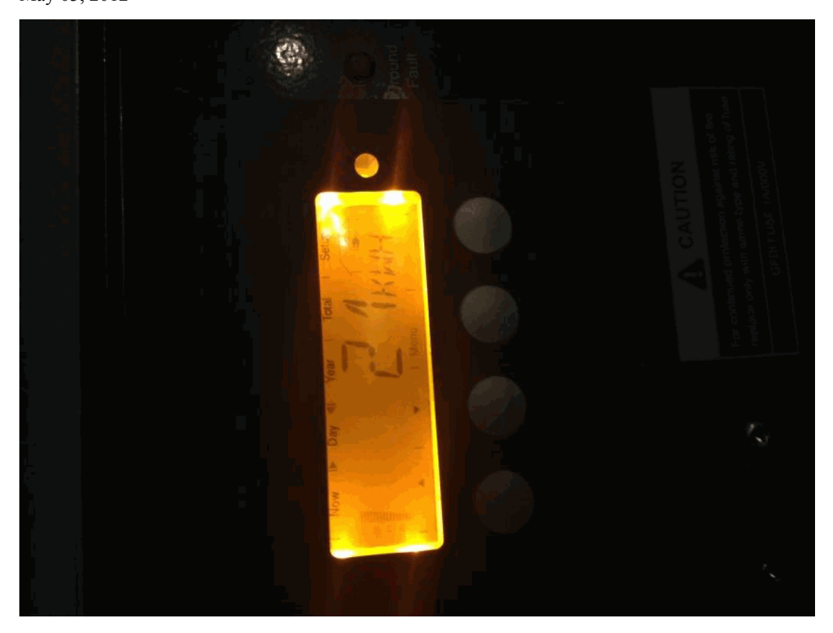
May 03, 2012

N.1.e Report the total meter reading number at the time the photograph was taken and specify the appropriate unit of generation (e.g., kWh): 21.0 KWH