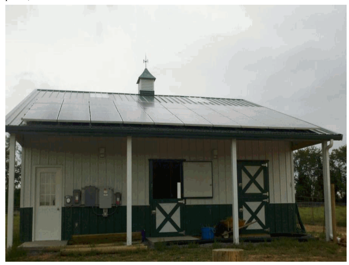
The Applicant is applying for certification in Ohio for a facility using one of the following qualified resources or technologies (Sec. 4928.01 ORC):