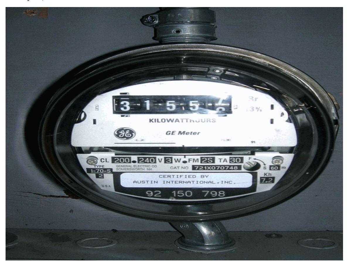
January 16, 2012

N.1.e Report the total meter reading number at the time the photograph was taken and specify the appropriate unit of generation (e.g., kWh): 31577