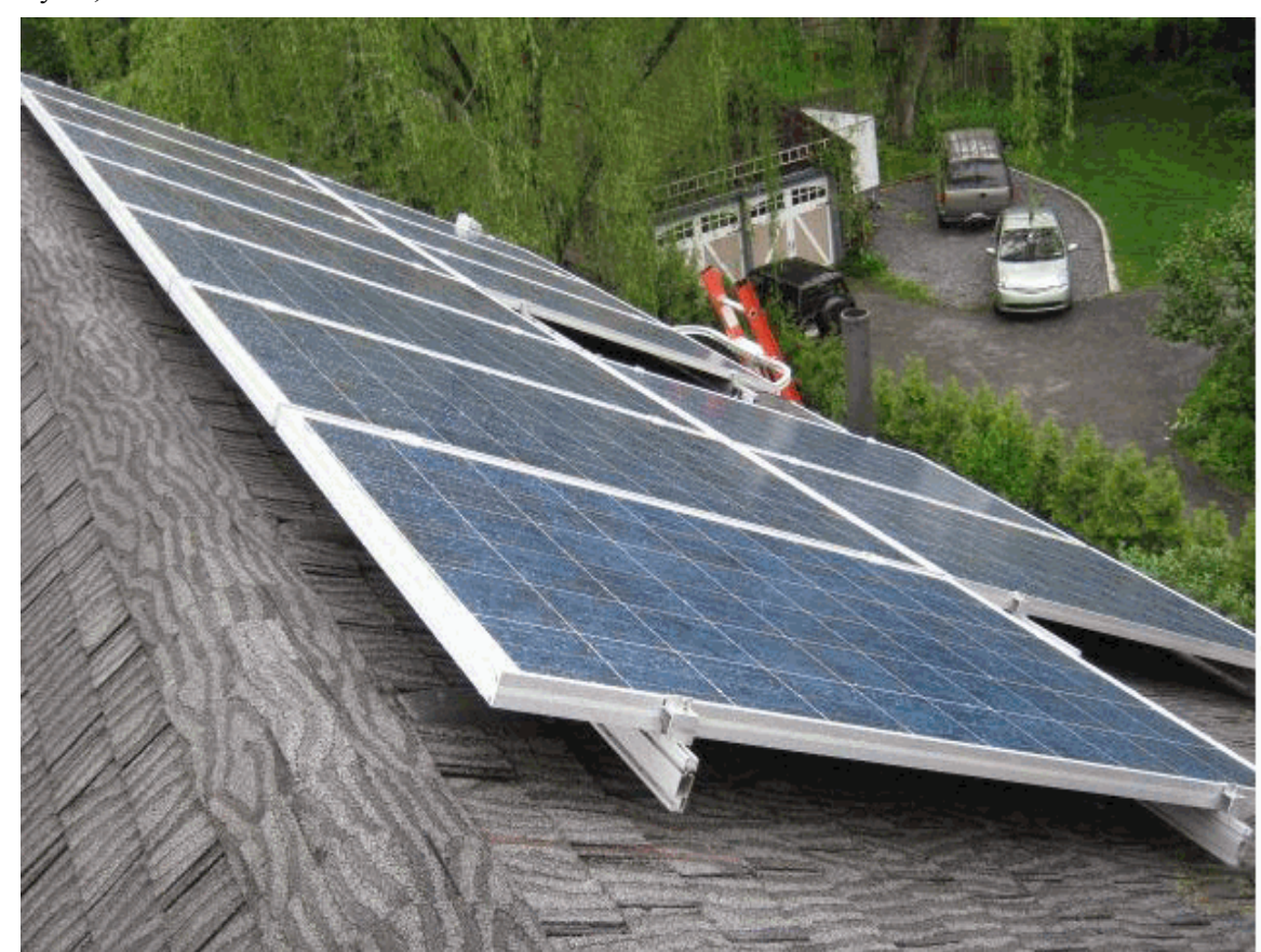
The Applicant is applying for certification in Ohio for a facility using one of the following qualified resources or technologies (Sec. 4928.01 ORC):