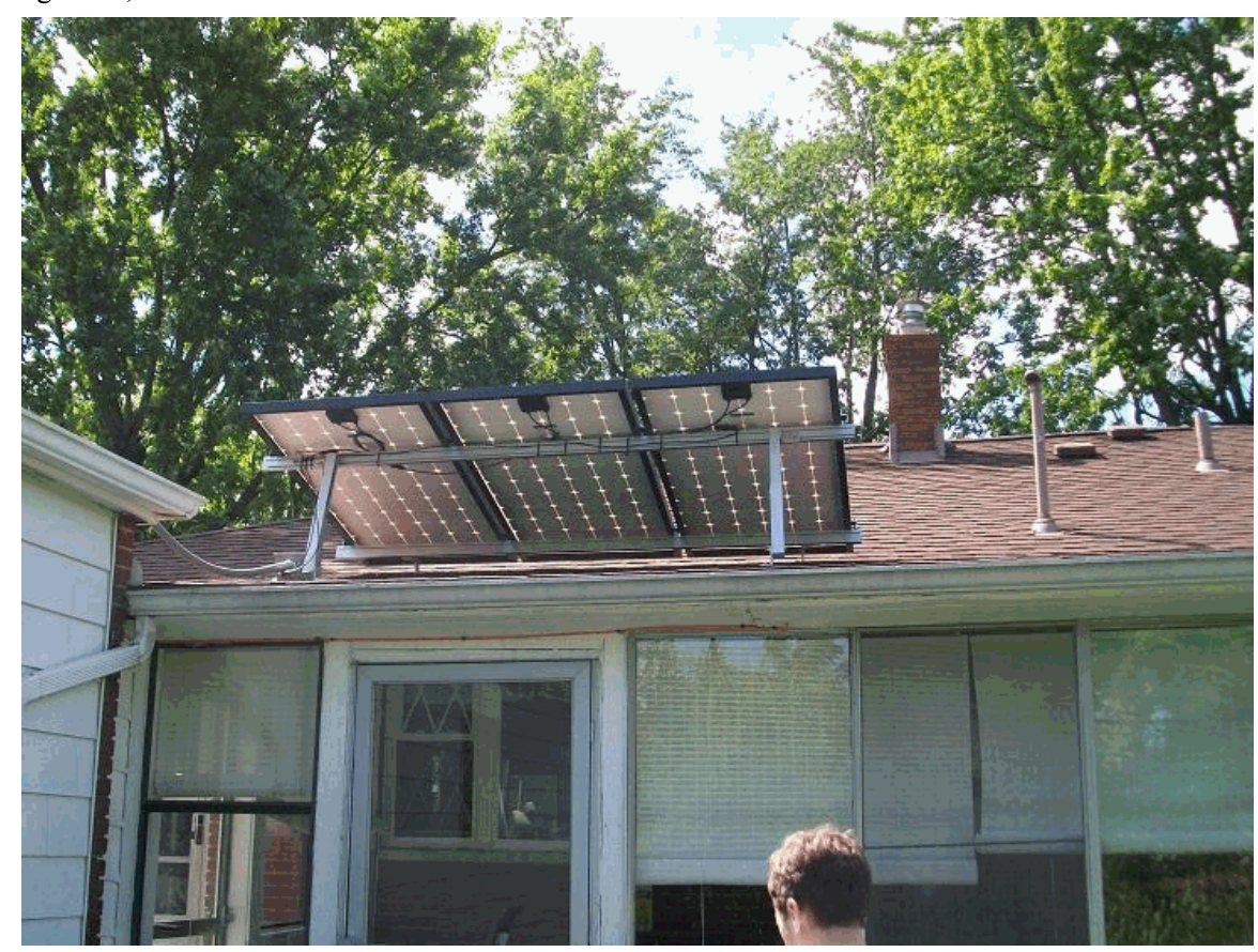
August 18, 2011