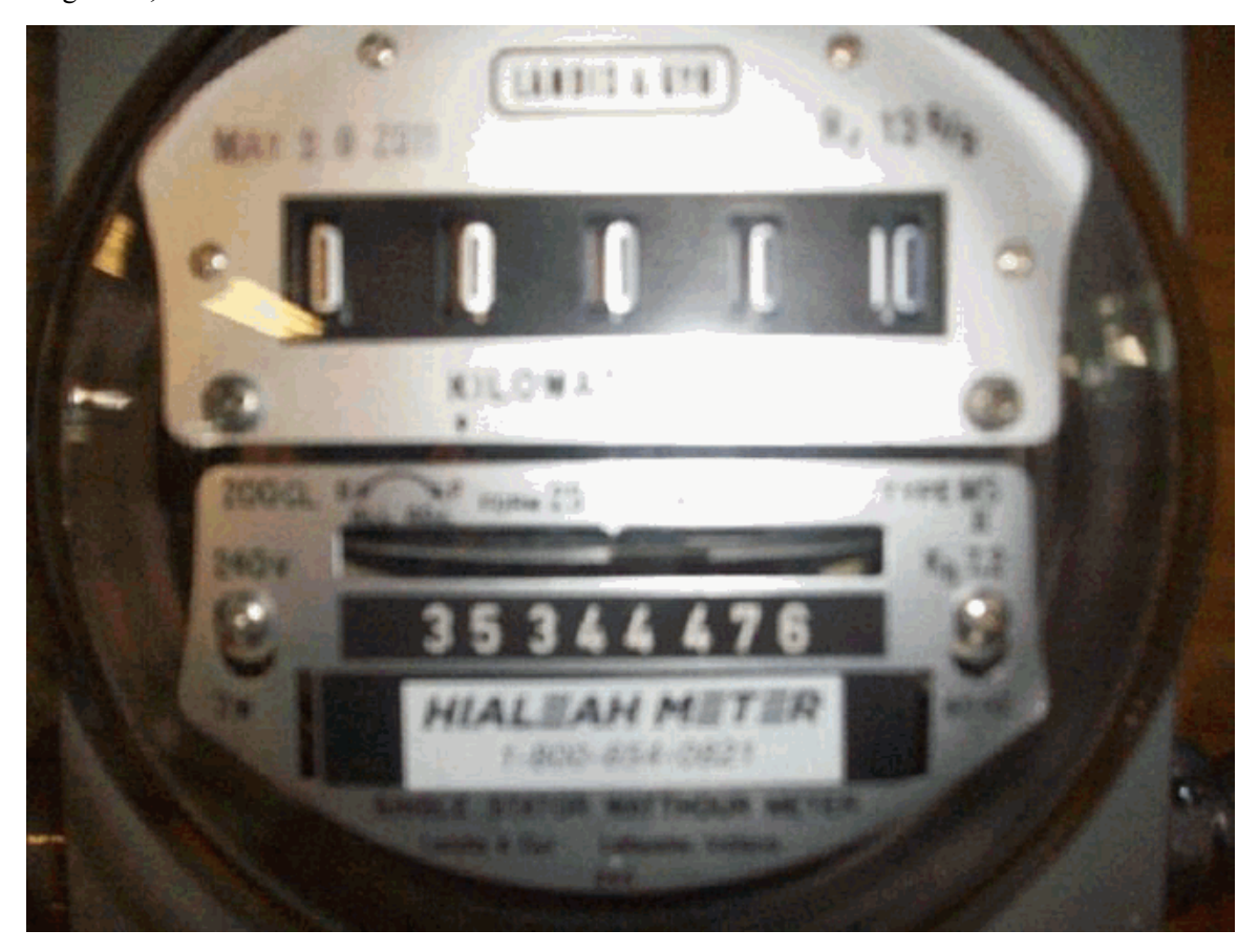
August 18, 2011

N.1.e Report the total meter reading number at the time the photograph was taken and specify the appropriate unit of generation (e.g., kWh): 0