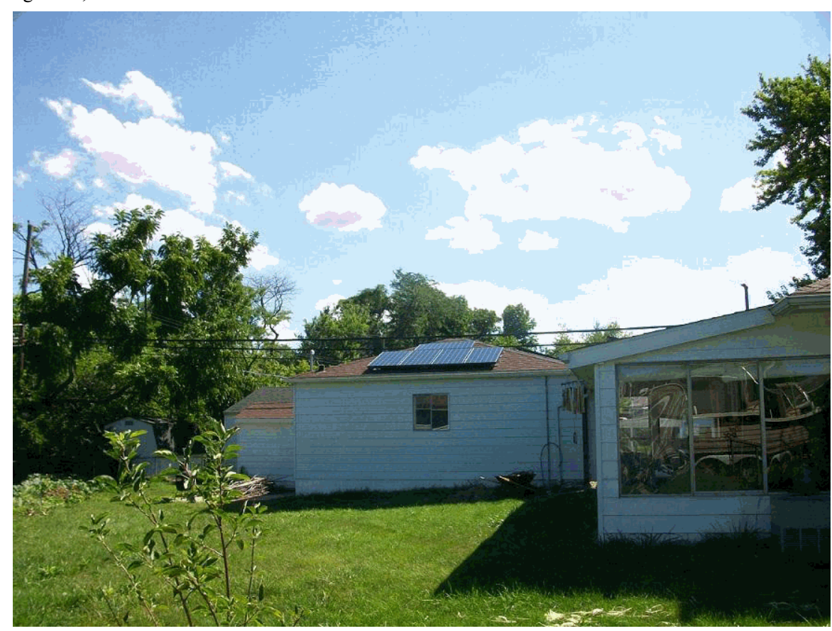
August 18, 2011