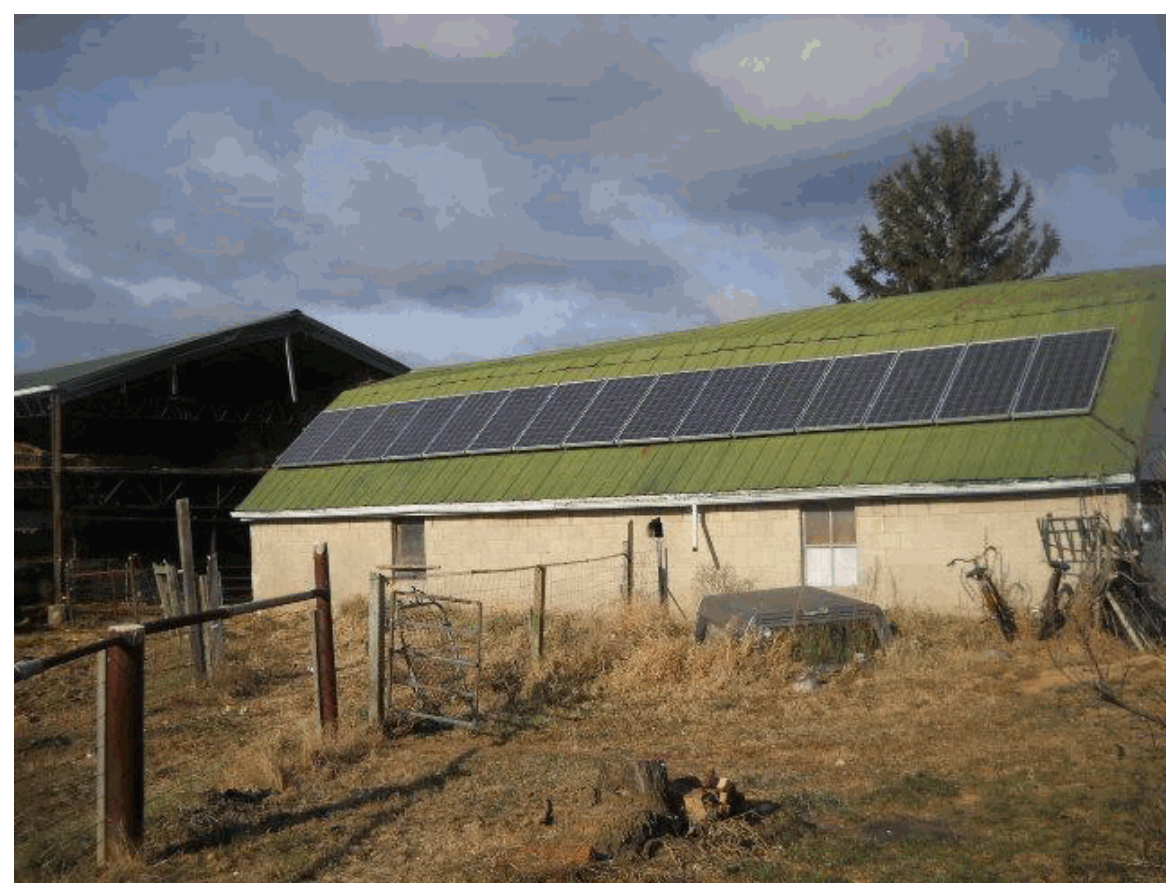
December 07, 2010

The Applicant is applying for certification in Ohio for a facility using one of the following qualified resources or technologies (Sec. 4928.01 ORC):