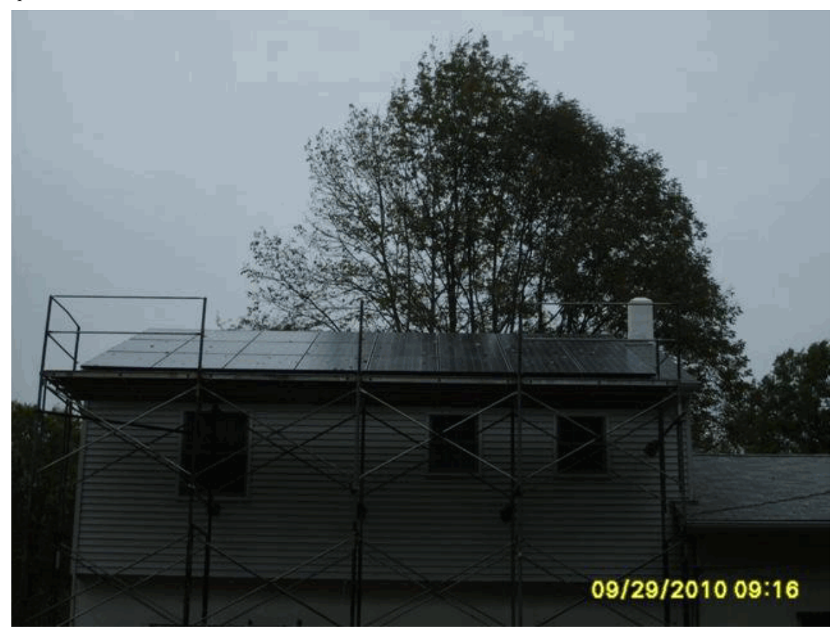
September 29, 2010

The Applicant is applying for certification in Ohio for a facility using one of the following qualified resources or technologies (Sec. 4928.01 ORC):