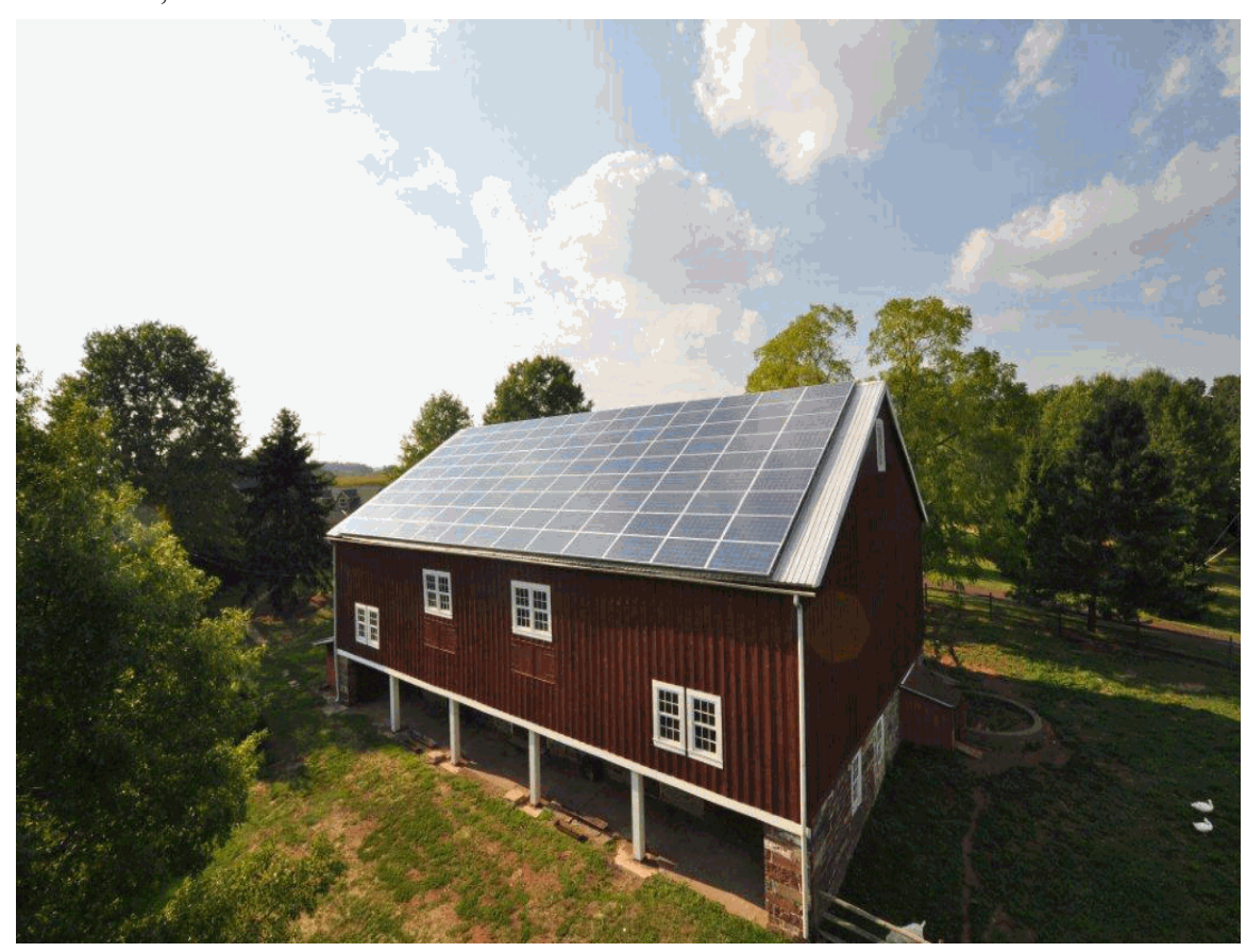
The Applicant is applying for certification in Ohio for a facility using one of the following qualified resources or technologies (Sec. 4928.01 ORC):