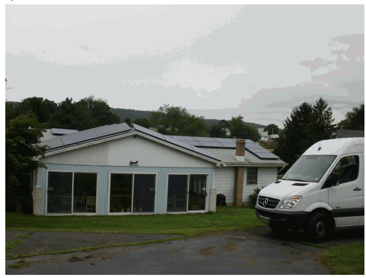
August 13, 2010

The Applicant is applying for certification in Ohio for a facility using one of the following qualified resources or technologies (Sec. 4928.01 ORC):