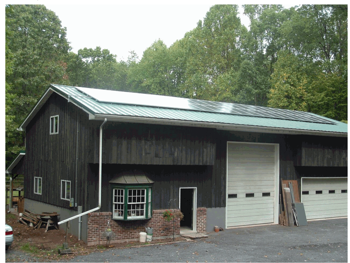
The Applicant is applying for certification in Ohio for a facility using one of the following qualified resources or technologies (Sec. 4928.01 ORC):