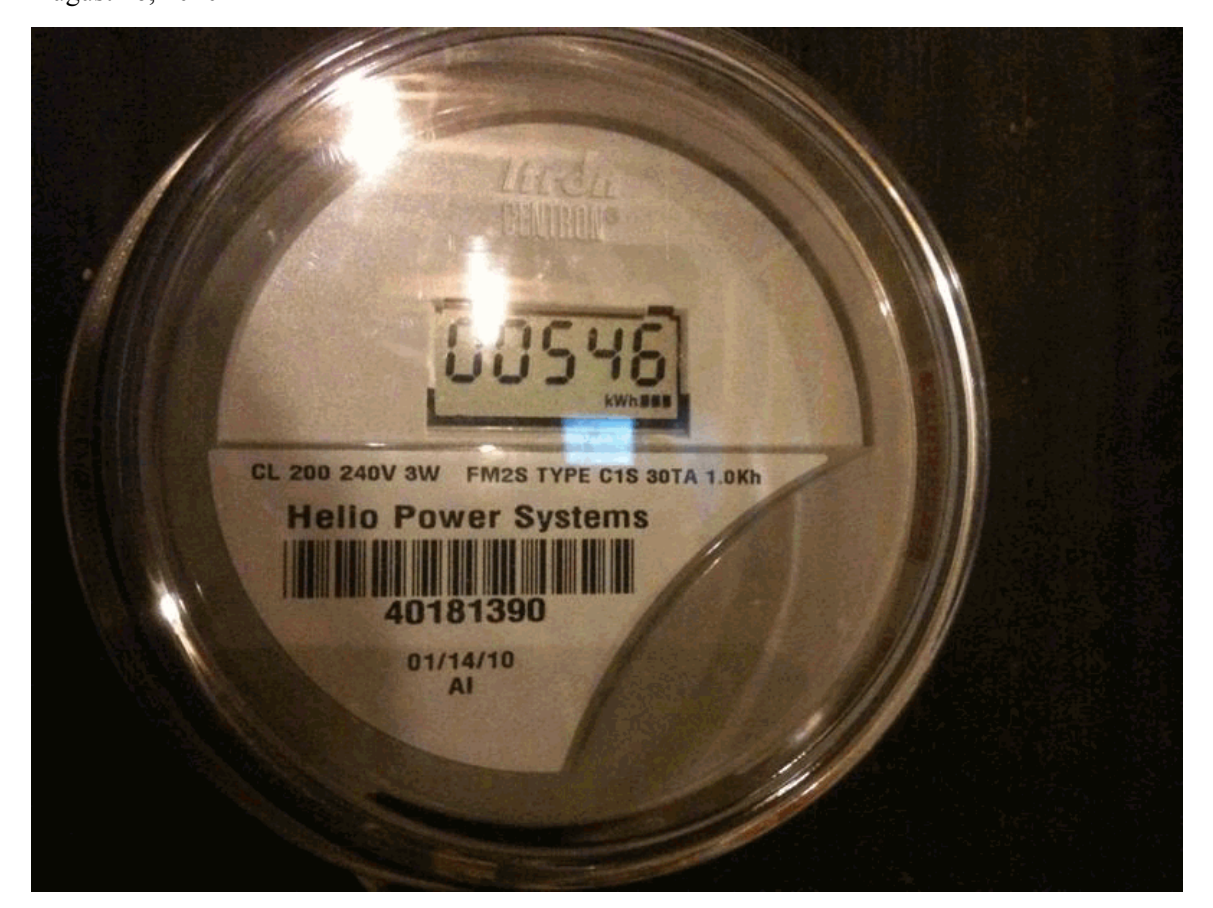
August 16, 2010

N.1.e Report the total meter reading number at the time the photograph was taken and specify the appropriate unit of generation (e.g., kWh): 546