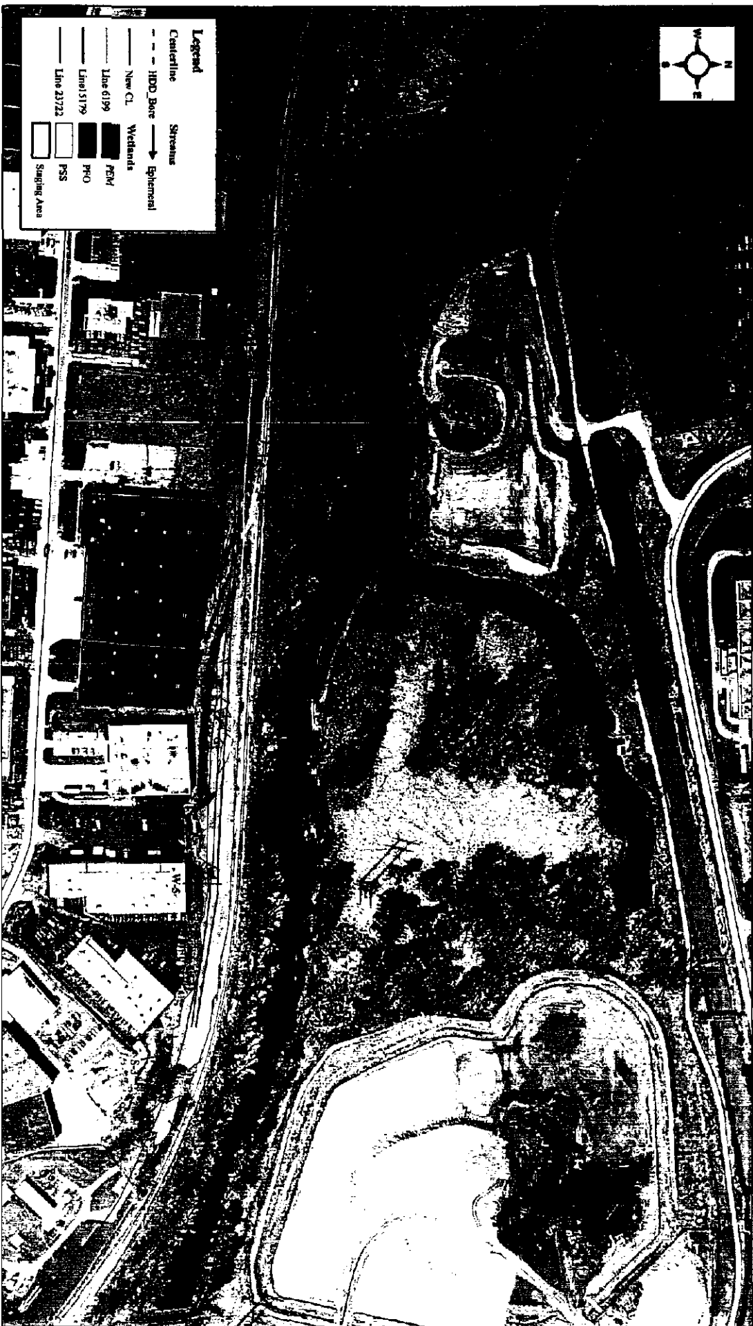
Figure 1 East Ohio Gas Company 49th Street HDD Bore Project Project Location Cuyahoga County, Ohio 2006 Aerial Map 12,410 Environment and Archaeology, LLC