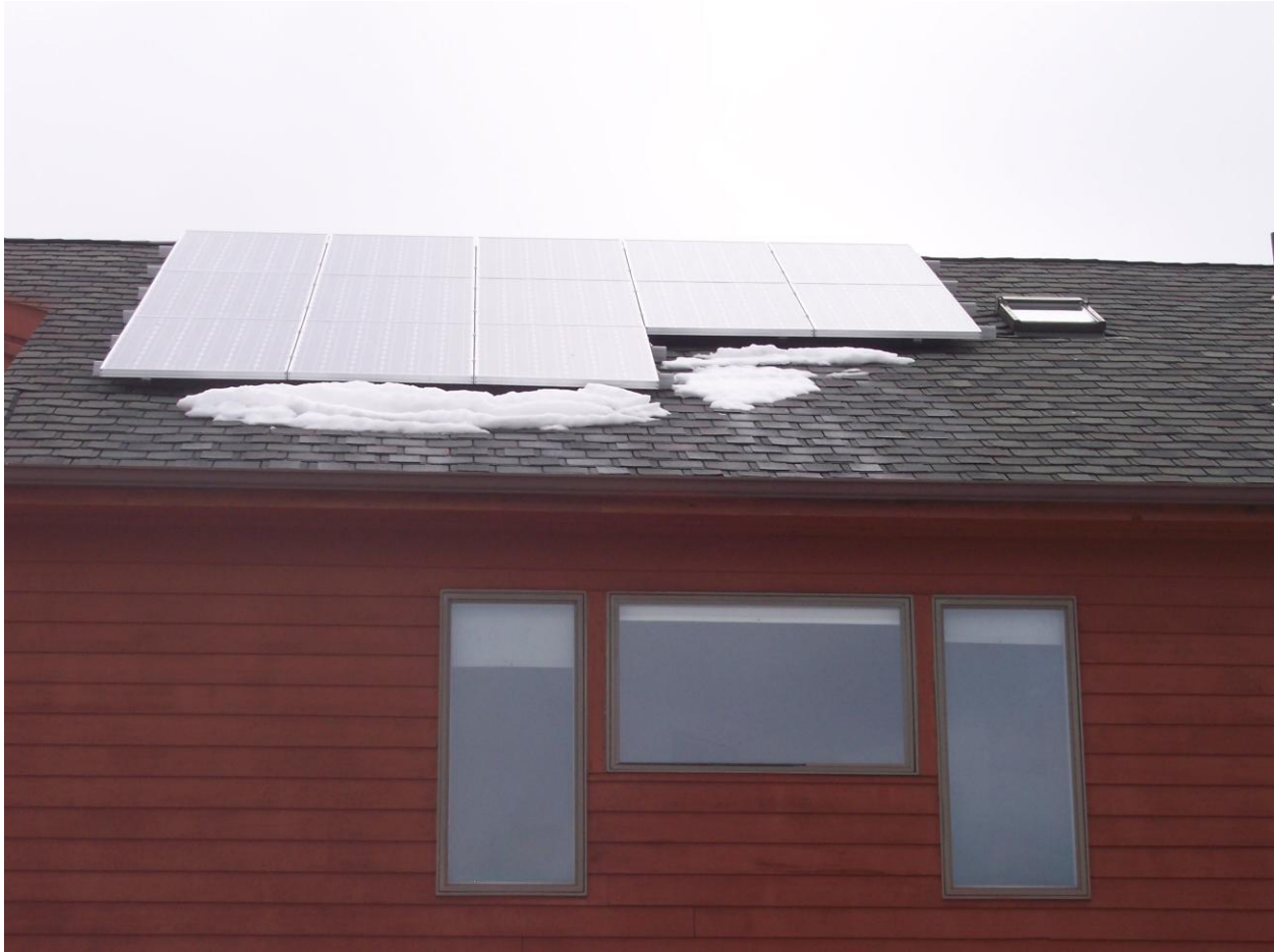
Residence Roof mounted panels

The Applicant is applying for certification in Ohio based on the following qualified resource or technology (Sec. 4928.01 O.R.C.):