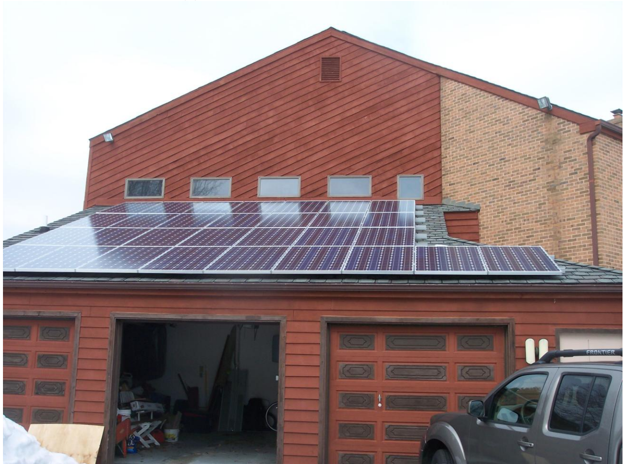
Garage Roof mounted panels