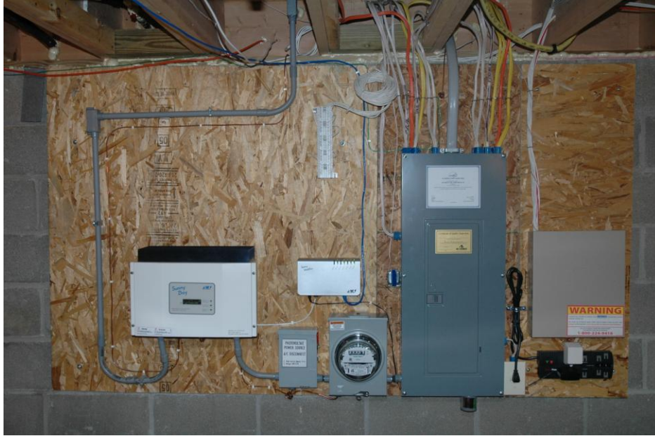
Inverter, SMA WebBox Data Logger, GE I-70-S Meter – Photo Taken December 14, 2009

The Applicant is applying for certification in Ohio based on the following qualified resource or technology (Sec. 4928.01 O.R.C.):