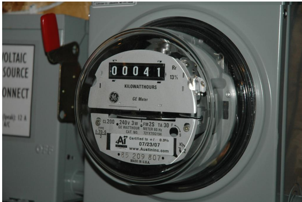
GE I-70-S Meter, 41 kWh – Photo Taken January 30, 2010

Manufacturer: SMA Serial Number: 1374225634 Type: SunnyBoy 2100U Inverter Integrated Date of Last Certification: 03/2006