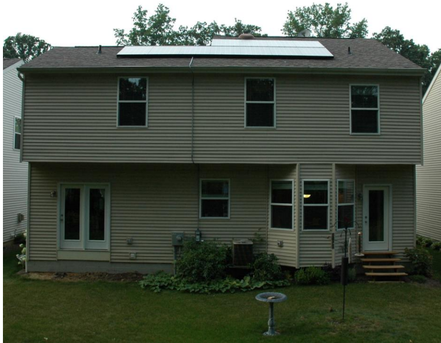
PV Array – Photo Taken August 6, 2006