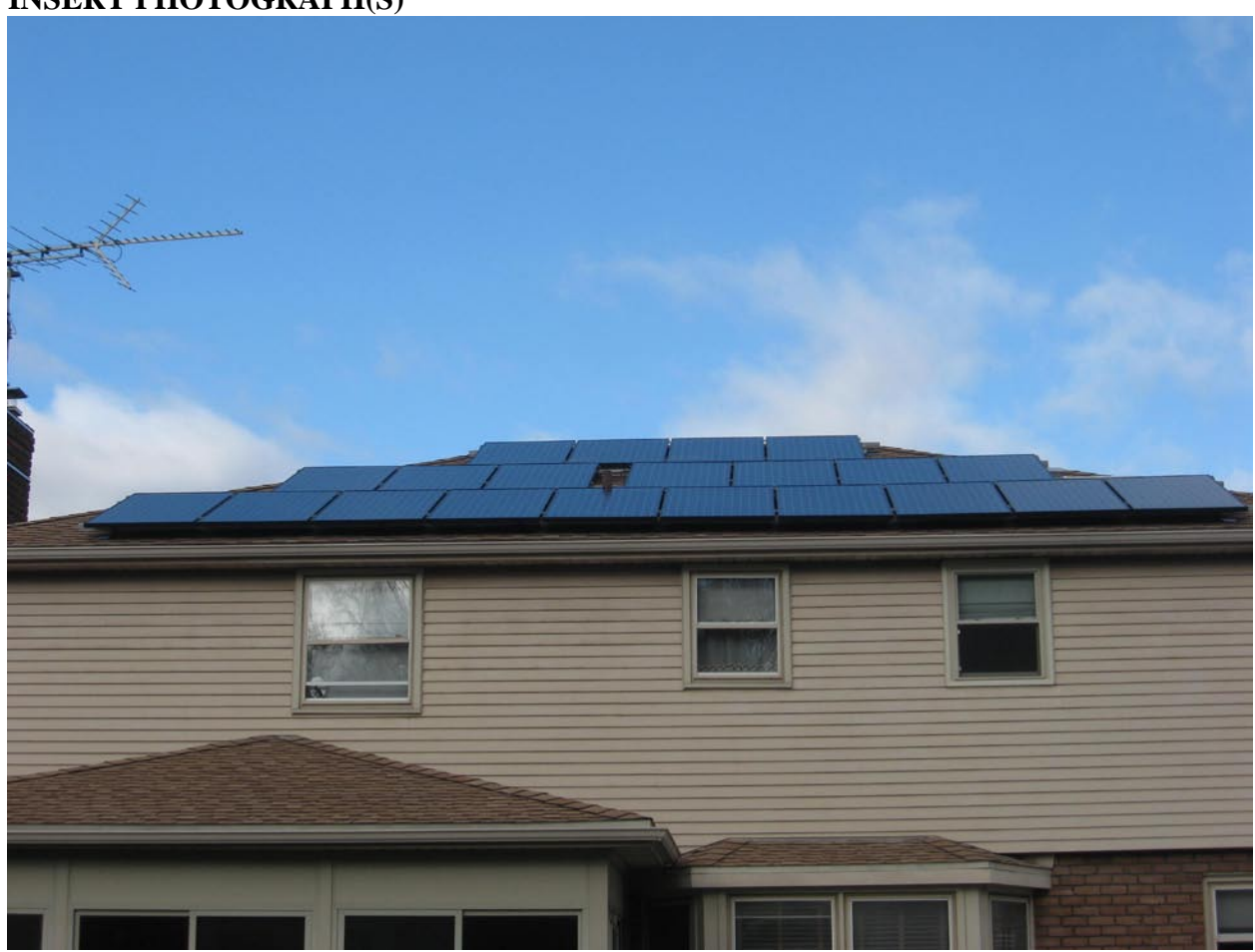
Photograph taken 1/18/10

The Applicant is applying for certification in Ohio based on the following qualified resource or technology (Sec. 4928.01 O.R.C.):