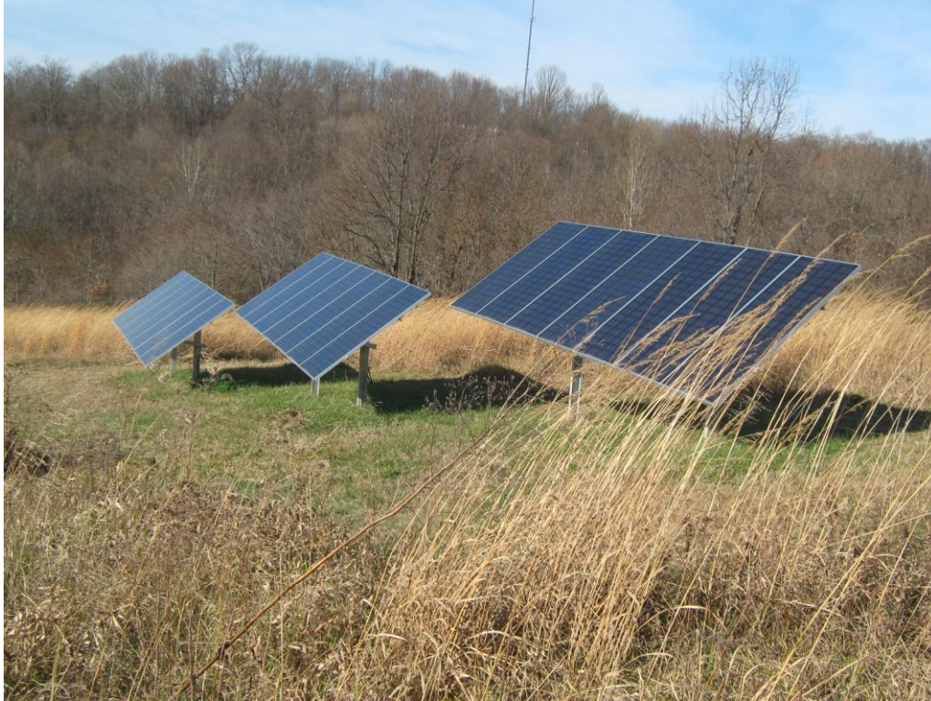
Figure 2: PV Array West of the House taken 11-29-09