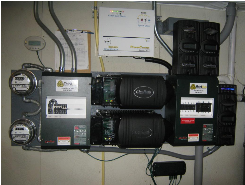
Figure 3: Panel in Garage with Modules and Inverters, taken 11-29-09