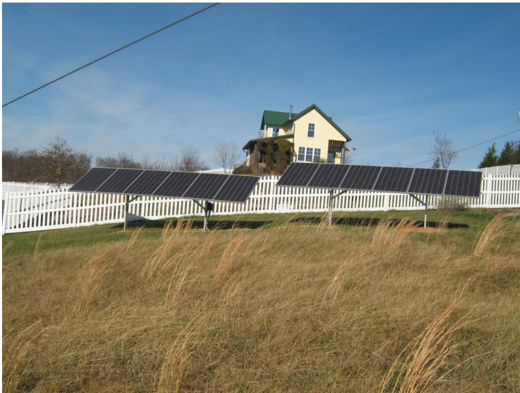
Figure 1: PV Array South of the House, taken 11-29-09

G.3. Please attach digital photographs that depict an accurate characterization of the renewable generating facility. Please indicate the date(s) the photographs were taken. For existing facilities, these photographs must be submitted for your application to be reviewed. For proposed facilities or those under construction, photographs will be required to be filed within 30 days of the on-line date of the facility.