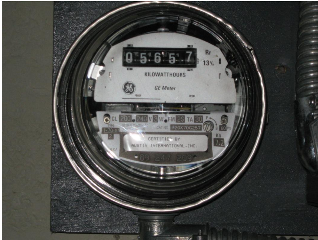
Figure 5: Bottom Meter for Recording Output, taken 11-29-09

The Public Utilities Commission of Ohio reserves the right to verify the accuracy of the data reported to the tracking system and to the PUCO.