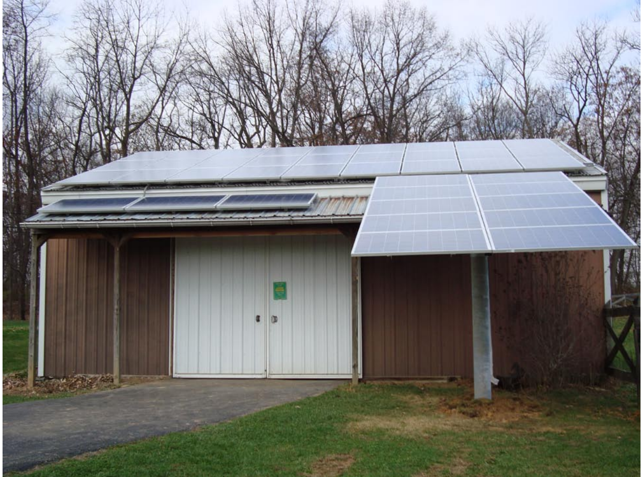
Photograph taken 11/27/09

proposed facilities or those under construction, photographs will be required to be filed within 30 days of the on-line date of the facility.