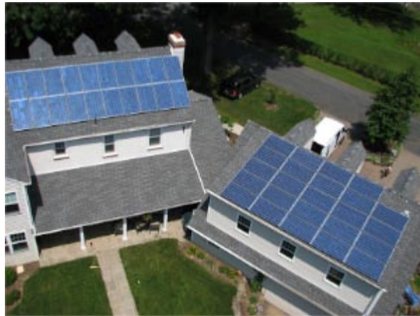
Photograph taken 9/10/09

G.3. Please attach digital photographs that depict an accurate characterization of the renewable generating facility. Please indicate the date(s) the photographs were taken. For existing facilities, these photographs must be submitted for your application to be reviewed. For proposed facilities or those under construction, photographs will be required to be filed within 30 days of the on-line date of the facility.