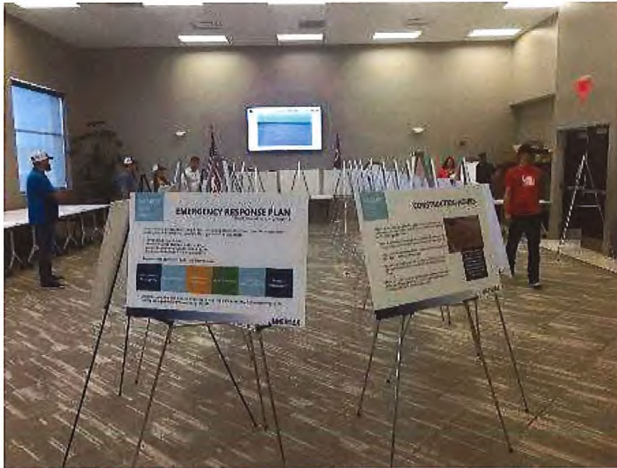
Photo: Public Information Session – Presentation / Information Posters