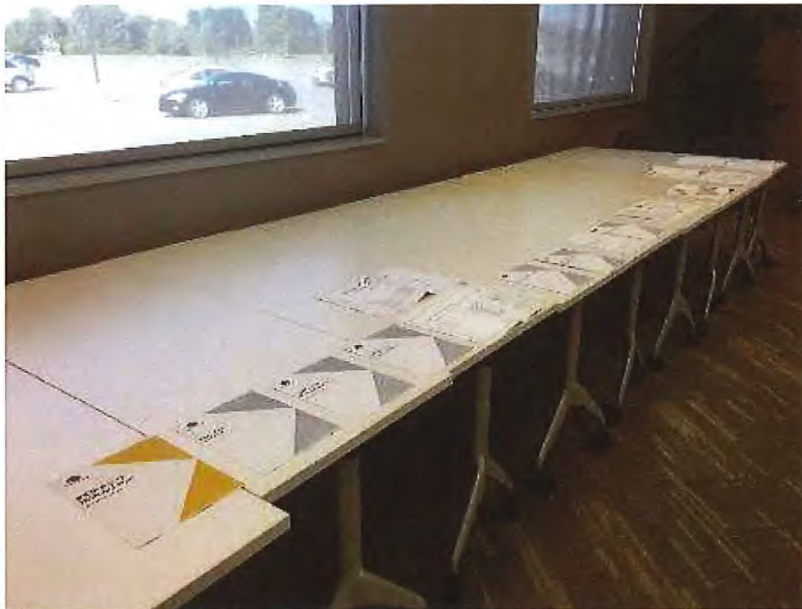
Photo: Public Information Session - Draft Construction Management Plans available for review