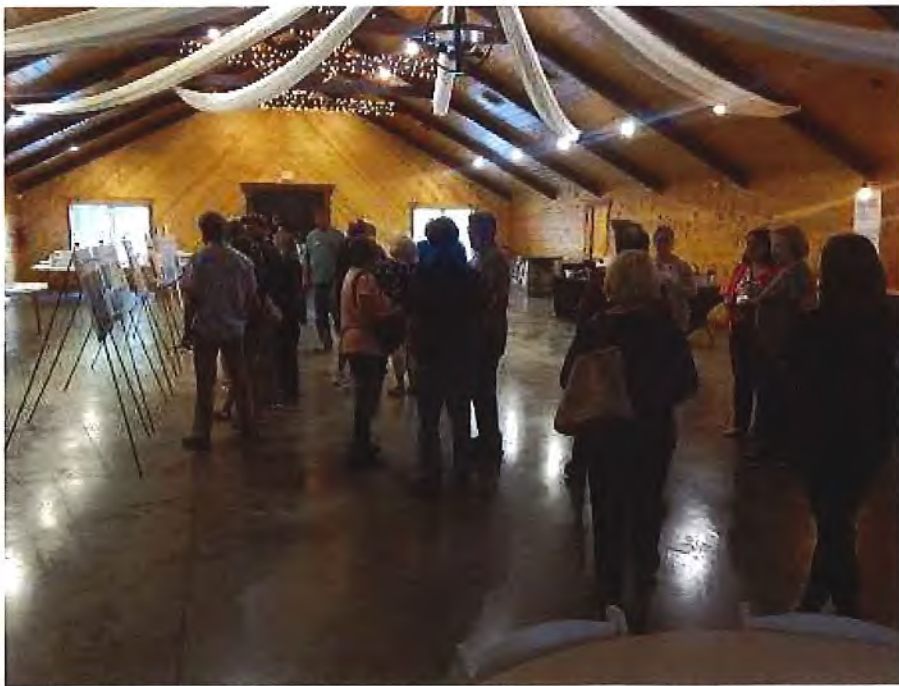
Photo: Landowner BBQ Event - Project team members engaging in discussion with attendees