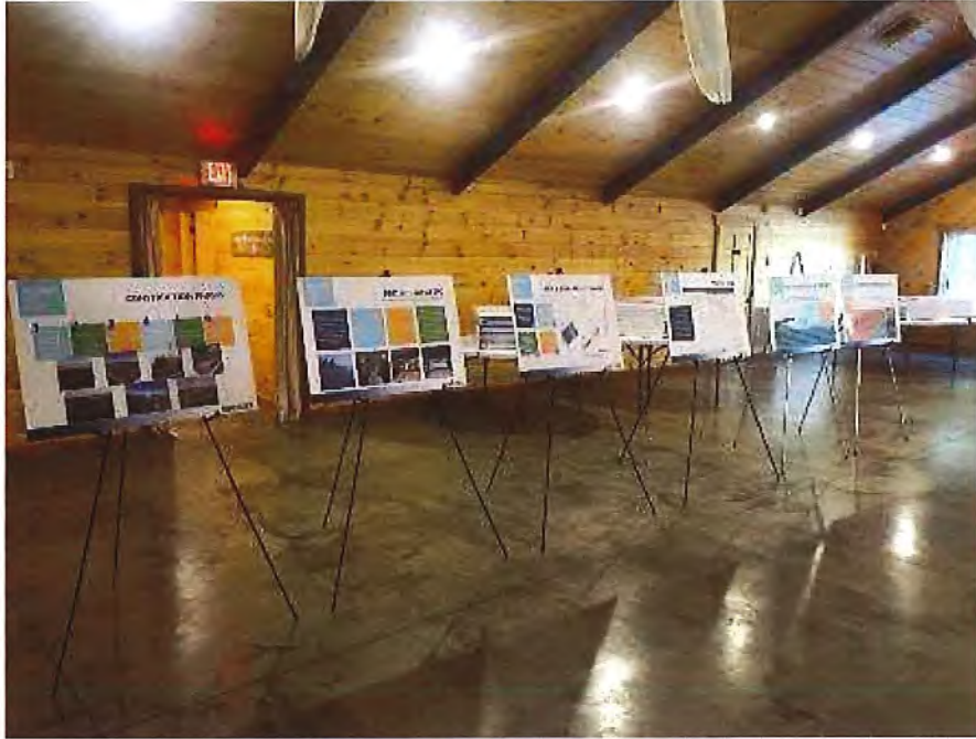
Photo: Landowner BBQ Event - Information Posters