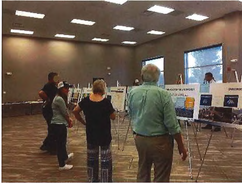
Photo: Public Information Session - Project team members engaging in discussion with attendees