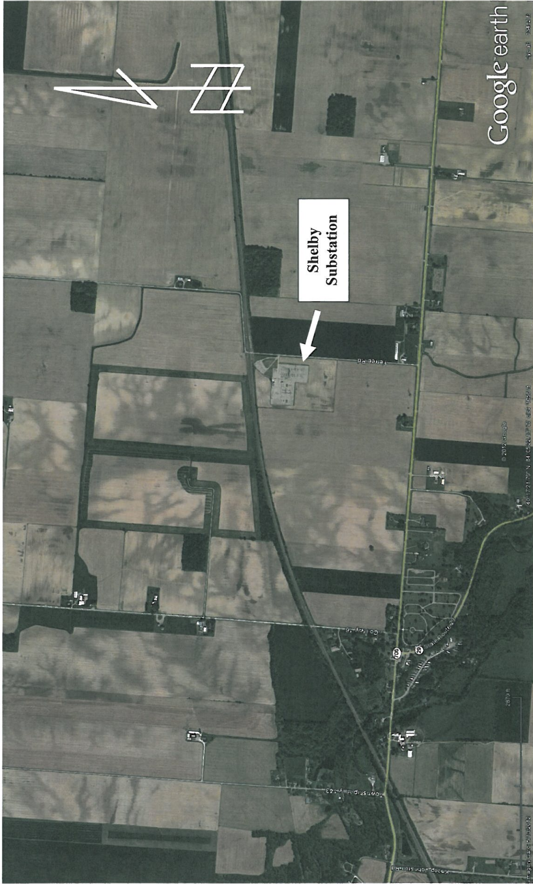
Exhibit – 1 Shelby Substation – Aerial