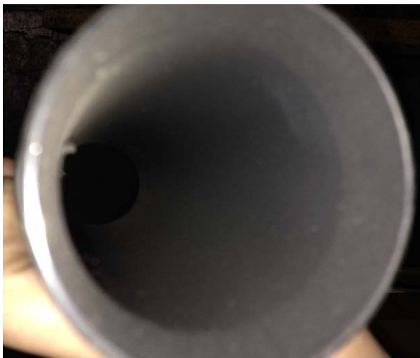
Fortron Coated Coupling New