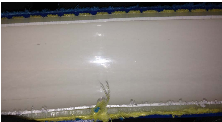
Fortron Remained Un-affected after Testing