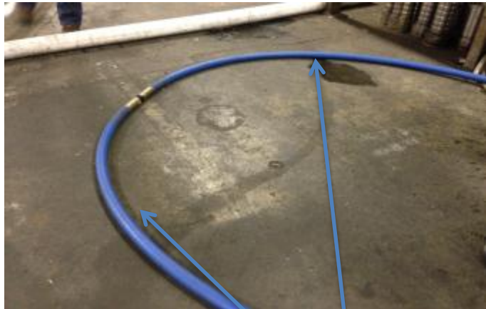
Test Loop with Nylon and Fortron Liners