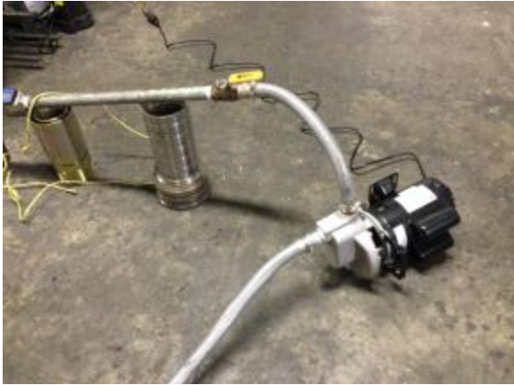
Pump Set Up