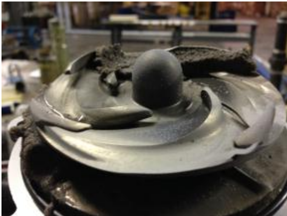
Eroded Pump Impeller