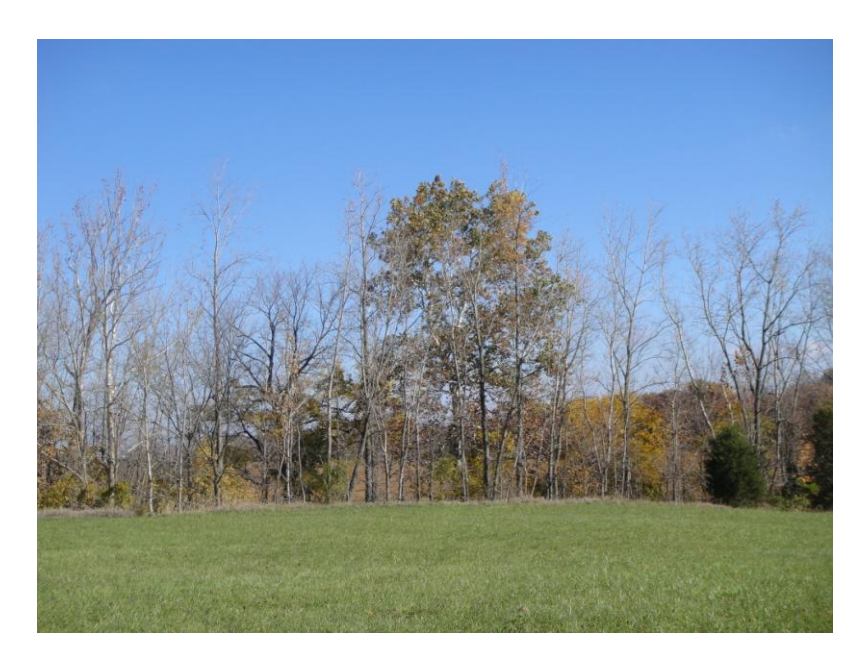
This is a view from the field looking north toward the creek.