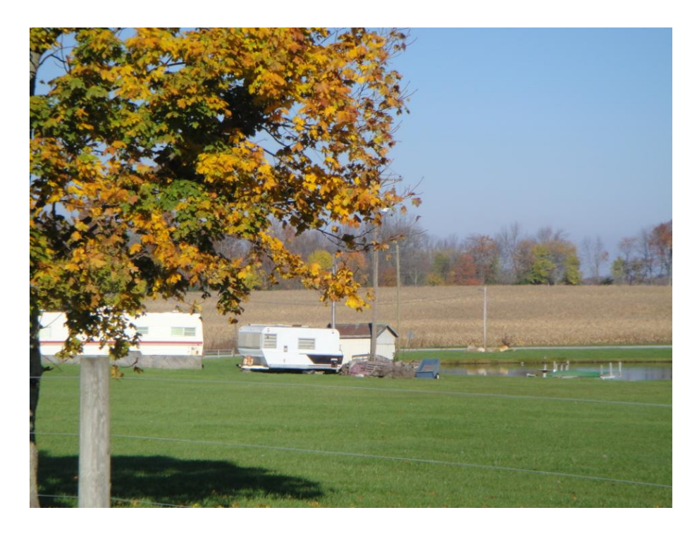
Turning further to the west, the fishing camp comes into view. Note that as Ault Road winds around the camp and turns north, it can be seen in the background behind the lake.