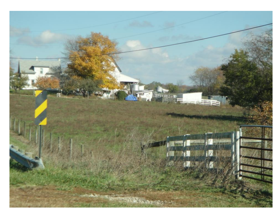
This view is from the gate looking north-northeast and reflects the field where cattle may graze periodically.