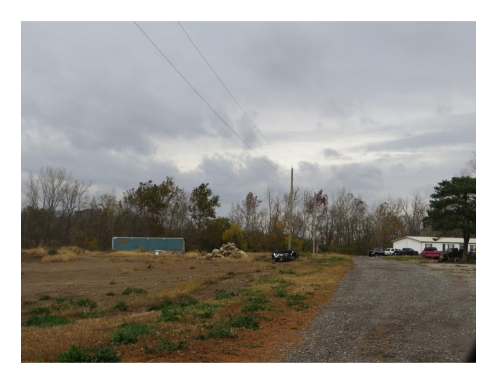
This view is of the area where some kind of construction or demolition may have taken place. This view is looking east from Bullard Rutan Road from the south side of the farm.