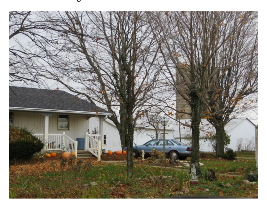
This is the home located to the south of the field where the monitor was placed. In the background one can see farm buildings. It is a large and active farm.