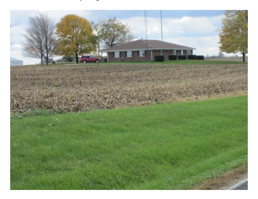
Position 4 - 773 Yocom Road owned by Roger E. Yocom, a leaseholder.

An anemometer is located on the south side of the house but it is not visible in Hessler Figure 2.2.4a. The monitor was located at the south edge of this field. It appears the 2012 crop was corn and the 2011 crop would have been beans. Hessler's photos look like the bean crop had not yet been harvested but may have been during the monitoring period.