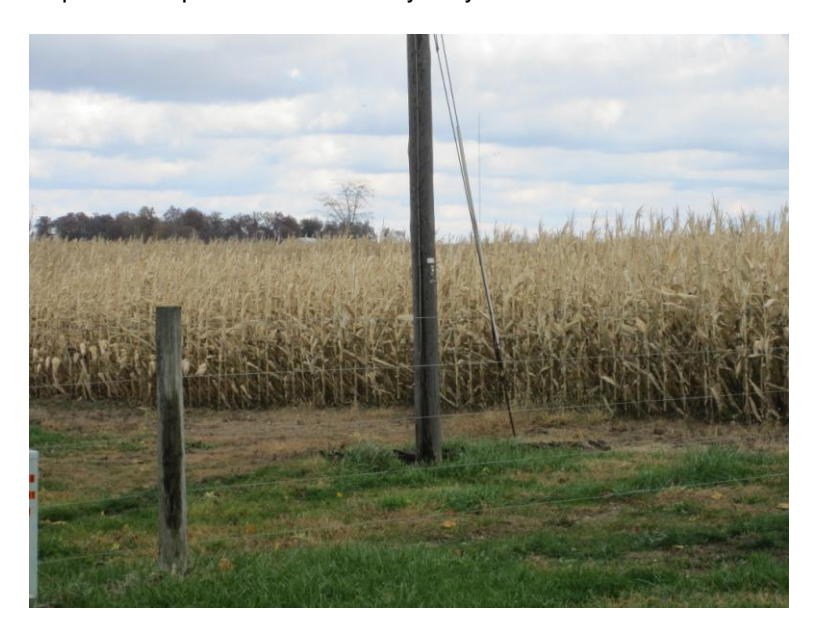
Position 2 - Ault Road at the bend owned by Carl Oberly of Delaware, Ohio. Property includes a small fishing camp across the road from 1108 Ault Road (owned by Richard Saunders). Oberly property is contiguous to the Don Roberts property to the east. Roberts is a leaseholder whose daughter worked for Invenergy as a land acquisition representative. Oberly may be a leaseholder.

This view is from the bend in Ault Road looking north-northeast similar to Hessler's Figure 2.2.2b. The difference is that corn is the 2012 crop while soybeans were probably the crop in the field during 2011. It is difficult to tell from Hessler's photo whether the beans had been harvested. As of October 30, 2012, the corn had not been harvested.