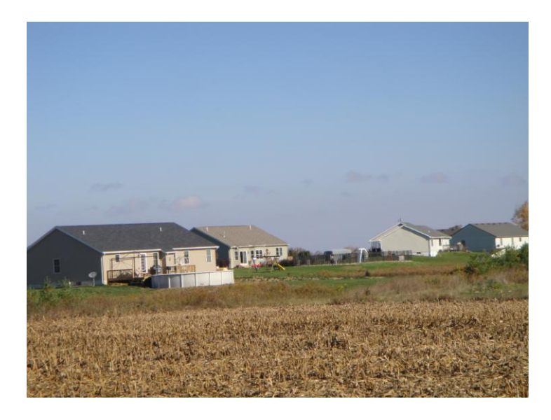
Position 7 - Bean Road, a populated road where a number of homes have been built recently. The monitor is situated between St Route 161 and Bean Road.

This is a view of the field where the monitor was placed looking to the northeast.