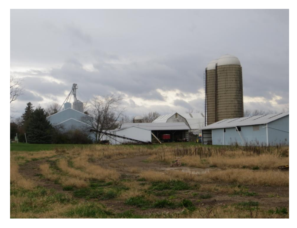
The view is from the south looking north. The sound monitor was located on the north side of this farm and home. There appears to have been some construction in this area.