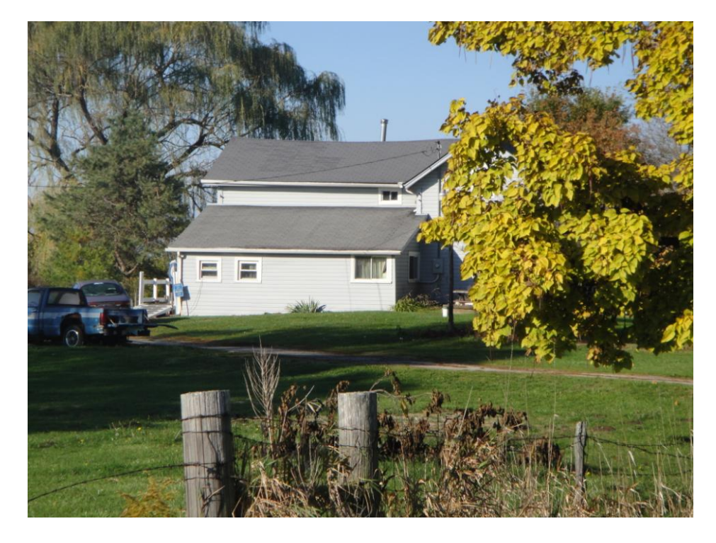
Looking southwest from the bend in Ault Road is a home with several dogs.