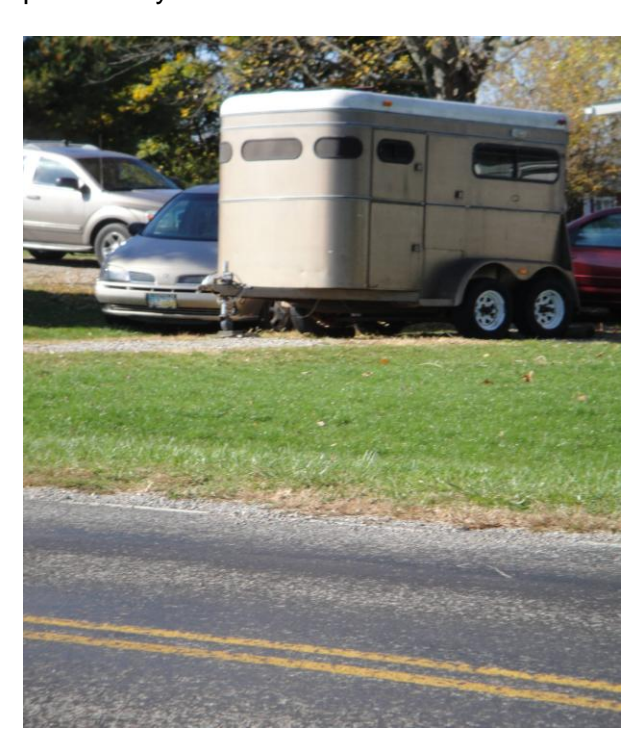
This view is looking west from the monitor to the home at the corner of Mutual Union and Mt. Vernon.