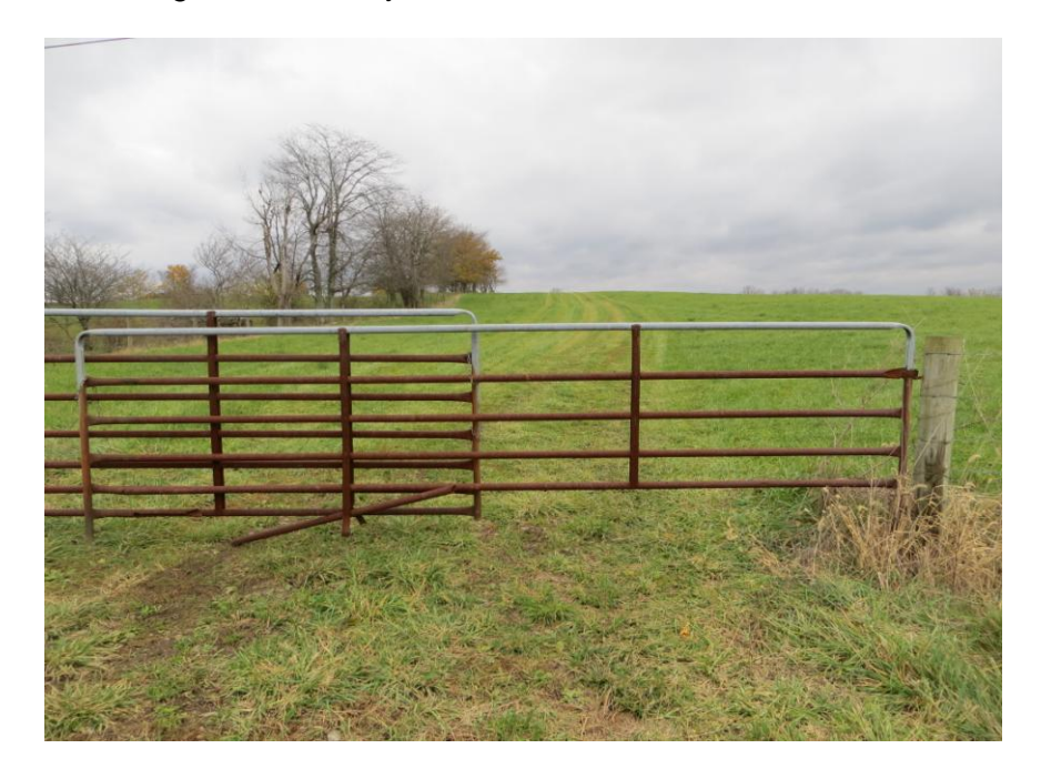
Position 1 - South Mutual Union and Mt. Vernon across from 1030 Mt. Vernon. Land is owned by leaseholder Jon Berry of 857 South Mutual Union Road. Berry farms and raises cattle that may, from time to time, graze in the adjacent field north of the monitor.

This view is standing at the side of Ault Road looking east. Hessler Figure 2.21b shows this gate open. You can see the tracks in the grass indicating that vehicles travel through. The sound monitor was positioned to the right of the gate post.