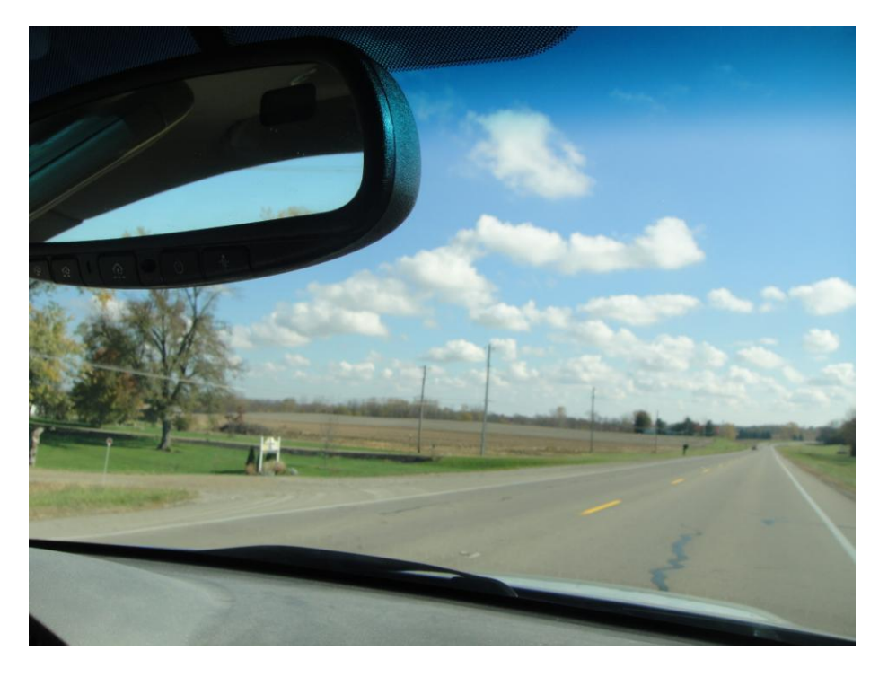
This view looks to the east on State Route 29. The B&B sign for Hopkins House is visible at the driveway entrance on the left.