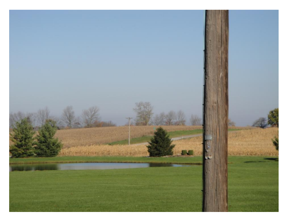
A view from the telephone pole near the monitor, looking to the northwest showing Ault Road.