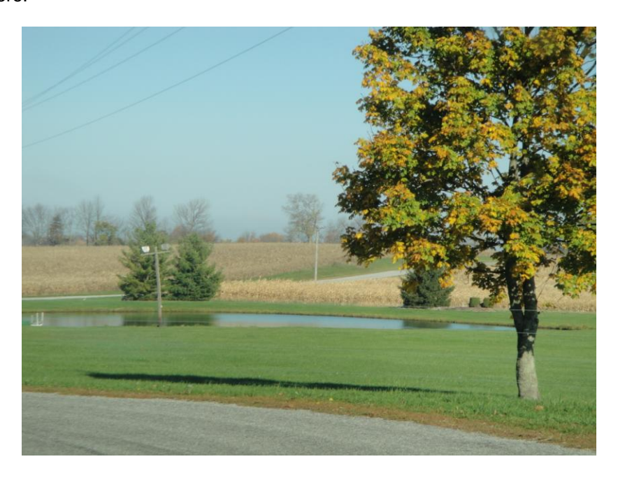
Standing at the bend in the road looking northwest, the small lake for the fishing camp can be seen.