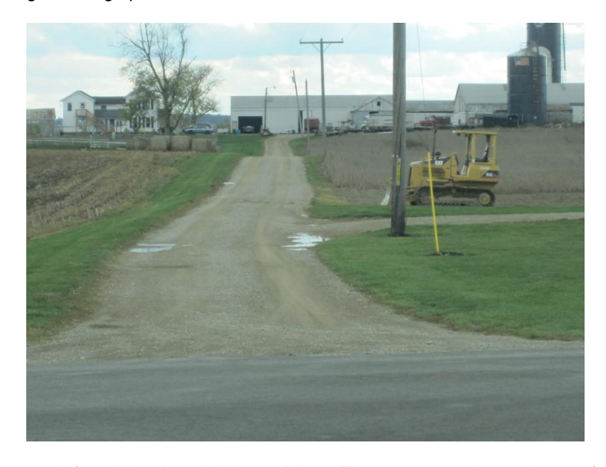
Position 3 - 6667 Urbana-Woodstock Road is owned by Paul Melby Ober. It is assumed to be a leased property. It is a large farming operation that sits back from the road.

This photo looks south from Woodstock-Urbana Pike. There are very large pieces of equipment. One large truck on the property can be seen in the garage bay at the left of the farm building. A semi is visible behind the telephone pole. The monitor was placed in the field on the left just south of the fence.