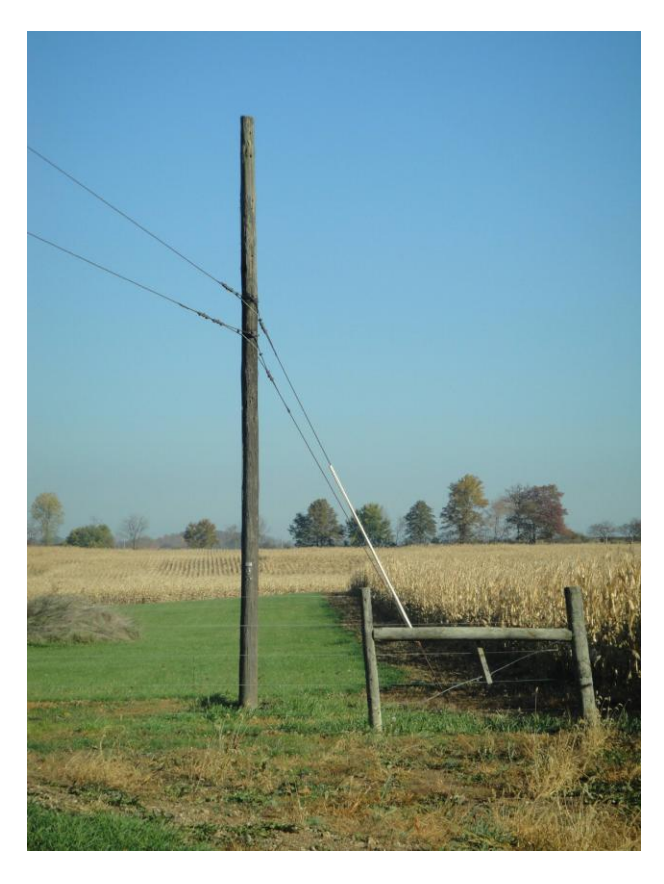
Another view from Ault Road looking north. It is difficult to tell if the board fence seen in Hessler Figure 2.2.2b is still there.