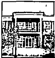
HIGHLAND COUNTY 1975 ADMINISTRATION BUILDING 1975