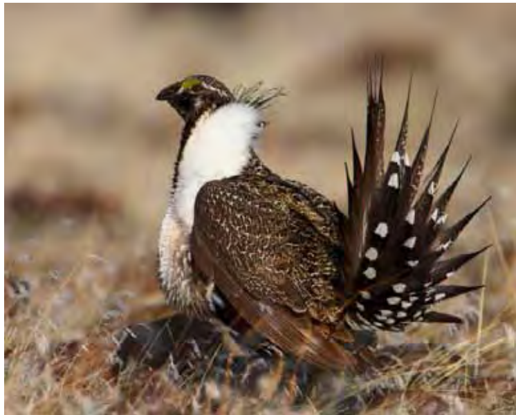
Greater sage grouse, Credit: Stephen Ting, USFWS