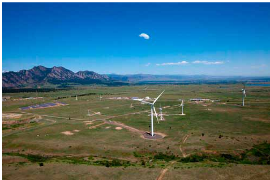
Open landscape with wind turbines.