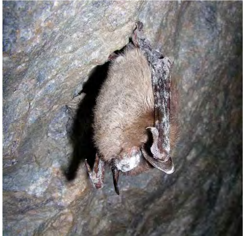
Little brown bat with white nose syndrome.