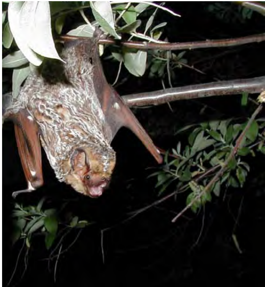
Hoary bat.

The commonly used data collection methods for estimating the spatial distribution and relative abundance of diurnal birds includes counts of birds seen or heard at specific survey points (point count), along transects (transect surveys), and observational studies. Both methods result in estimates of bird use, which are assumed to be indices of abundance in the area surveyed. Absolute abundance is difficult to determine for most species and is not necessary to evaluate species risk. Depending on the characteristics of the area of interest and the bird species potentially affected by the project, additional pre-construction study methods may be necessary. Point counts or line transects should collect vertical as well as horizontal data to identify