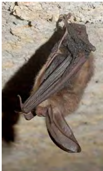
Virginia big-eared bat.

post-construction data in the areas of interest and reference areas is possible, then the Before-After-Control-Impact (BACI) is the most statistically robust design. The BACI design is most like the classic manipulative experiment. 6 In the absence of a suitable reference area, the design is reduced to a Before-After (BA) analysis of effect where the differences between pre- and post-construction parameters of interest are assumed to be the result of the project, independent of other potential factors affecting the assessment area. With respect to BA studies, the key question is whether the observations taken immediately after the incident can reasonably be expected within the expected range for the system (Manly 2009). Reliable quantification of impact usually will include additional study