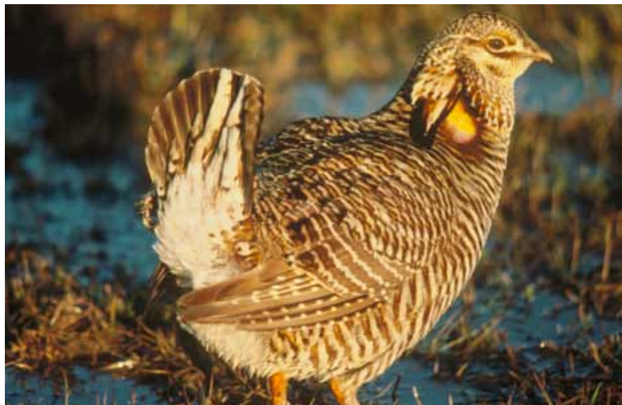
Attwater's prairie chicken.

Some areas may be inappropriate for large scale development because they have been recognized according to scientifically credible information as having high wildlife value, based solely on their ecological rarity and intactness (e.g., Audubon Important Bird Areas, The Nature Conservancy portfolio sites, state wildlife action plan priority habitats). It is important to identify such areas through the tiered approach, as reflected in Tier 1, Question 2 below. Many of North America's native landscapes are greatly diminished, with some existing at less than 10 percent of their pre-settlement occurrence.