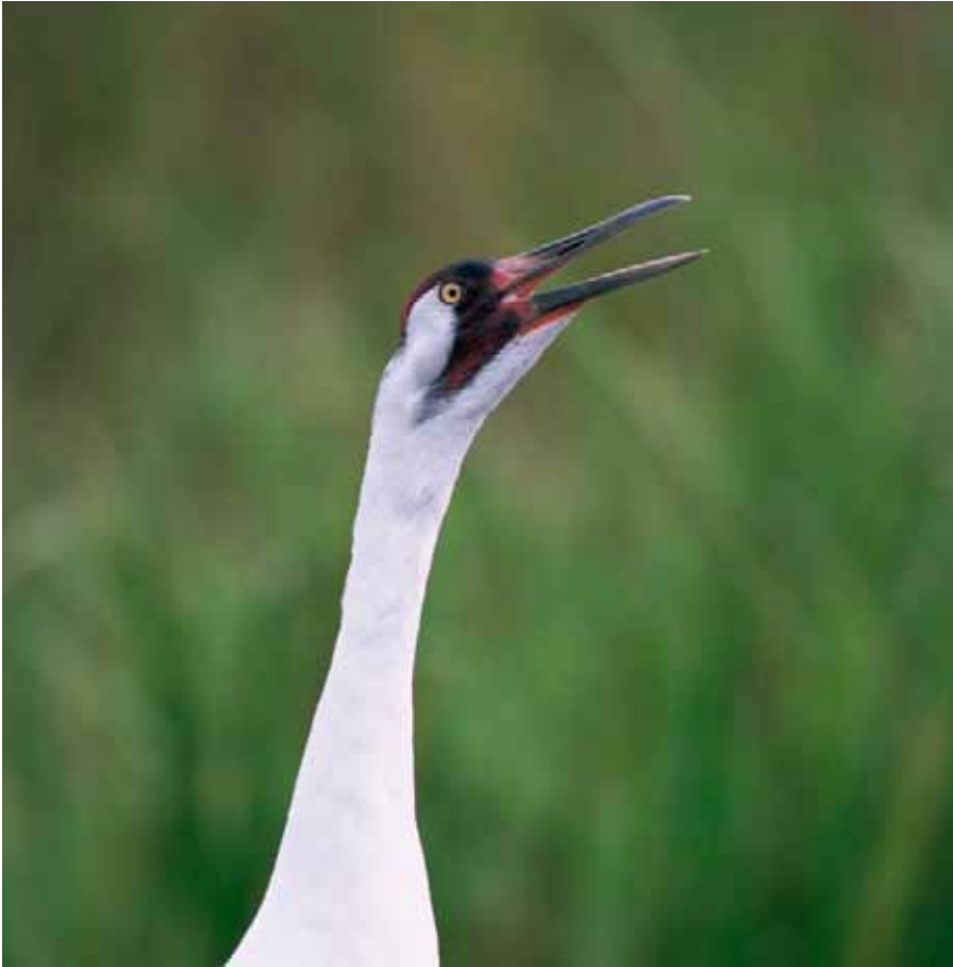
Whooping crane.

At some projects, bat fatalities are higher than bird fatalities, but the exposure risk of bats at these facilities is not fully understood (National Research Council (NRC) 2007). Horn et al. (2008) and Cryan (2008) hypothesize that bats are attracted to turbines, which, if true, would further complicate estimation