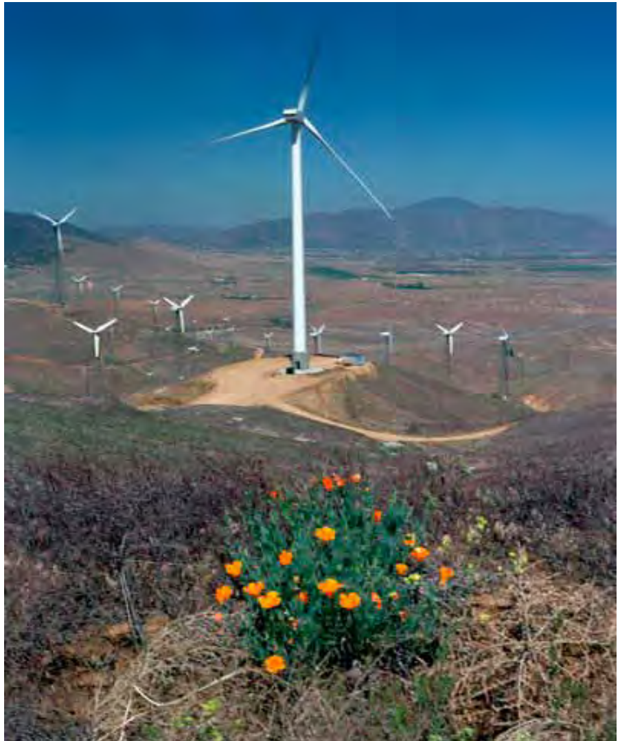
Wind turbines and habitat.

Impacts of a project will have population level effects if the project causes a population decline in the species of concern. For non-listed species, this assessment will apply only to the local population.