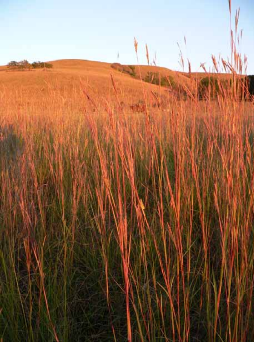
Tall grass prairie.

resources; and the additional resources listed in Appendix C: Sources of Information Pertaining to Methods to Assess Impacts to Wildlife of this document, or through contact of agencies and NGOs, to determine the presence of high priority habitats for species of concern or conservation areas.