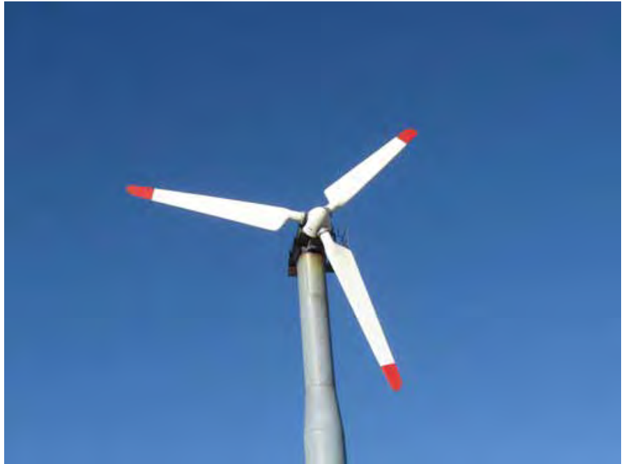
Wind turbine in California..

Federally-recognized Indian Tribes enjoy a unique government-to-government relationship with the United States. The United States Fish and Wildlife Service (Service) recognizes Indian tribal governments as the authoritative voice regarding the management of