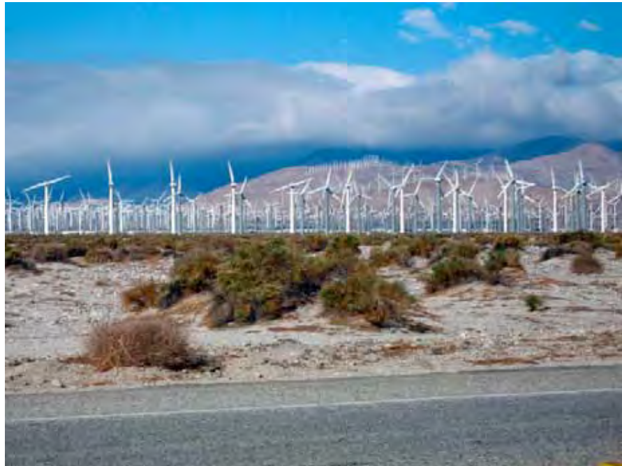
Rows of wind turbines.

Specific study designs will vary from site to site and should be adjusted to the circumstances of individual projects. Study designs will depend on the types of questions, the specific project, and practical considerations. The most common considerations