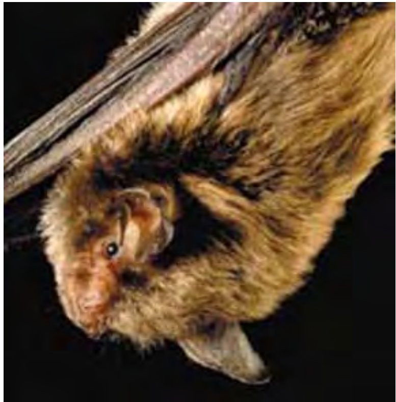
Indiana bat.

The Endangered Species Act (16 U.S.C. 1531–1544; ESA) was enacted by Congress in 1973 in recognition that many of our Nation's native plants and animals were in danger of becoming extinct. The ESA directs the Service to identify and protect these endangered and threatened species and their critical habitat, and to provide a means to conserve their ecosystems. To this end, federal agencies are directed to utilize their authorities to conserve listed species, and ensure that their actions