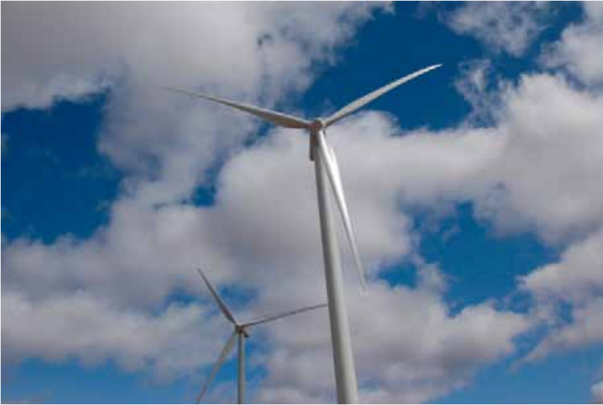
Wind turbines in California.

assessment of risk posed to species of concern and their habitats.