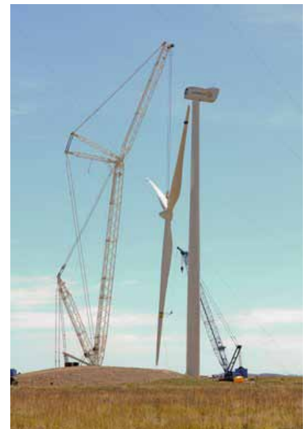
Towers are being lifted as work continues on the 2 MW Gamesa wind turbine that is being installed at the NWTCC.