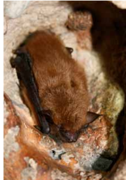
Big brown bat.

Comparing fatality rates among facilities with similar characteristics can be useful to determine patterns and broader landscape relationships. Developers should communicate with the Service to ensure that such comparisons are appropriate to avoid false conclusions. Fatality rates should be expressed on a per nameplate MW or some other standardized metric basis for comparison with other projects,