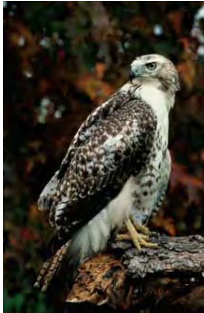
Red-tailed hawk.

An estimate of raptor use of the project site is obtained through appropriate surveys, but if potential impacts to breeding raptors are a concern on a project, raptor nest searches are also recommended. These surveys provide information to predict risk to the local breeding population of raptors, for micro-siting decisions, and for developing an appropriate-sized non-disturbance buffer around nests. Surveys also provide baseline data for estimating impacts and determining mitigation