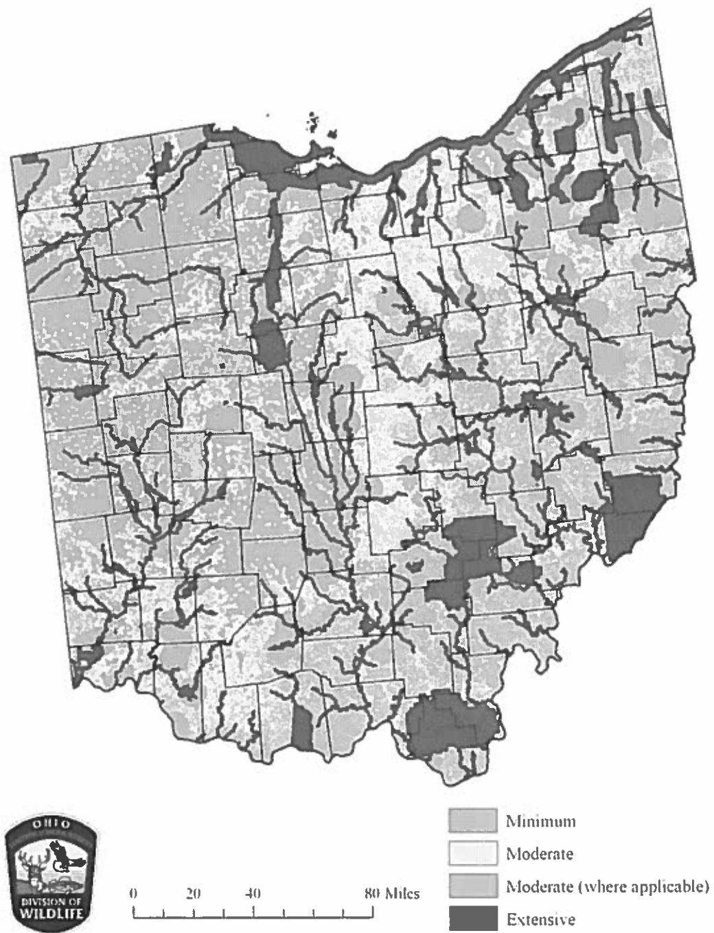
Figure 1. Survey effort.