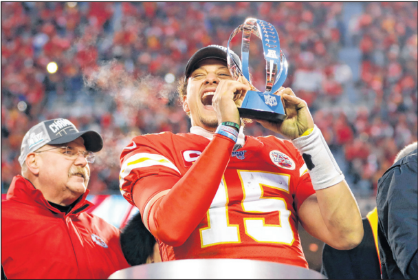
Kansas City Chiefs quarterback Patrick Mahomes holds the Lamar Hunt Trophy as he celebrates winning the AFC Championship game against the Tennessee Titans on Jan. 19 in Kansas City, Mo. The most compelling dramas in the NFL this season unfolded on the field, not off of it. And any thought that the league was in jeopardy of losing its spot as America's favorite sport has been set on the back burner.

It all helps explain the league's back-to-back 5%