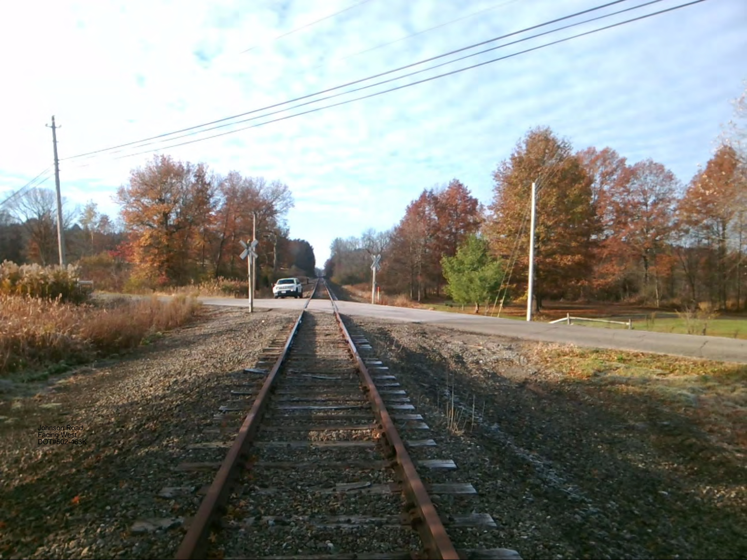
Johnson Road Facing West DOT#502-463K