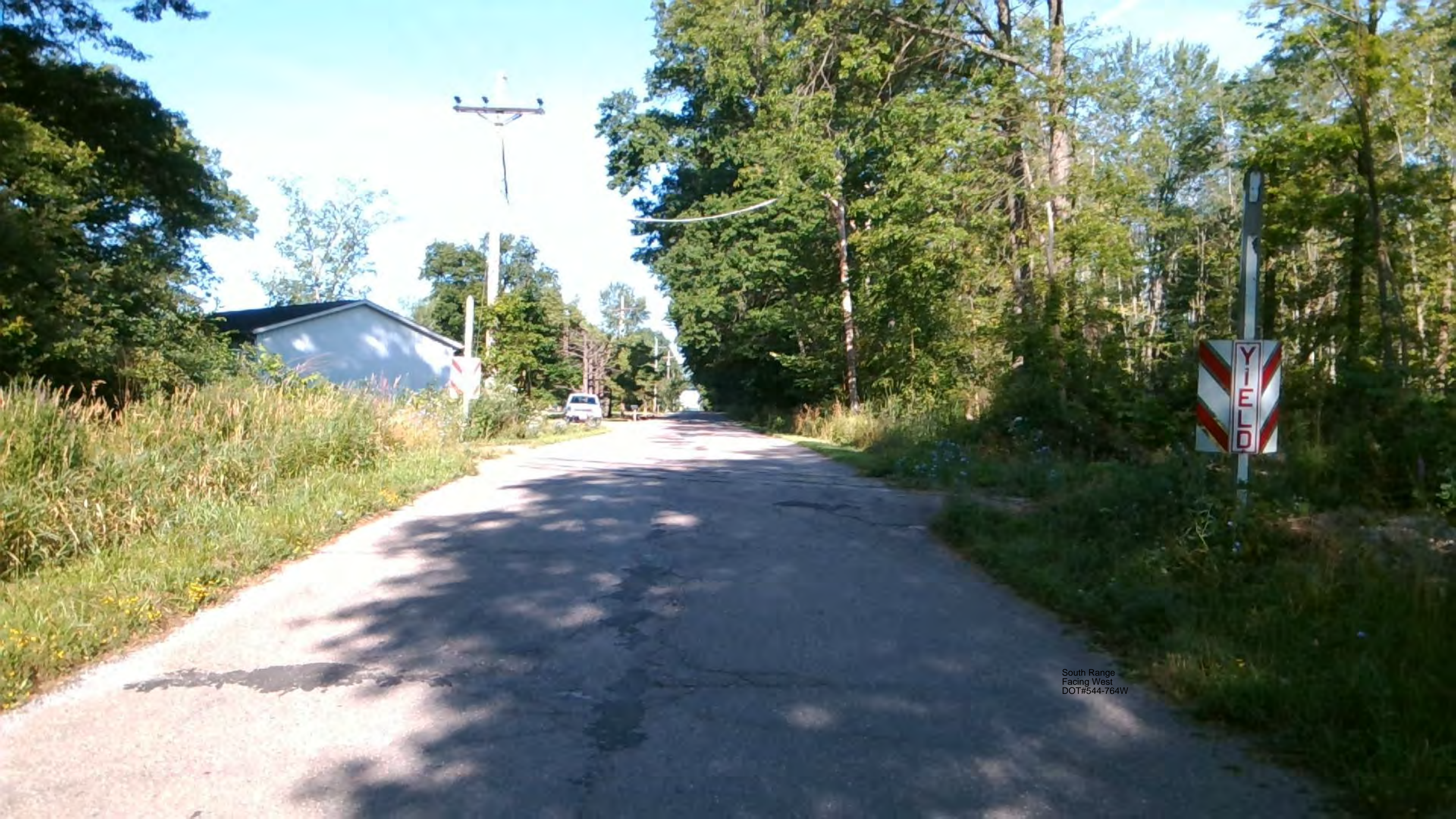
South Range Facing West DOT#544-764W