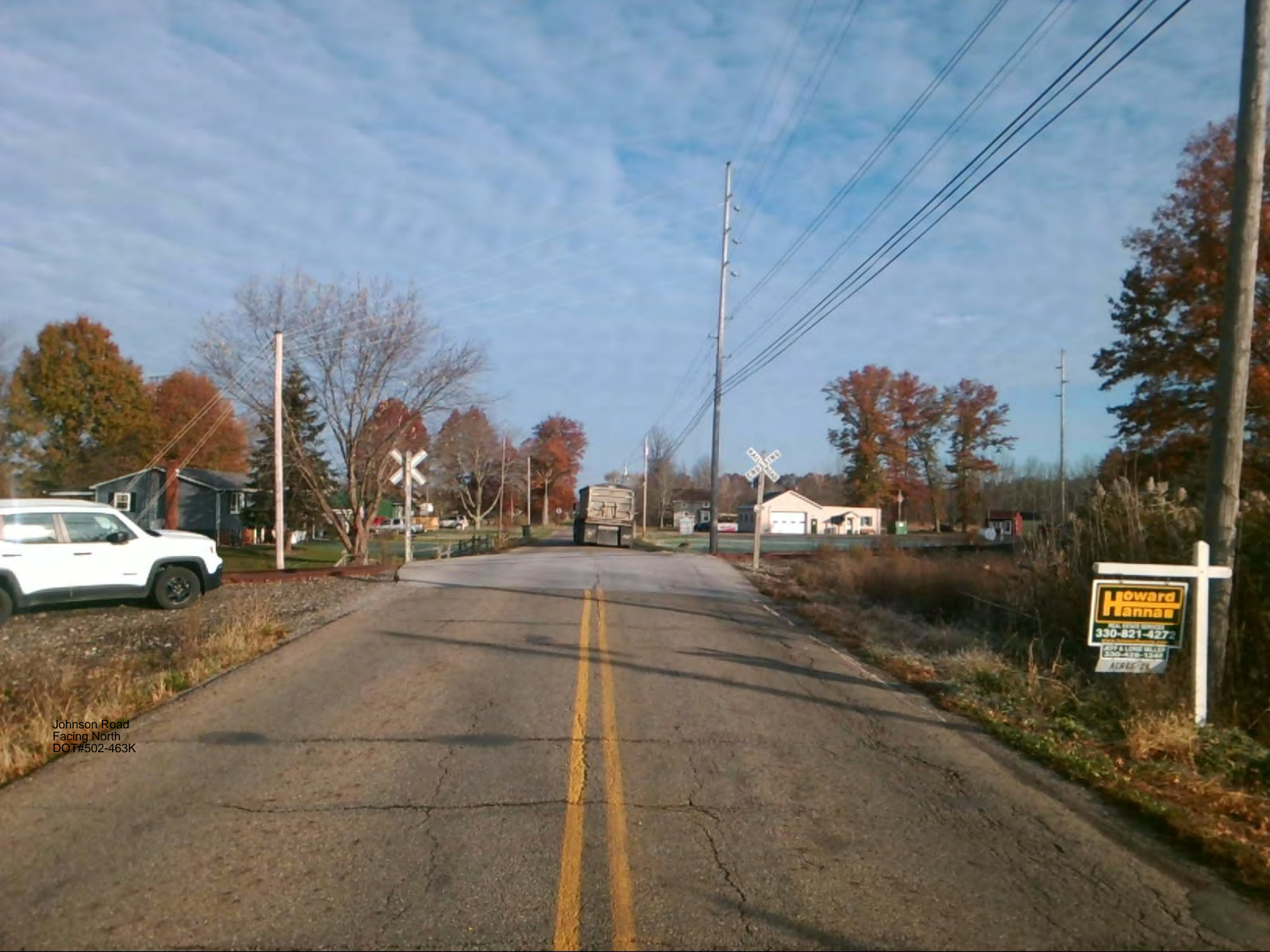
Johnson Road Facing North DOT#502-463K