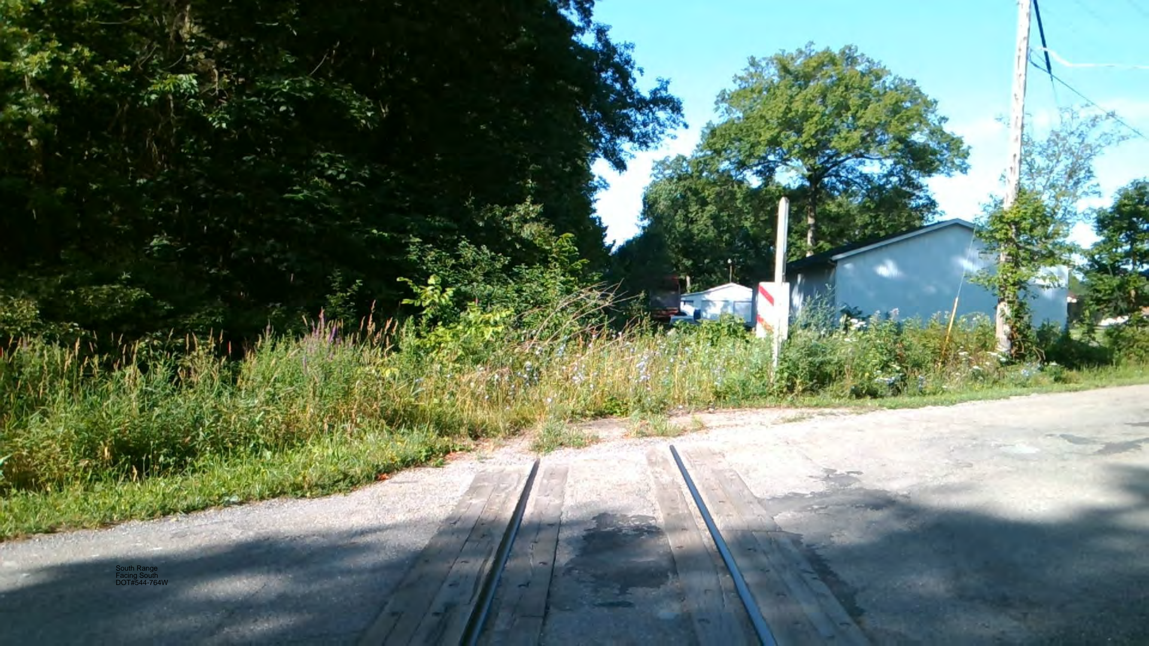
South Range Facing South DOT#544-764W