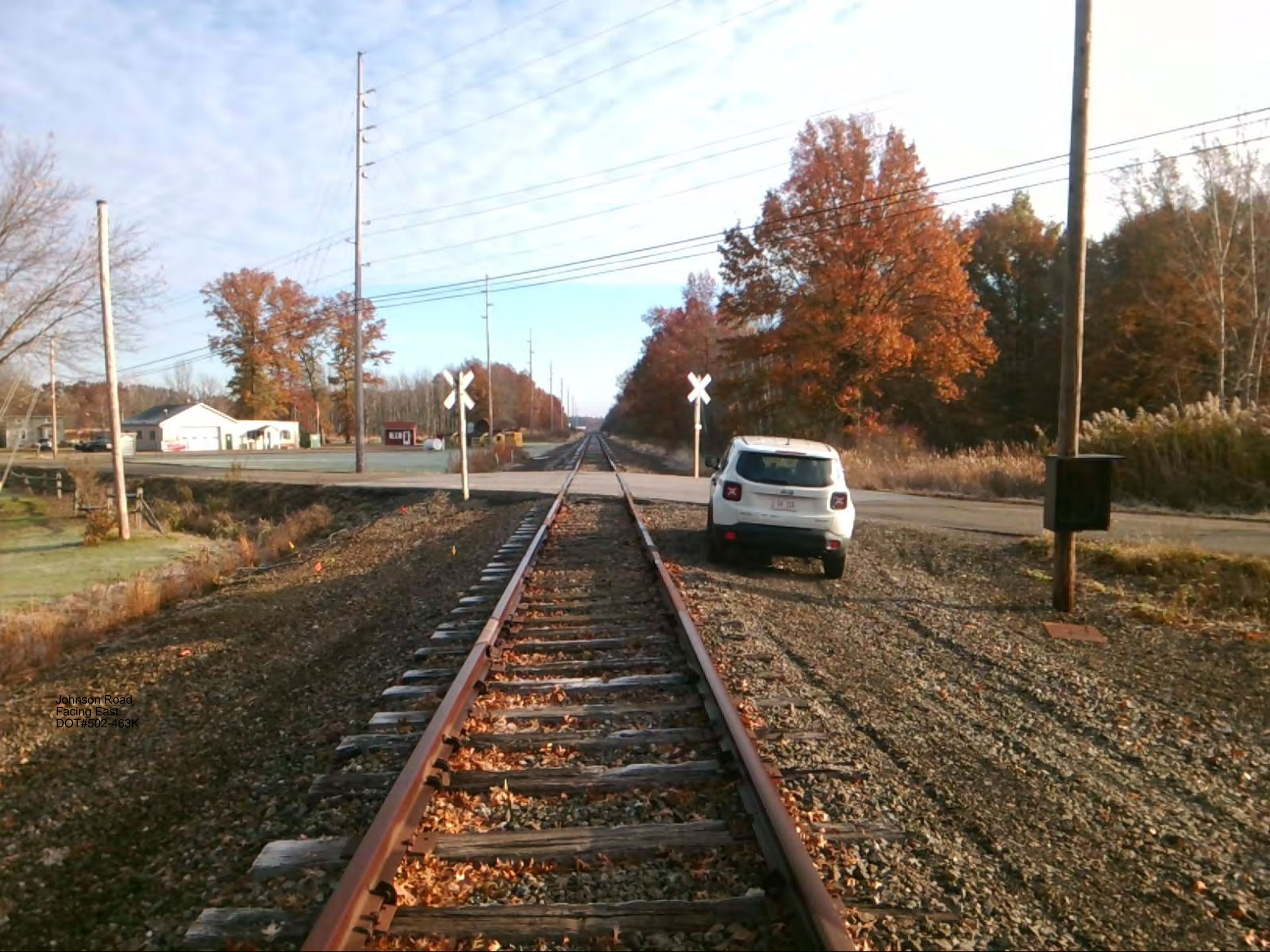
Johnson Road Facing East DOT#502-463K