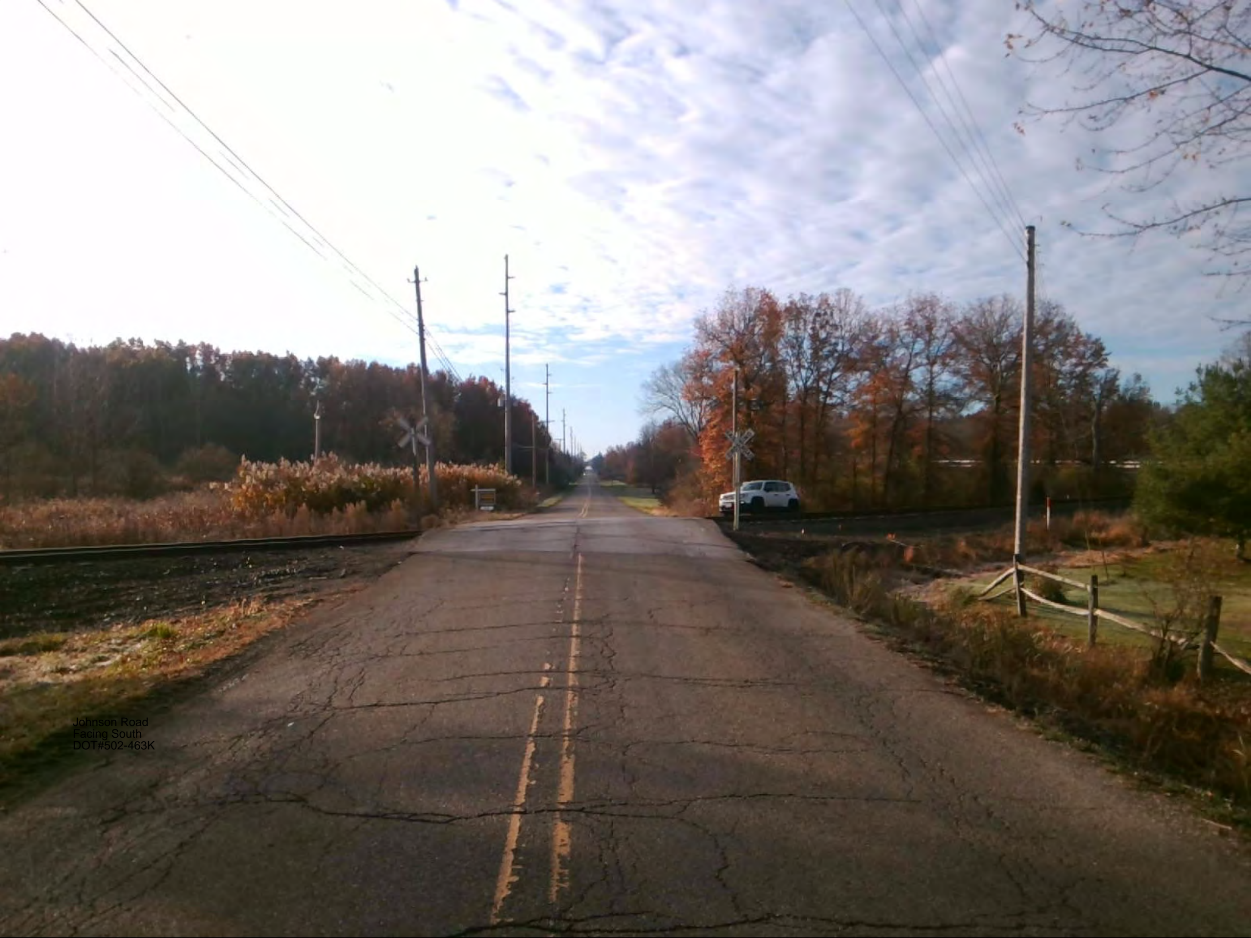
Johnson Road Facing South DOT#502-463K