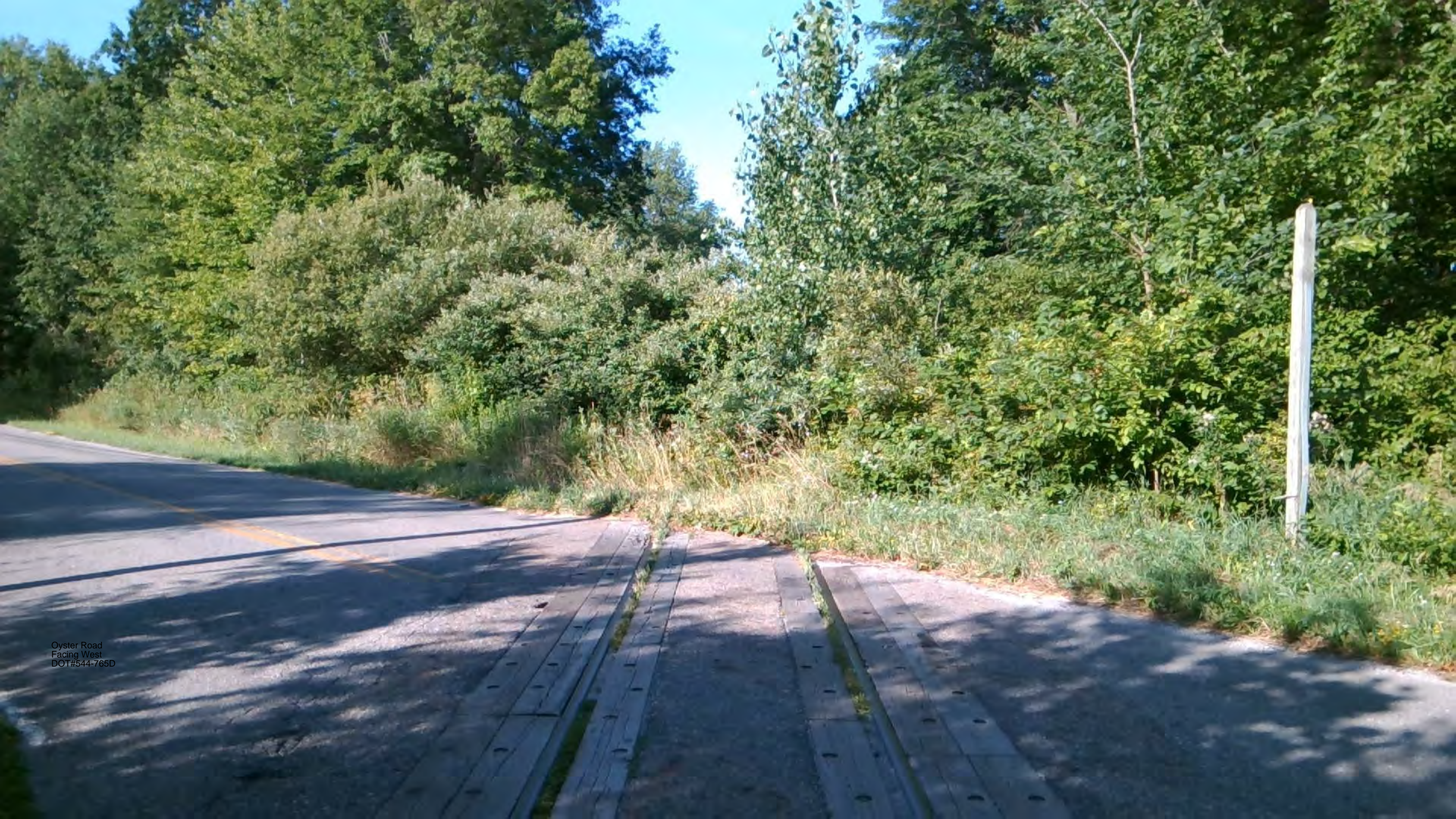
Oyster Road Facing West DOT#544-765D