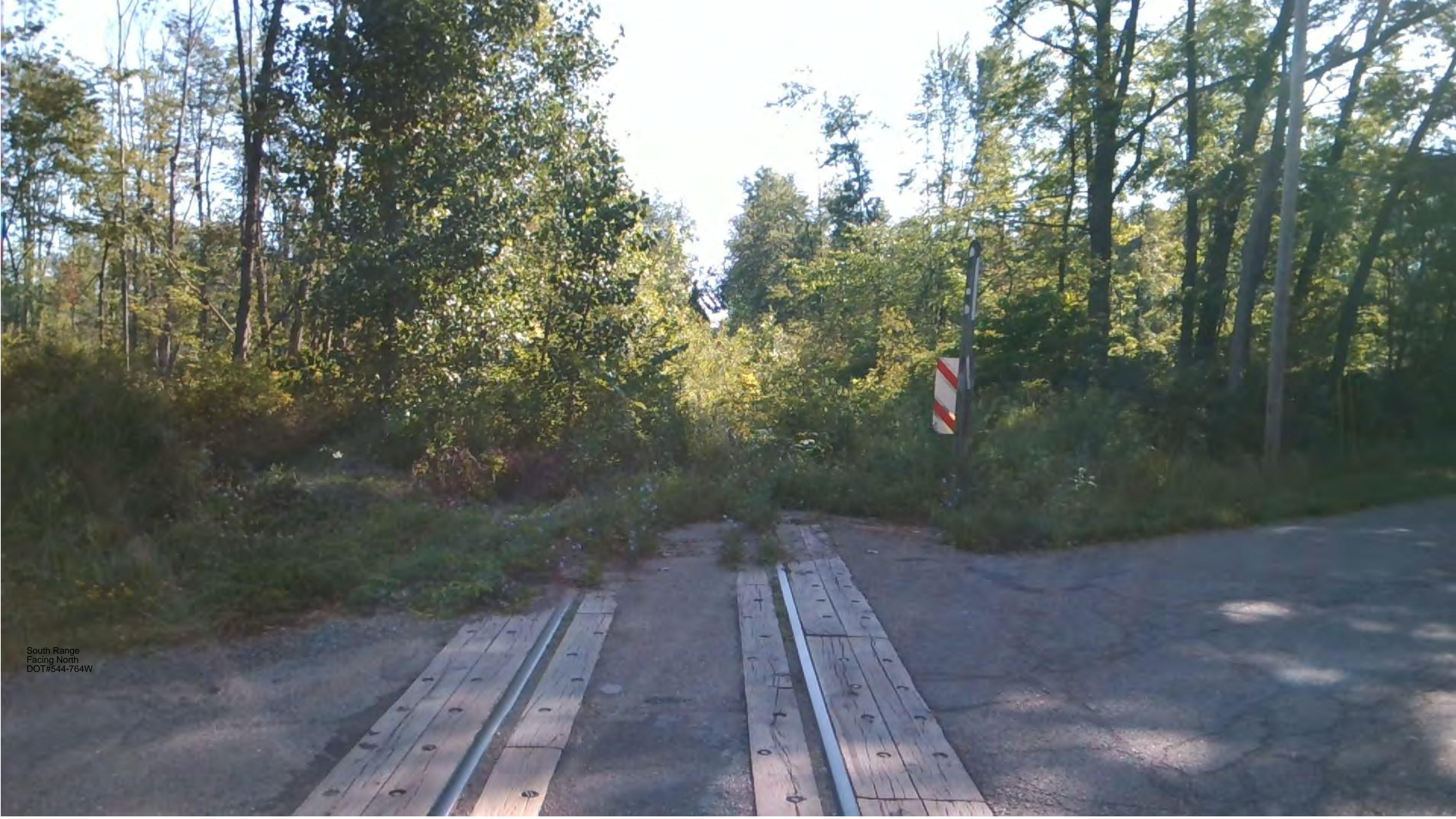
South Range Facing North DOT#544-764W