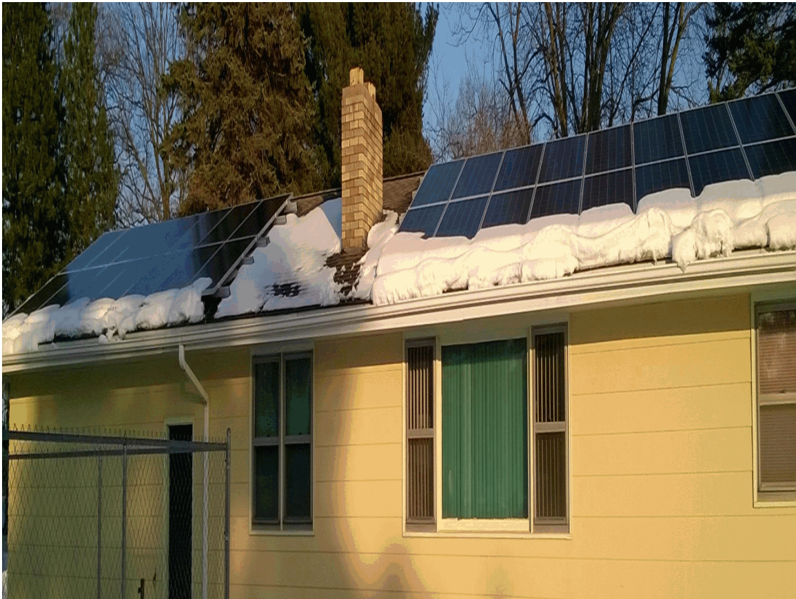
December 05, 2019