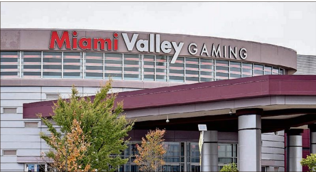
Miami Valley Gaming in Warren County’s Turtlecreek Twp. is proposing a $100 million expansion project, one that could be completed by early 2021. If approved, it would add a 194-room, 11-story hotel, a restaurant and a four-floor parking garage.