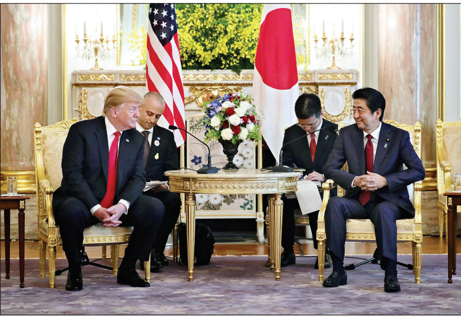
President Donald Trump and Prime Minister Shinzo Abe talk before their summit meeting at the State Guest House in Tokyo on Monday.

Monday as media coverage grew. "My tweet yesterday about Trump preferring Kim Jong Un to Biden as President was meant in jest," he wrote. "I should have been clearer. My apologies." The ease with which misinformation spreads on social media remains a pressing problem. Last week, Facebook, Twitter, YouTube and other social media companies allowed a video that was doctored to make House Speaker Nancy Pelosi, D-Calif., appear drunk to be uploaded and viewed millions of times. Trump, who has made more than 10,000 false or misleading claims while in office according to The Washington Post's Fact Checker, has long said that he would like to change U.S. libel laws, which shield defendants from guilt unless they are proved to have made false and defamatory statements against public officials with malicious intent.