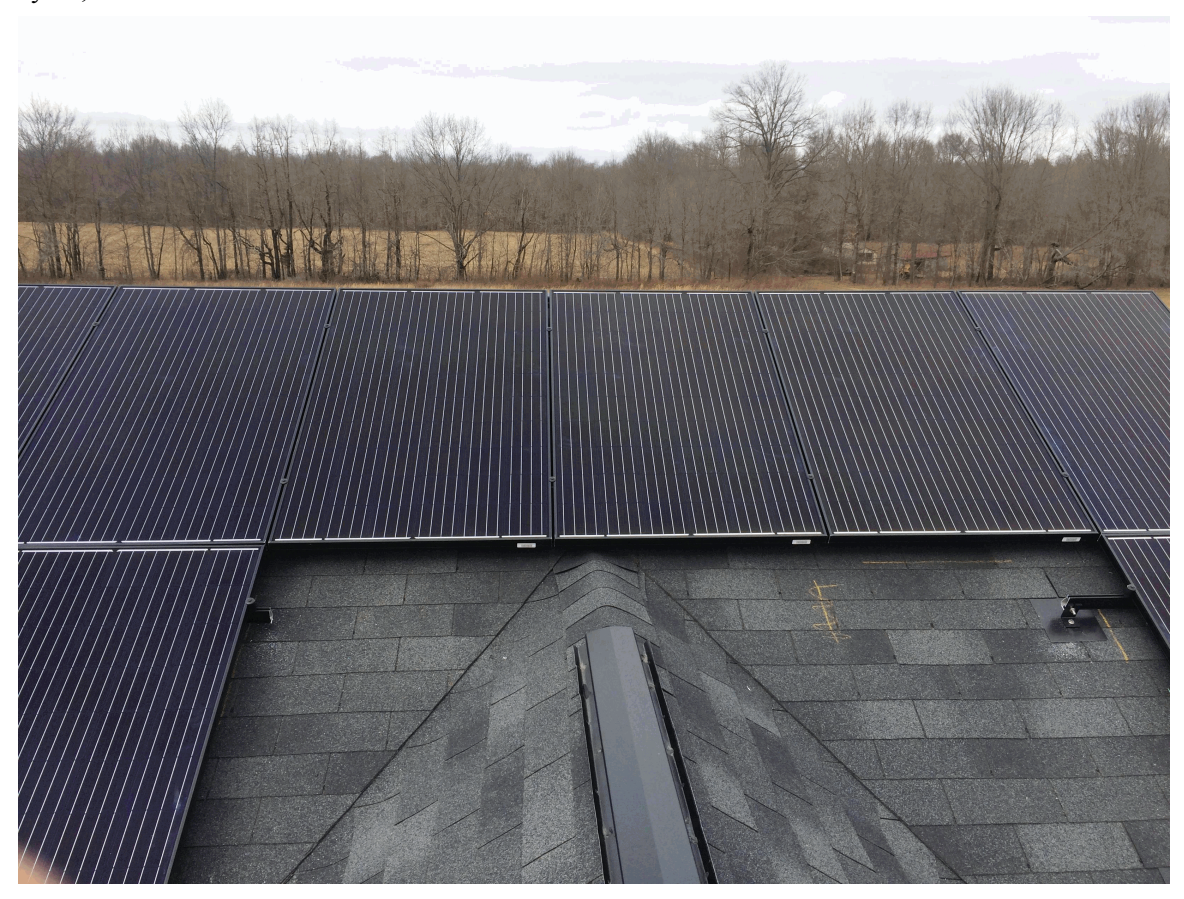
The Applicant is applying for certification in Ohio for a facility using one of the following qualified resources or technologies (Sec. 4928.01 ORC):