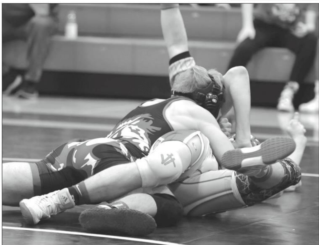
Allen East sediting eight wrestlers to Division III district tournament