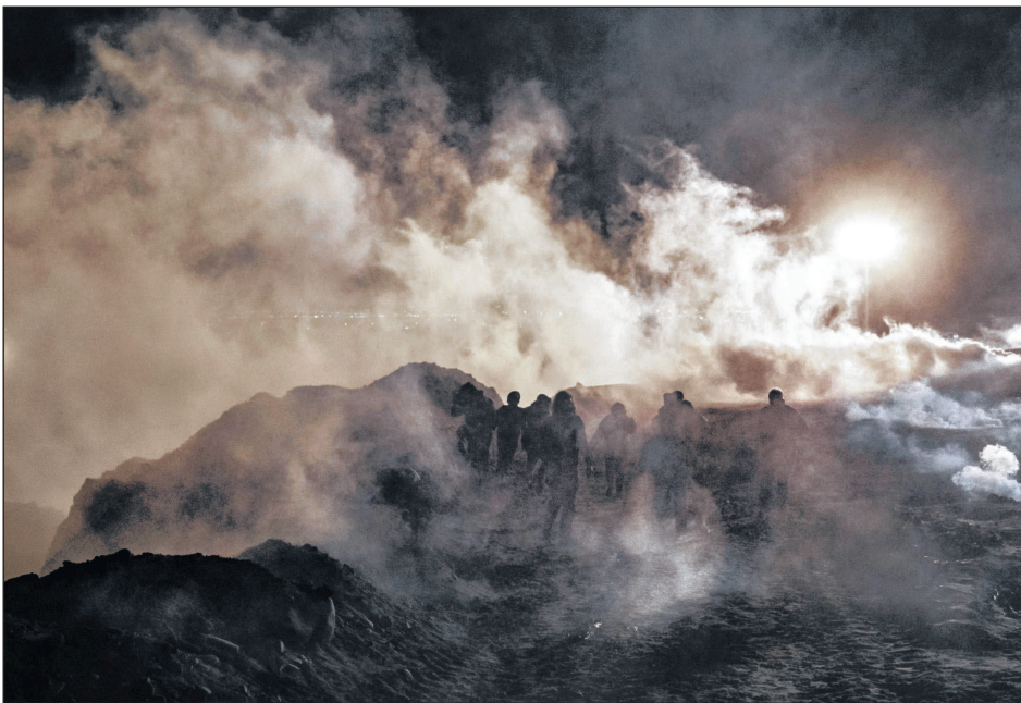
Migrants run after U.S. Border Patrol agents throw tear gas to the Mexican side of the fence after the migrants climbed the border fence to get into the U.S. side to San Diego from Tijuana, Mexico, on Tuesday. The confrontation was at least the second time in a little over a month that U.S. authorities have fired tear gas into Tijuana.

Several migrants tried to climb the metal wall, prompting agents to fire the first volley of tear gas. When migrants approached the wall again, authorities fired a second round and then a