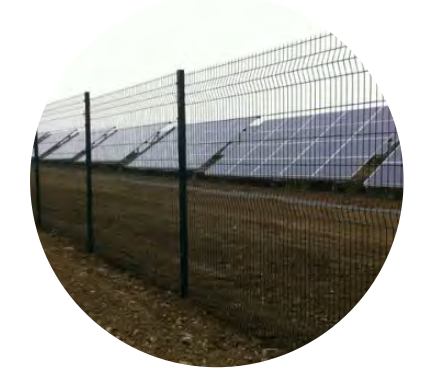
Black Vinyl Agricultural Mesh