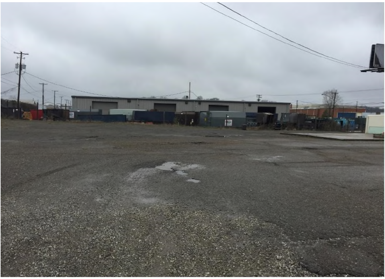
Pipeyard at southwest corner of Perry Drive and Southway Street (facing west)