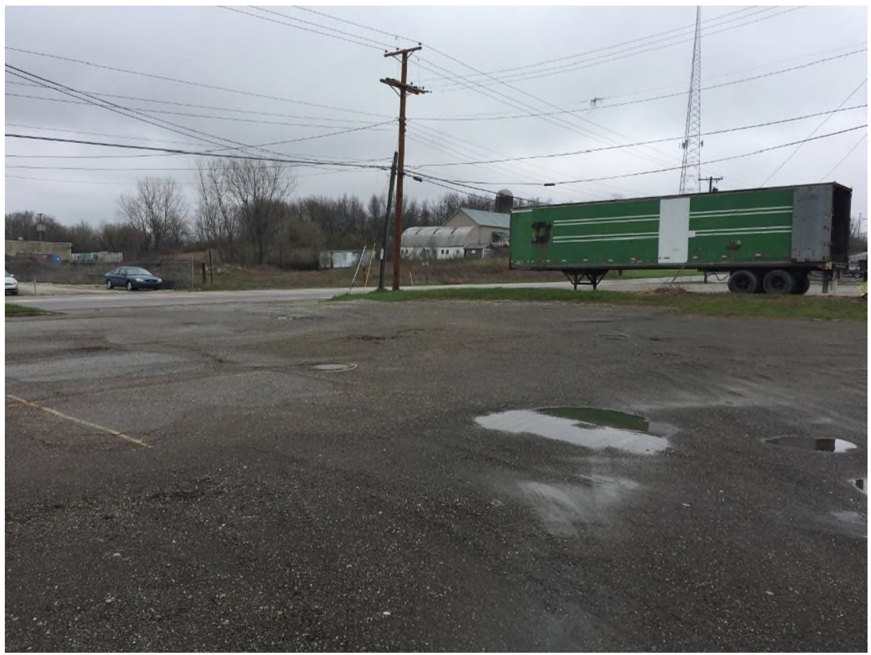
Pipeyard at the southwest corner of Perry Drive and Southway Street (facing southeast)