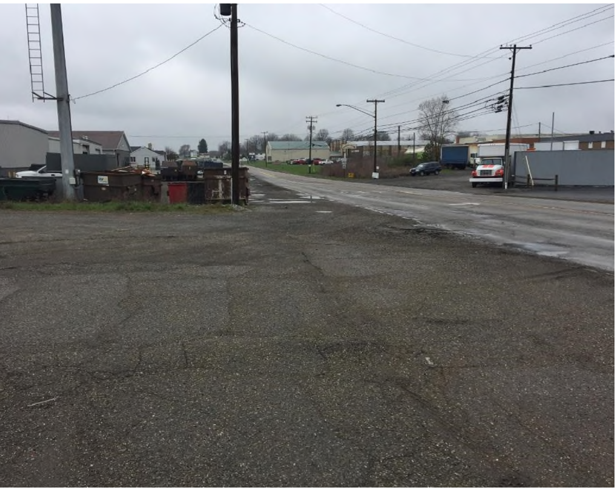
Pipeyard at southwest corner of Perry Drive (facing west)