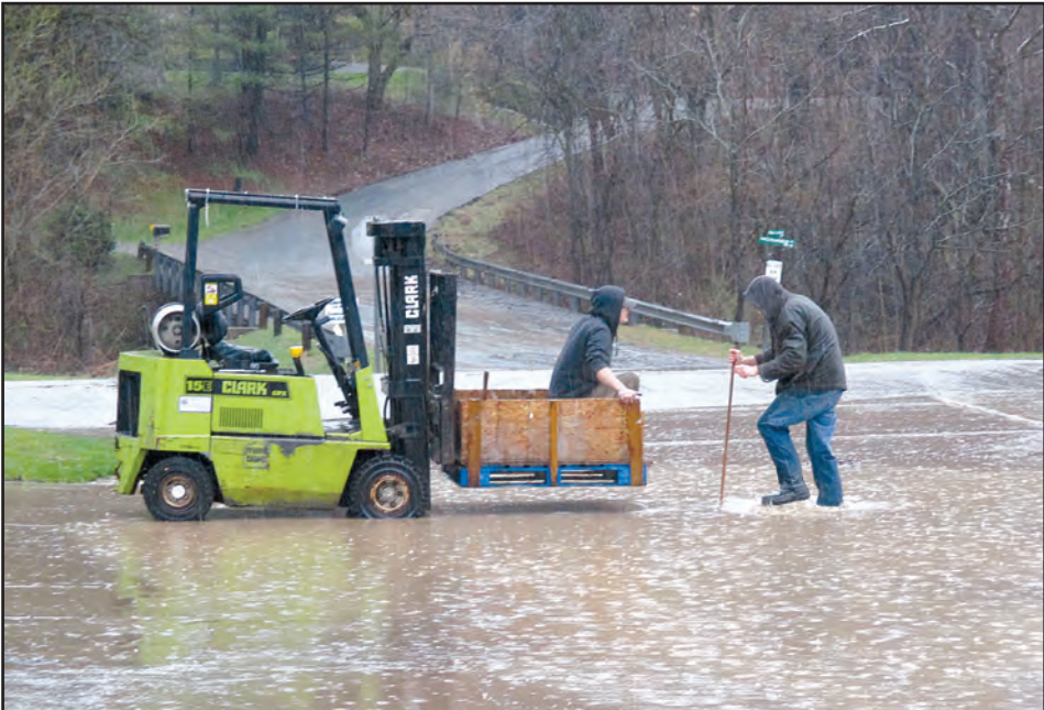
Workers unclog a drain, where flooding temporarily blocked off access from Woodsfield Road to the Food Center Emporium and Marathon gas station Wednesday morning.

It was reported that many residents were dealing with water in basements. Make Your Home Safer; Turn In Unneeded Prescription Drugs It takes less than five minutes to make your home, and Noble County streets, safer. Removing unneeded prescription or over-the-counter drugs from your medicine cabinet to a safe disposal location is one of the steps that concerned citizens can take to reduce the risks of abuse. According to DrugFreeWorld.org, “Almost 50 percent of teens believe that prescription drugs are much safer than illegal street drugs, with 60 percent to 70 percent saying that home medicine cabinets are their source of drugs.” At the recent Be Aware program held at Shenandoah High School, attendees learned that addicts will try to gain entry into homes under false pretenses and search medicine cabinets for prescription drugs. This was corroborated by Noble County Sheriff Robert Pickenpaugh as having occurred in our area. And throwing the unused or expired drugs in the trash may not be enough to keep them out of the wrong hands, as the trash is another place where abusers will often look. The Noble County Sheriff’s Office will accept your unused or expired prescription drugs for proper disposal, and the procedure is very simple. Just walk into the sheriff’s office, go up to the window and tell the deputy you want to turn in prescriptions. Pass them through the window, and you are done. (Continues on page 12)