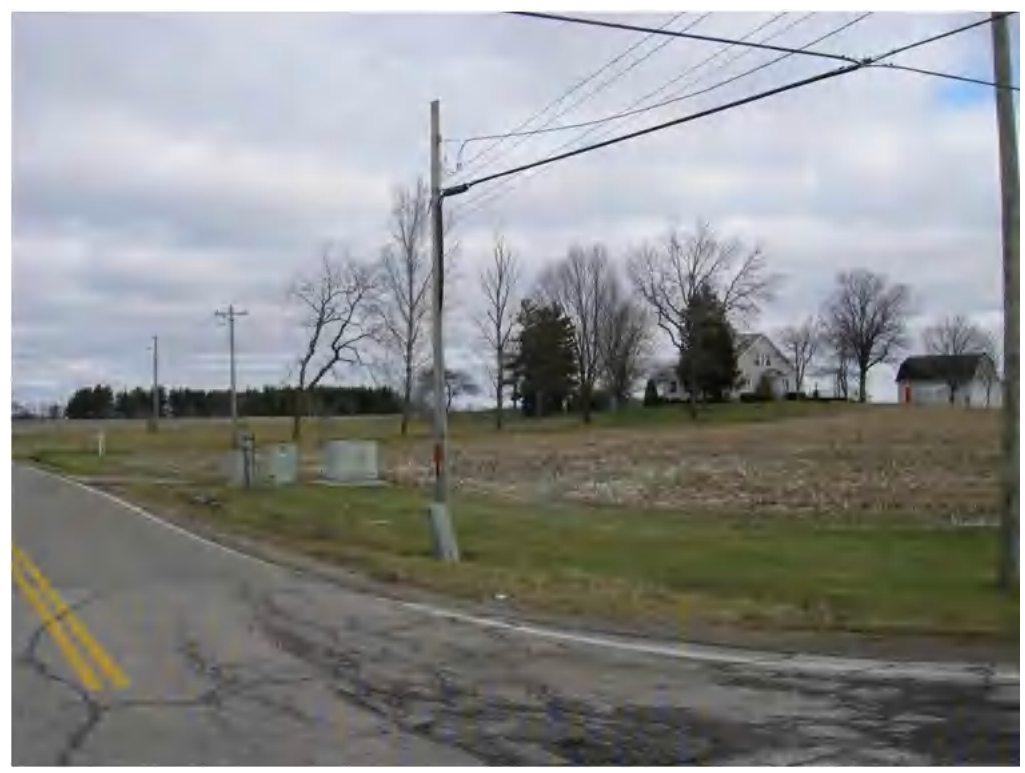
Photo 26 – Supplement to Figure 13: Intersection S.R.36 & N. Parkview Rd. (Facing Northeast)