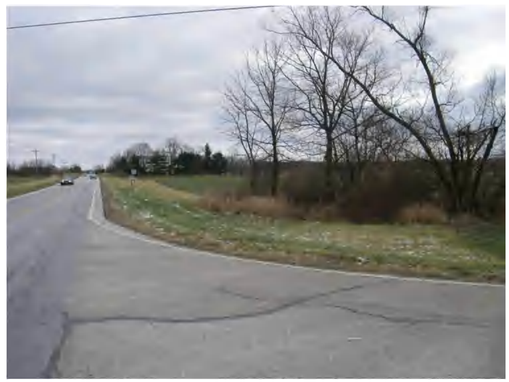
Photo 34 – Supplement to Figure 16: Intersection S.R.36 & S. Mutual Union Rd (Facing Northeast)