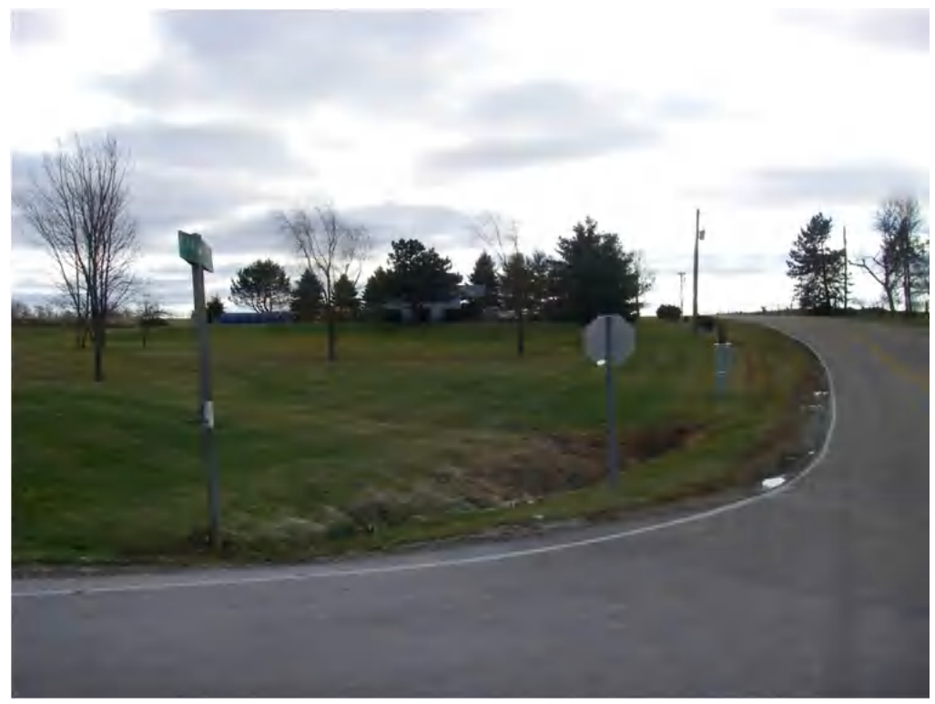
Photo 22 – Supplement to Figure 11: Intersection S.R.161 & S. Parkview (Facing South)