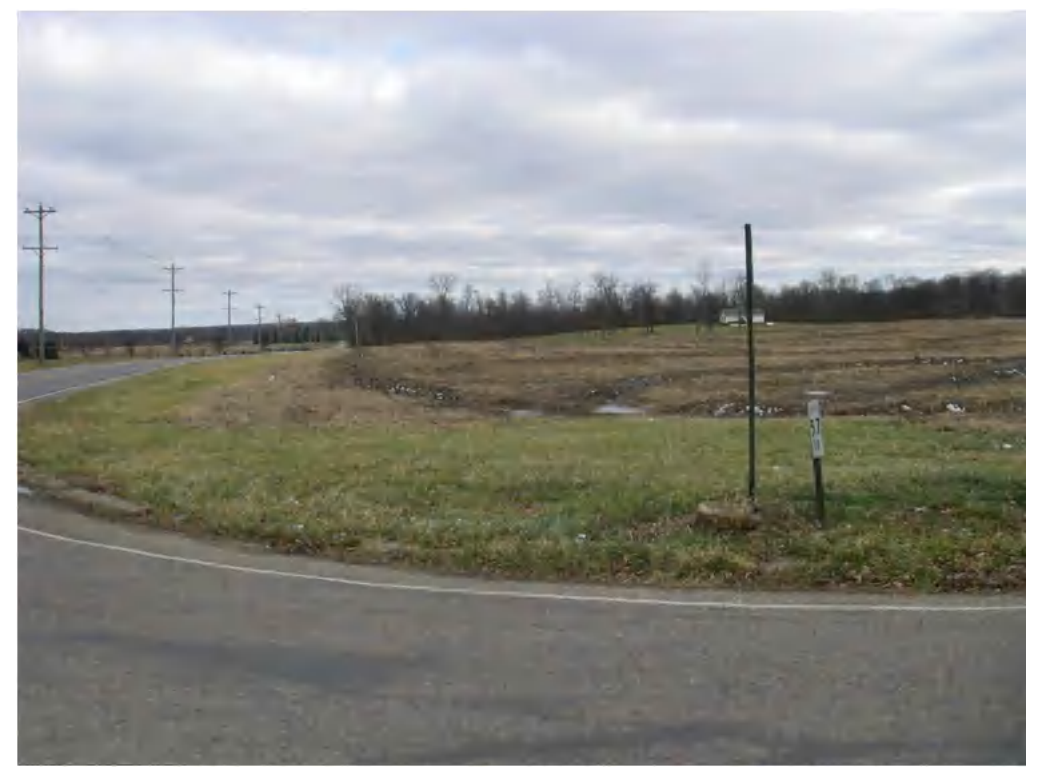
Photo 28 - Supplement to Figure 14: Intersection N. Parkview Rd. & Urbana Woodstock Pk (Facing Northeast)