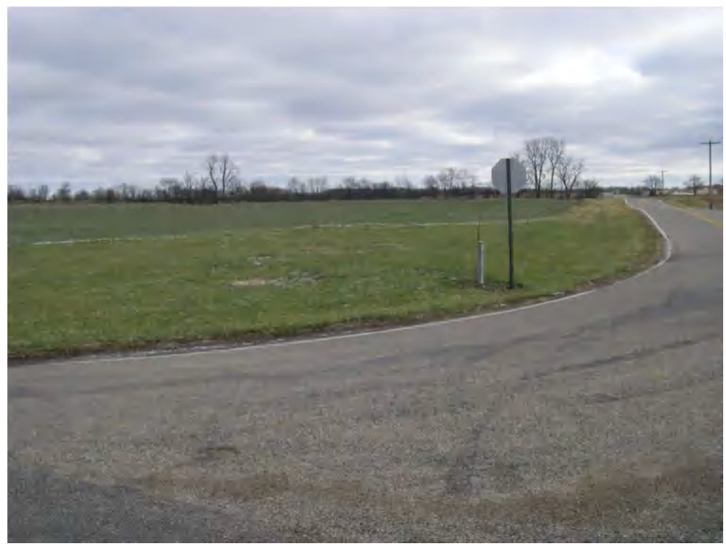
Photo 37 - Supplement to Figure 17: Intersection S. Mutual Union Rd & Stringtown Rd (Facing East)