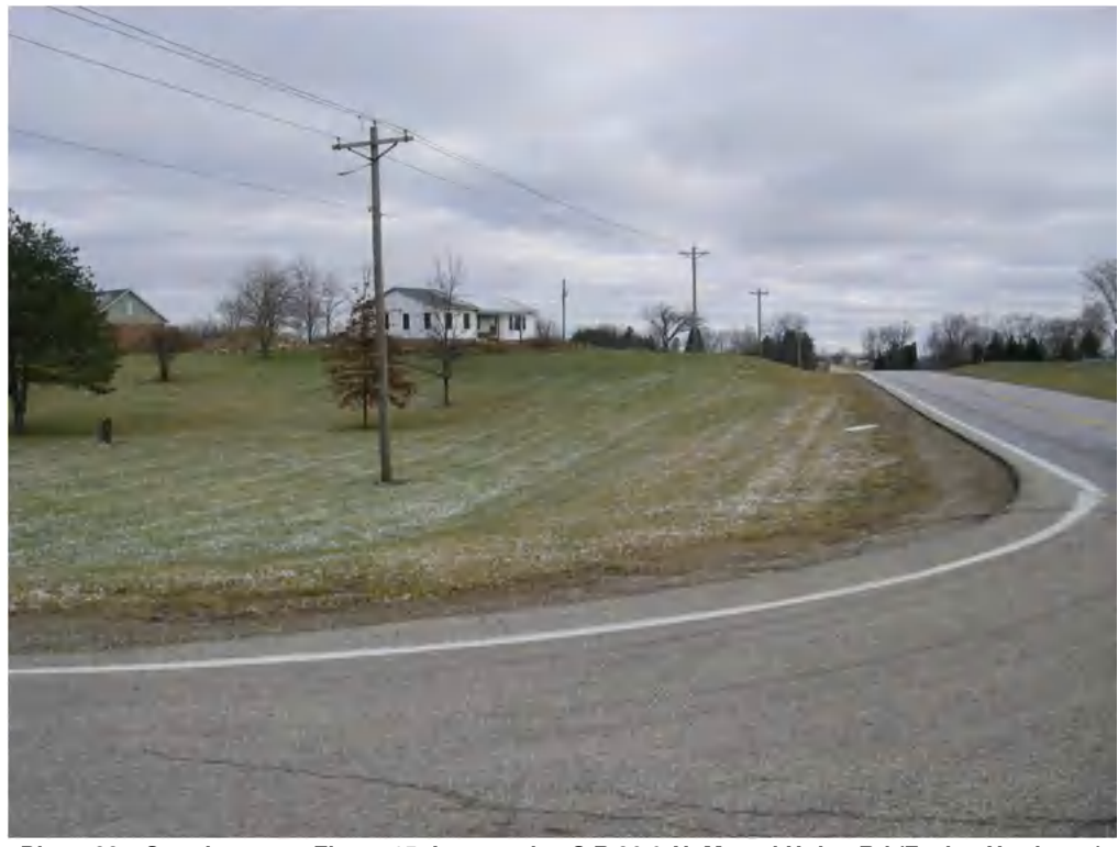
Photo 33 – Supplement to Figure 15: Intersection S.R.36 & N. Mutual Union Rd (Facing Northeast)