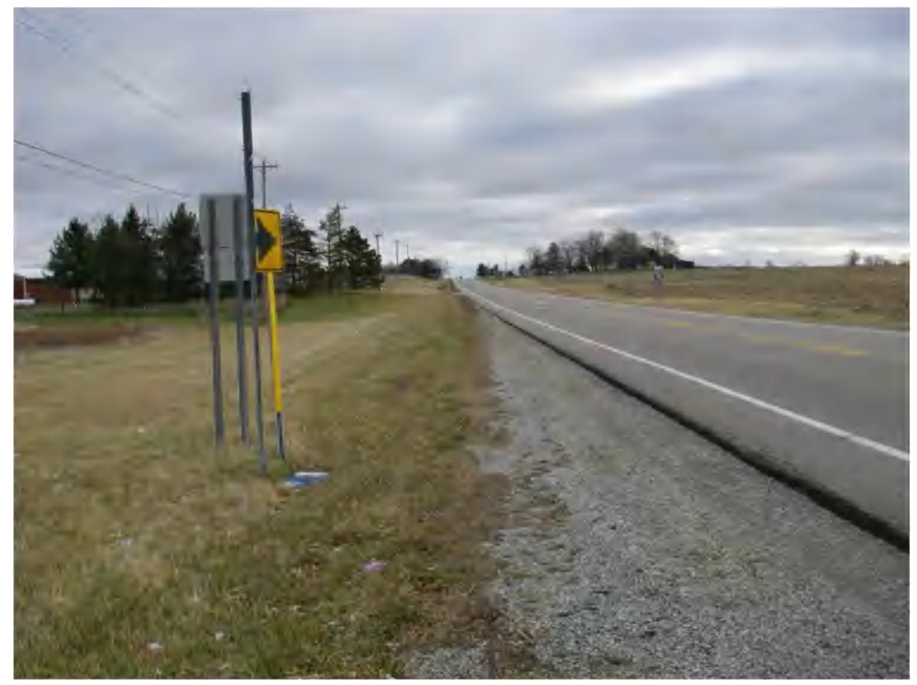
Photo 21 – Supplement to Figure 10: Intersection S.R.56 & S.R.29 (Facing East)