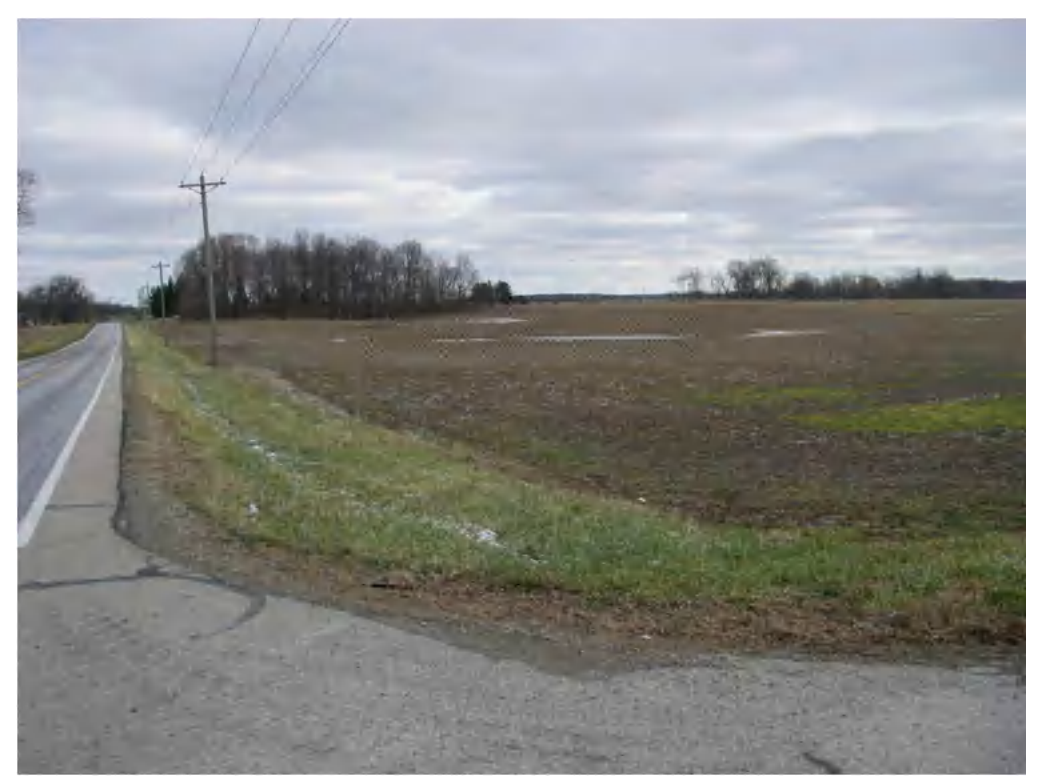
Photo 24 – Supplement to Figure 12: Intersection S.R.36 & Bullard Rutan Rd. (Facing Northeast)