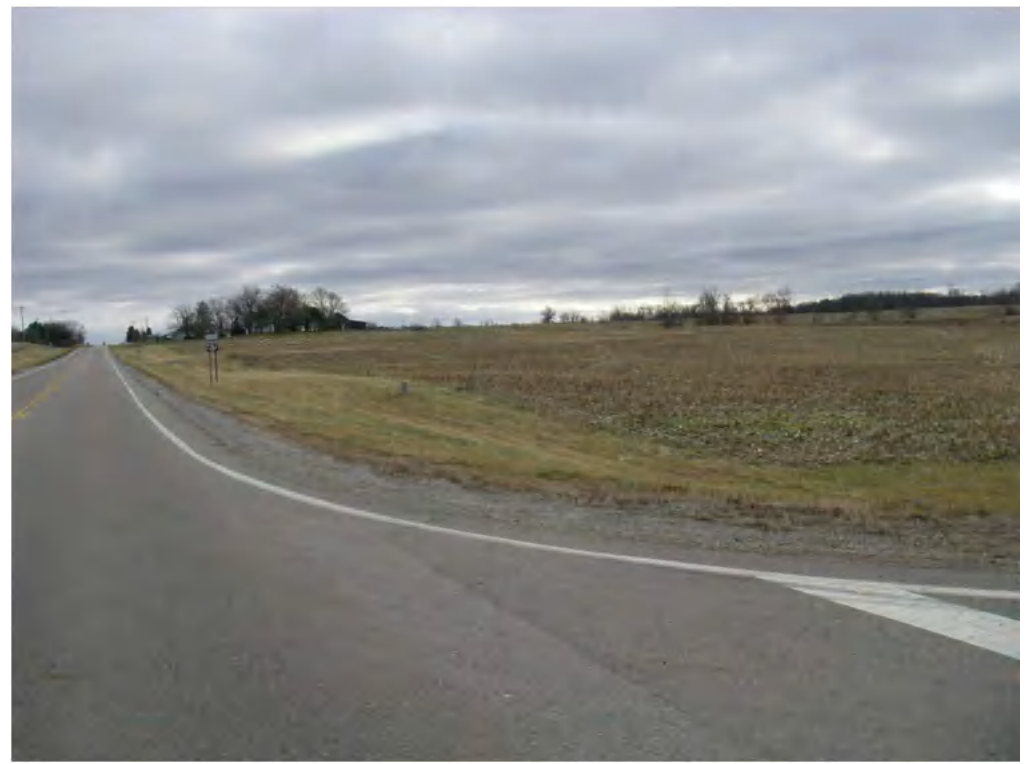
Photo 19 – Supplement to Figure 10: Intersection S.R.56 & S.R.29 (Facing East)