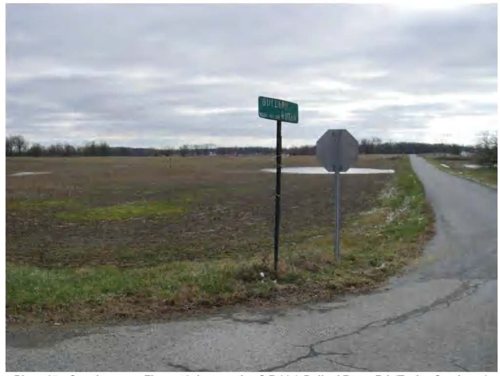
Photo 25 – Supplement to Figure 12: Intersection S.R.36 & Bullard Rutan Rd. (Facing Southeast)