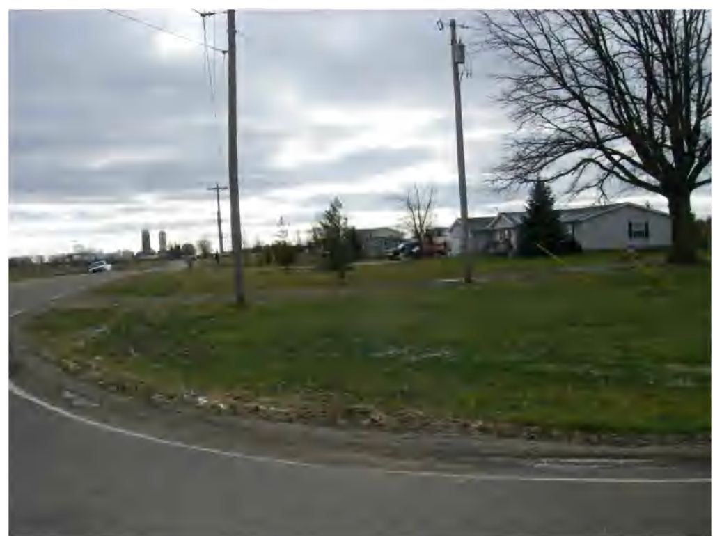
Photo 31 - Supplement to Figure 14: Intersection N. Parkview Rd. & Urbana Woodstock Pk (Facing South)