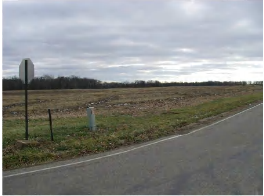
Photo 29 - Supplement to Figure 14: Intersection N. Parkview Rd. & Urbana Woodstock Pk (Facing Southeast)