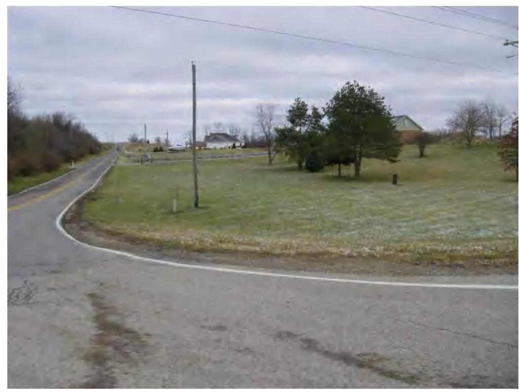
Photo 32 – Supplement to Figure 15: Intersection S.R.36 & N. Mutual Union Rd (Facing North)