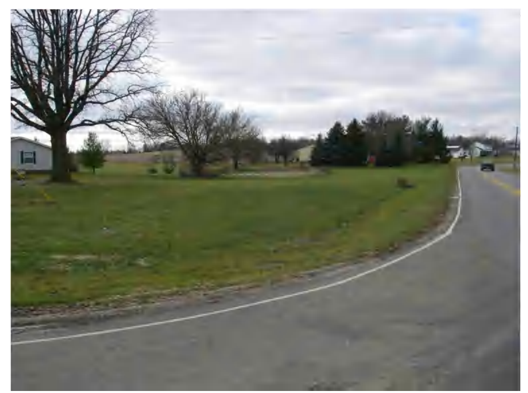
Photo 30 - Supplement to Figure 14: Intersection N. Parkview Rd. & Urbana Woodstock Pk (Facing Southwest)