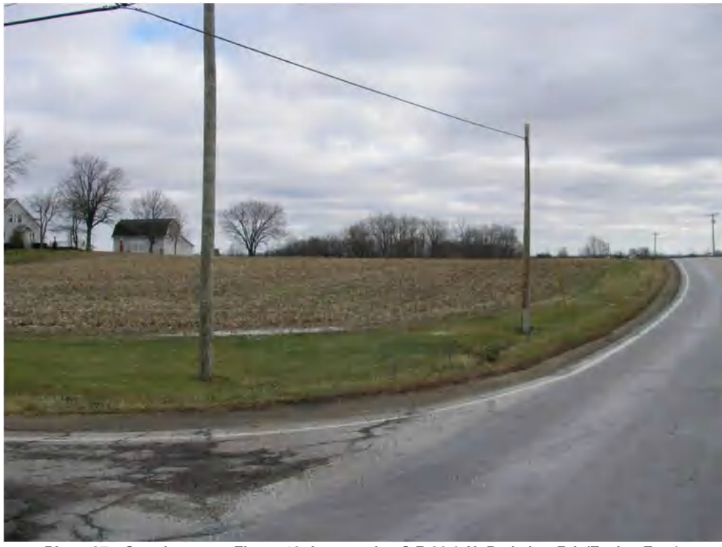
Photo 27 – Supplement to Figure 13: Intersection S.R.36 & N. Parkview Rd. (Facing East)