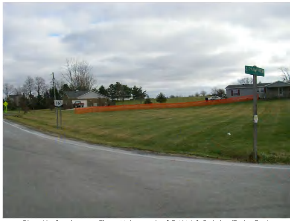
Photo 23 – Supplement to Figure 11: Intersection S.R.161 & S. Parkview (Facing East)