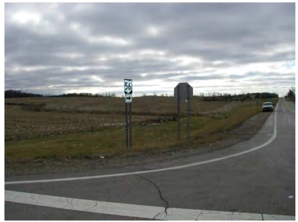
Photo 20 – Supplement to Figure 10: Intersection S.R.56 & S.R.29 (Facing Southeast)