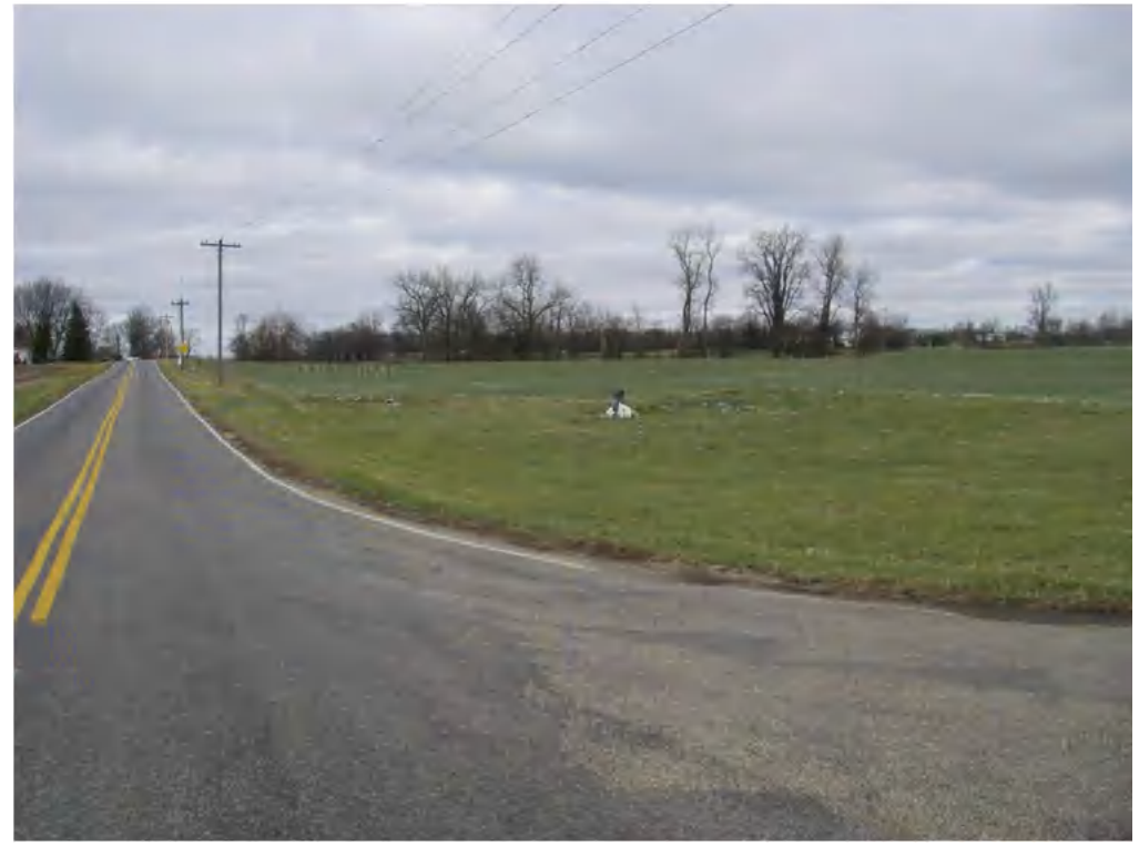
Photo 36 – Supplement to Figure 17: Intersection S. Mutual Union Rd & Stringtown Rd (Facing North)