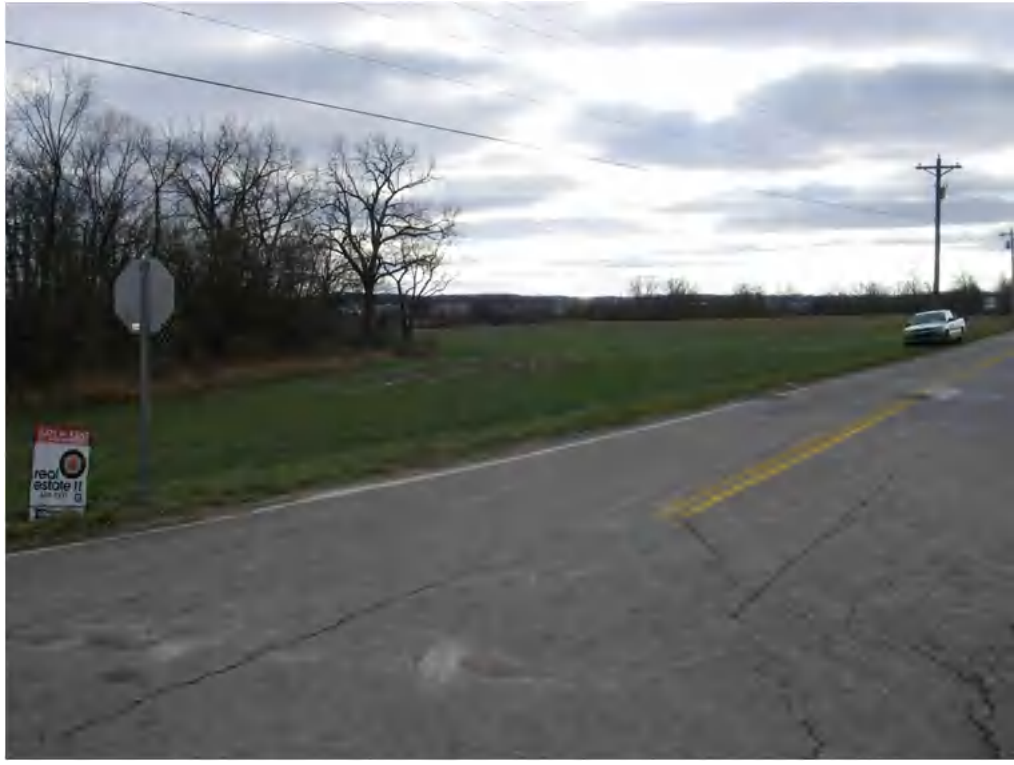
Photo 35 – Supplement to Figure 16: Intersection S.R.36 & S. Mutual Union Rd (Facing Southeast)