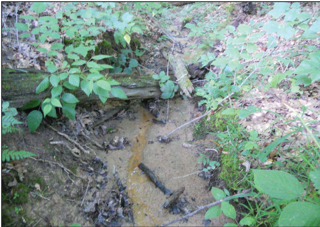
Photograph 52. Stream S015, Downstream, Facing South