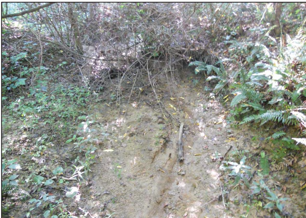
Photograph 49. Stream S014, Upstream, Facing South