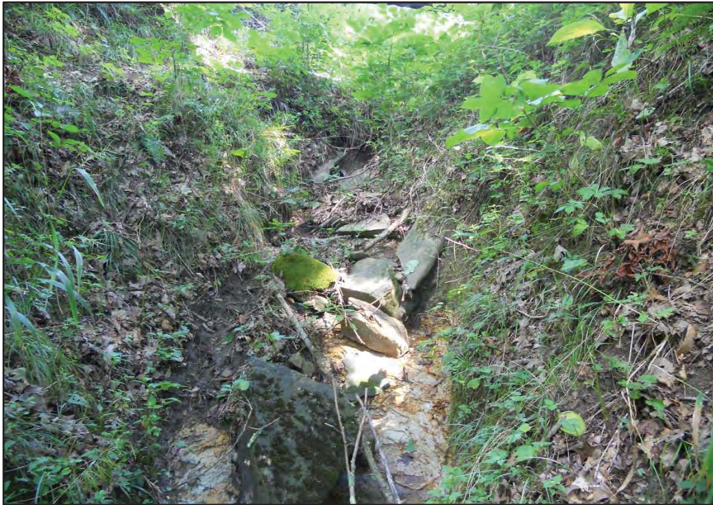
Photograph 33. Stream S006, Upstream, Facing North