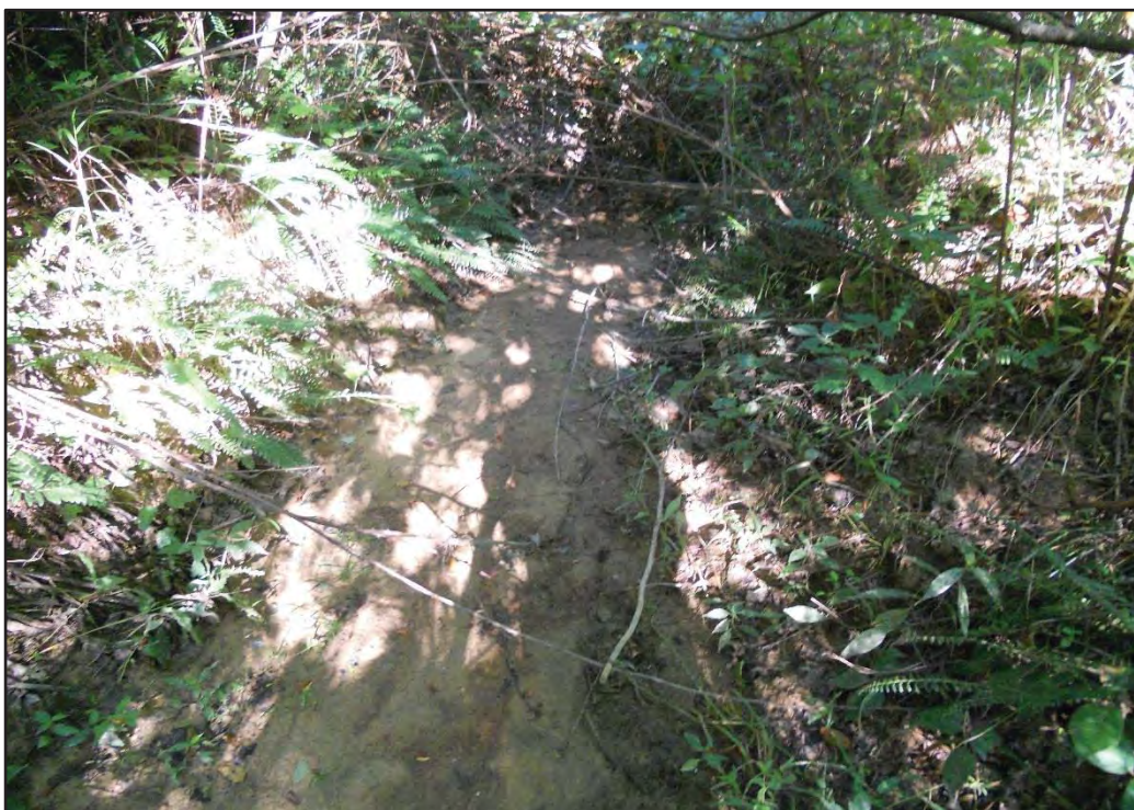
Photograph 50. Stream S014, Downstream, Facing North