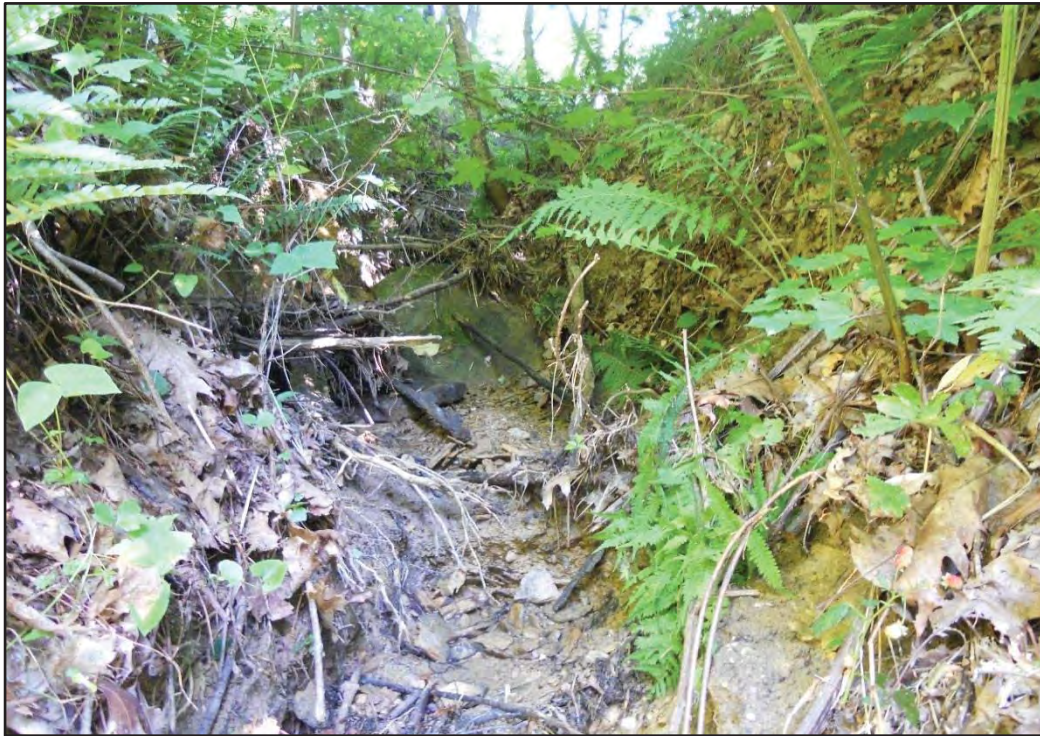
Photograph 31. Stream S005, Upstream, Facing North