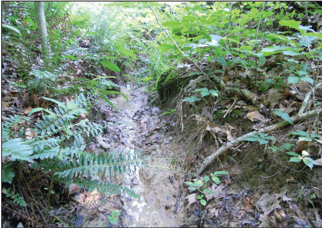
Photograph 51. Stream S015, Upstream, Facing North