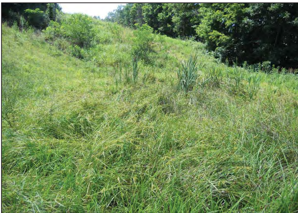
Photograph 16. Wetland W008-PEM-CAT1, Facing West