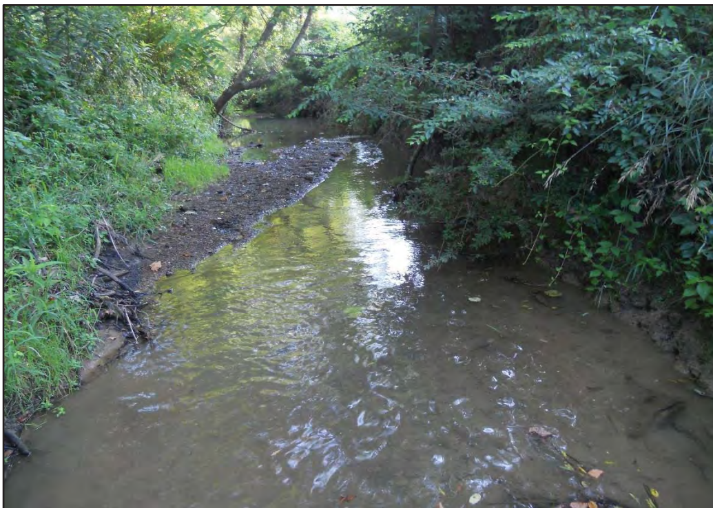
Photograph 25. Stream S002 (Horse Creek), Upstream, Facing North