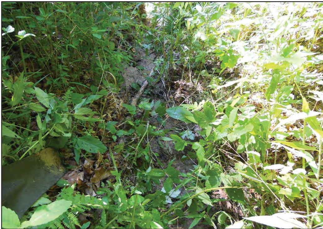
Photograph 32. Stream S005, Downstream, Facing South