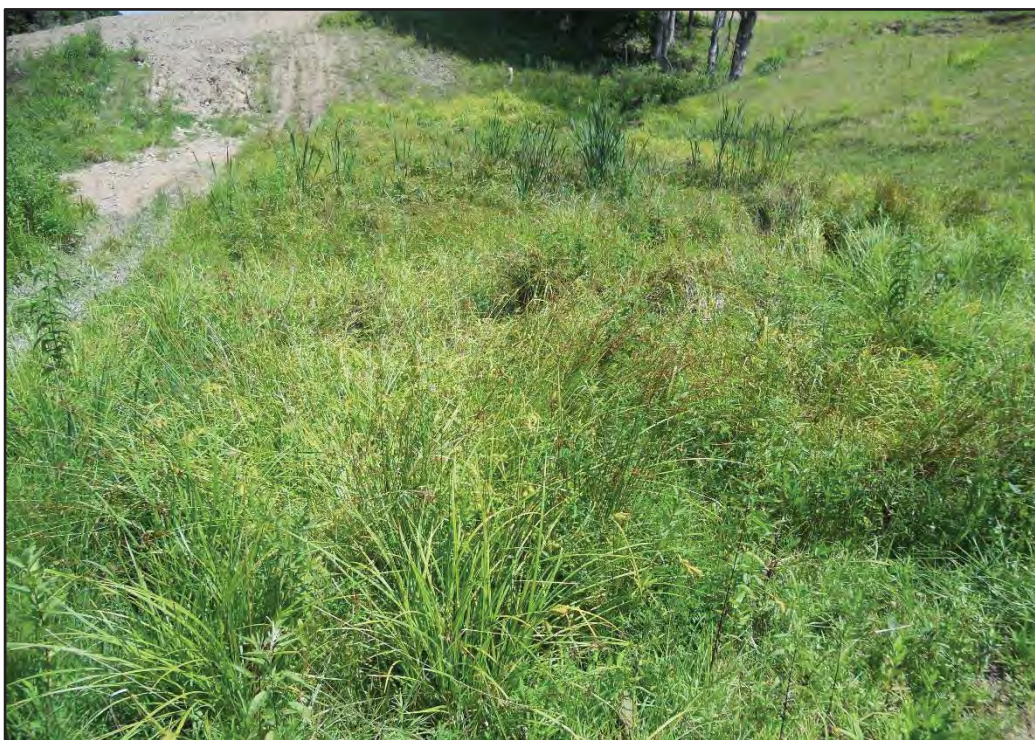
Photograph 15. Wetland W008-PEM-CAT1, Facing East