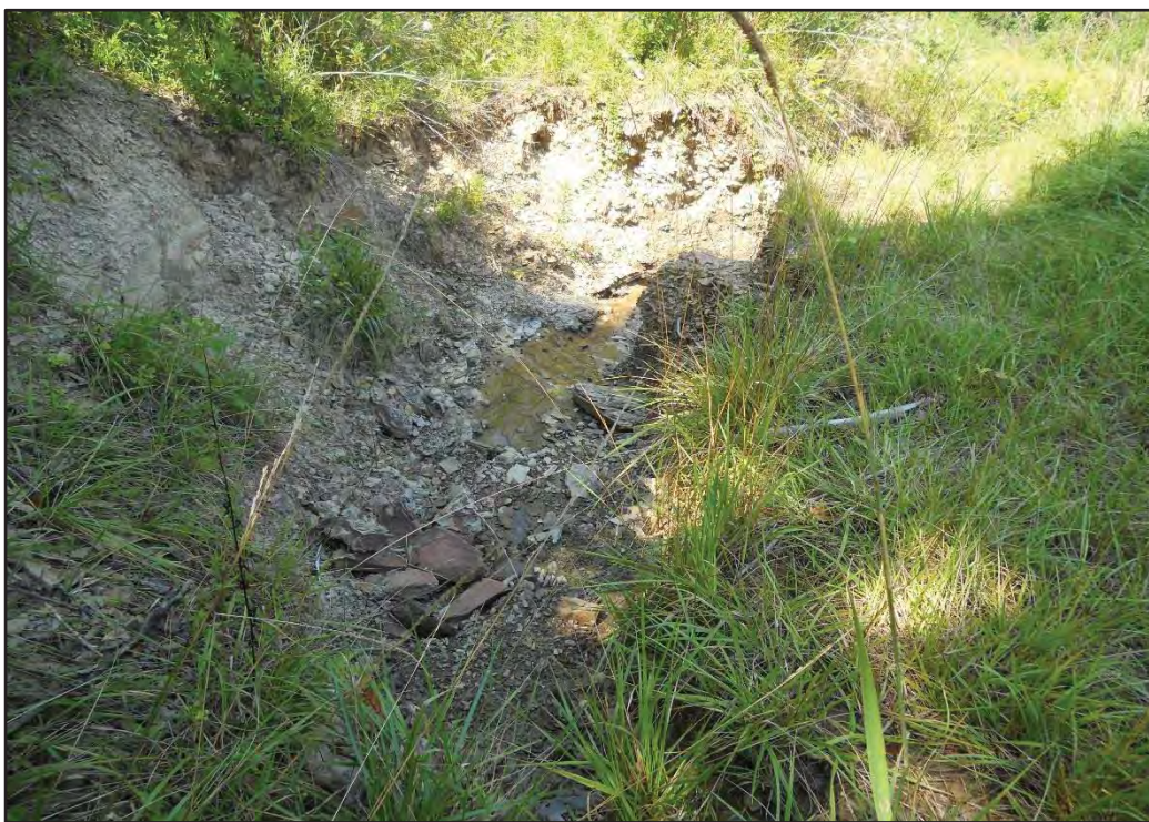
Photograph 44. Stream S011, Downstream, Facing North