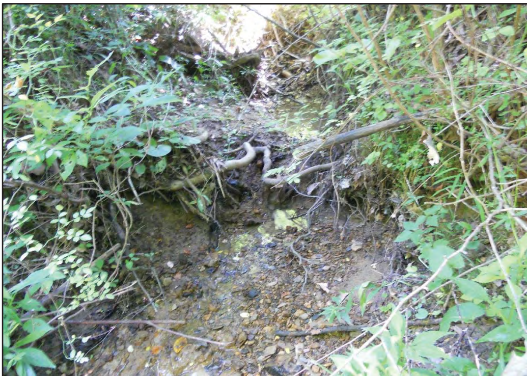
Photograph 45. Stream S012, Upstream, Facing Southwest