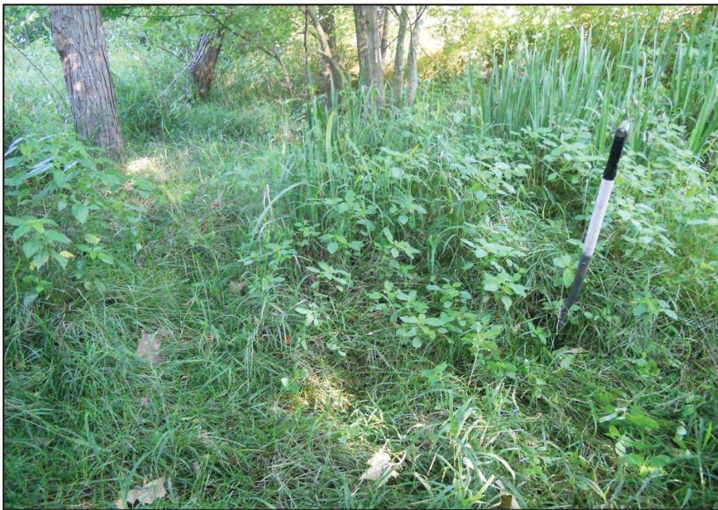
Photograph 10. Wetland W005-PEM-CAT2, Facing West