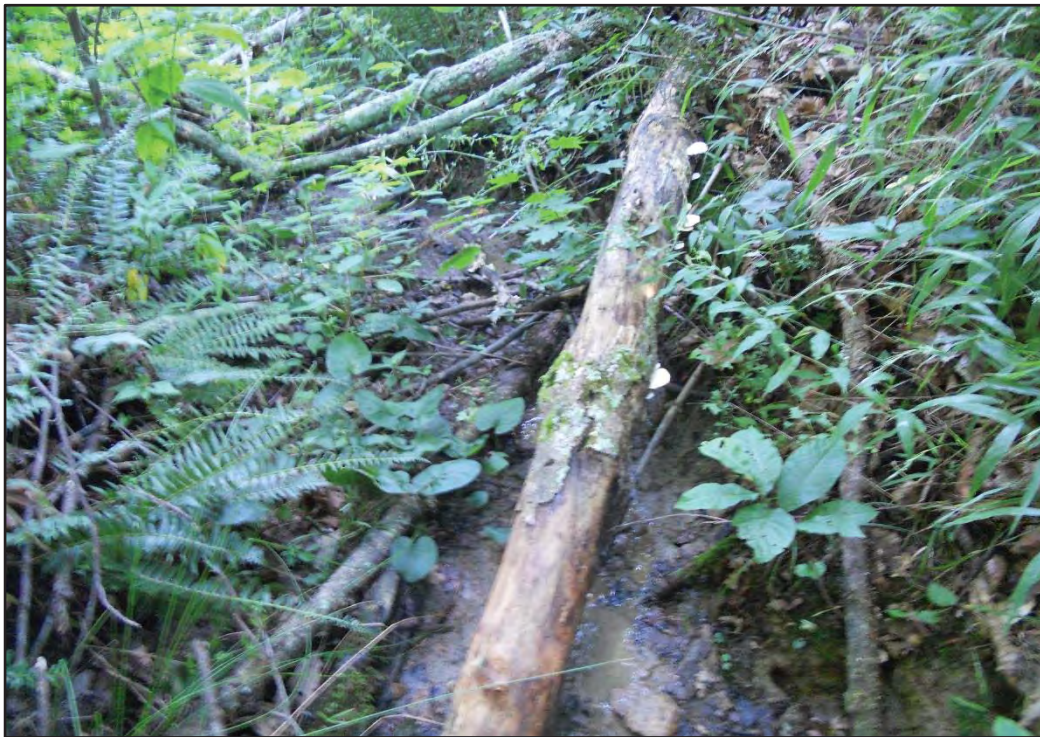
Photograph 28. Stream S003, Downstream, Facing North