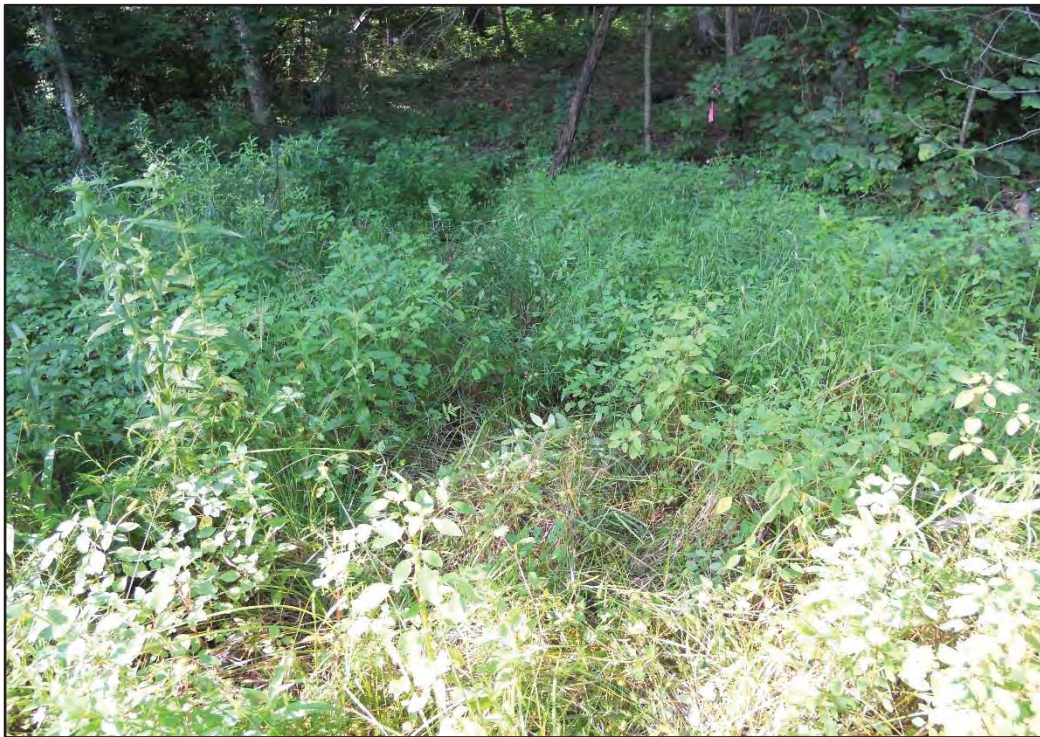
Photograph 18. Wetland W009-PEM-CATMOD2, Facing South