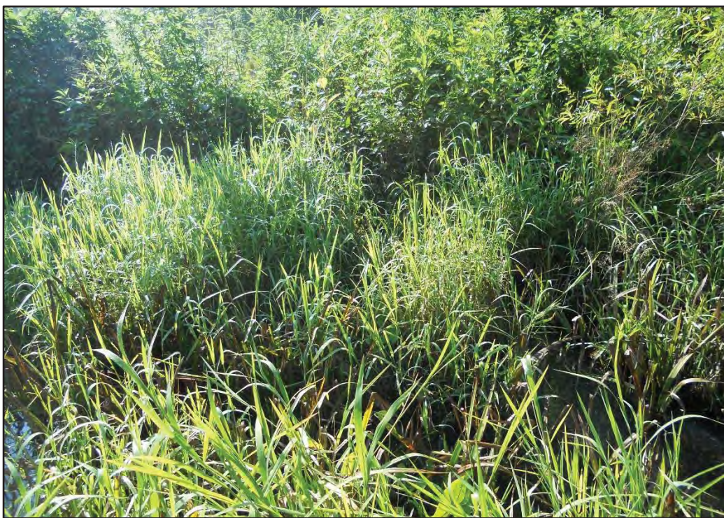
Photograph 12. Wetland W006-PEM-CATMOD2, Facing East