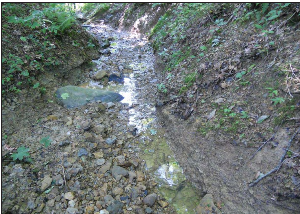
Photograph 30. Stream S004, Downstream, Facing South