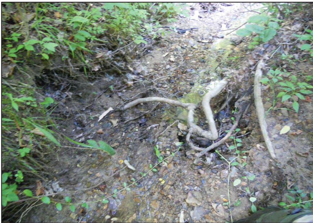
Photograph 46. Stream S012, Downstream, Facing Northeast