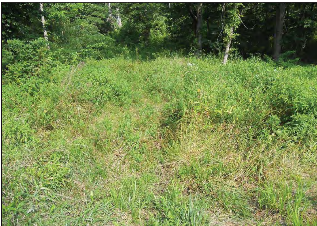
Photograph 19. Wetland W010-PEM-CATMOD2, Facing North