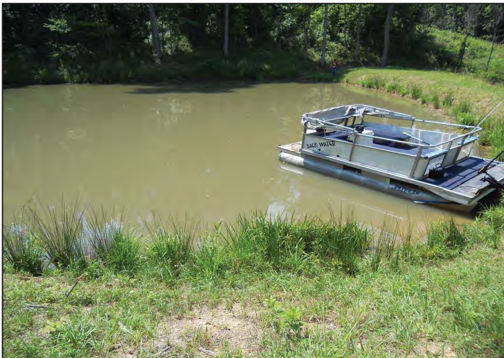
Photograph 14. Wetland W007-PUB-CAT2, Facing West