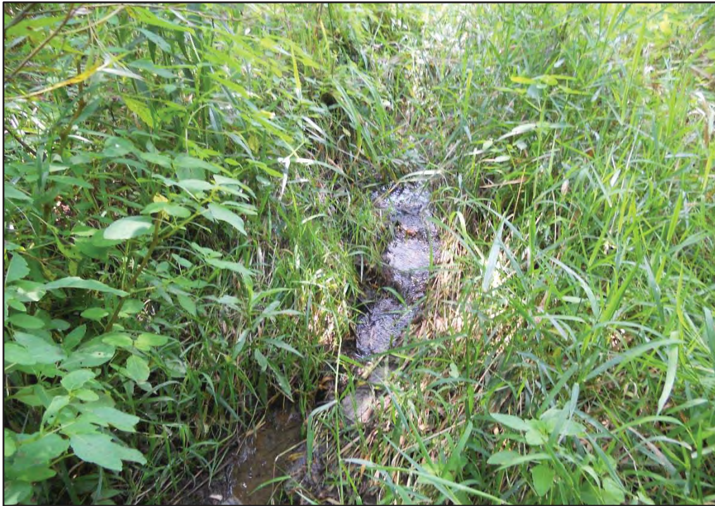
Photograph 23. Stream S001, Upstream, Facing Northwest