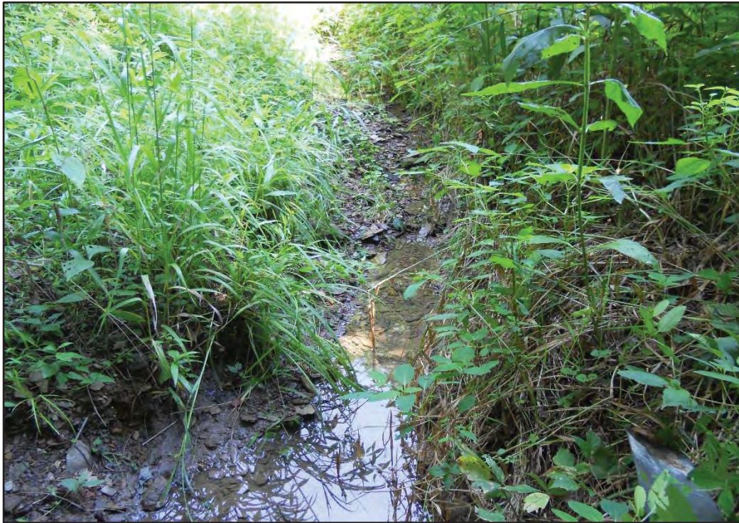
Photograph 35. Stream S007, Upstream, Facing North