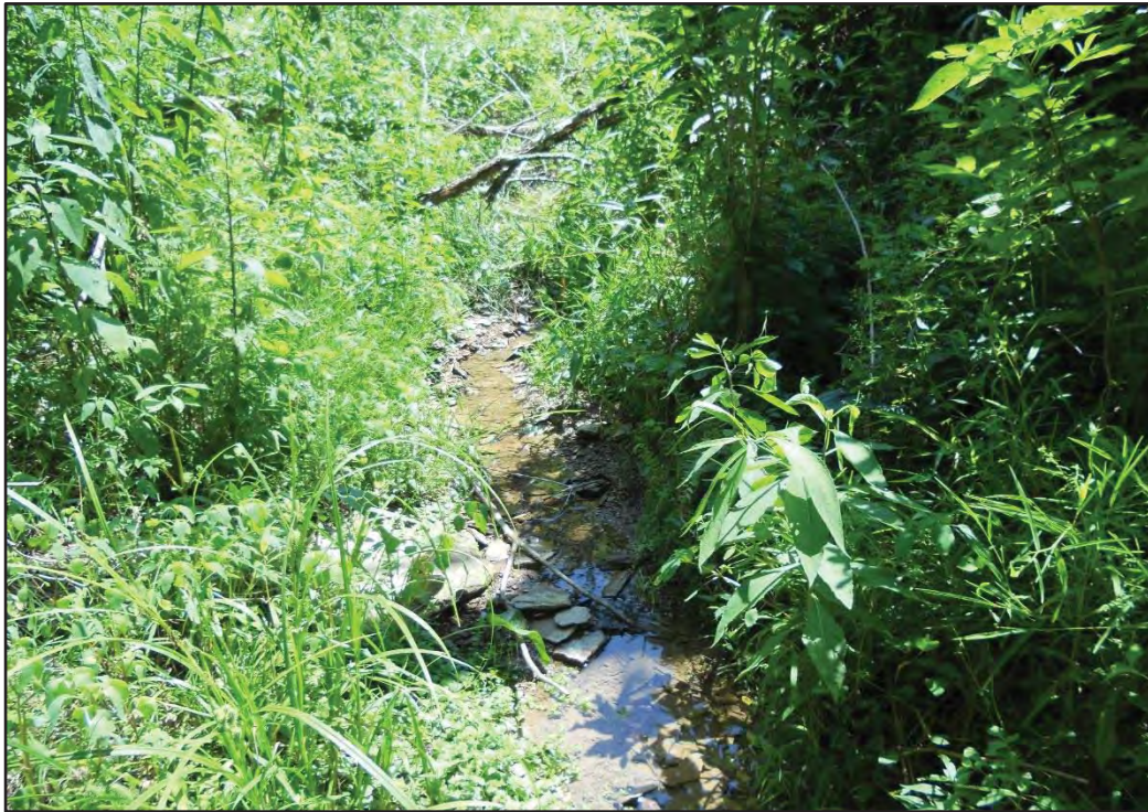
Photograph 41. Stream S010, Upstream, Facing South