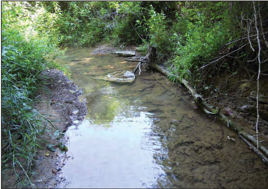
Photograph 47. Stream S013 (Sugar Run), Upstream, Facing West