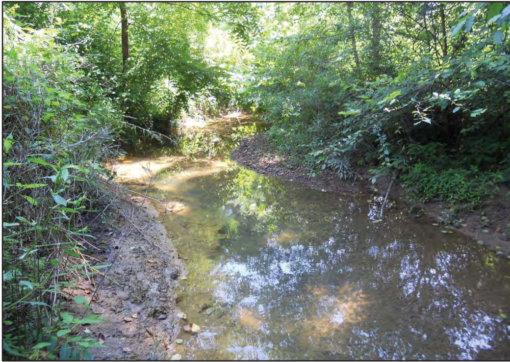
Photograph 37. Stream S008 (Sugar Run), Upstream, Facing North