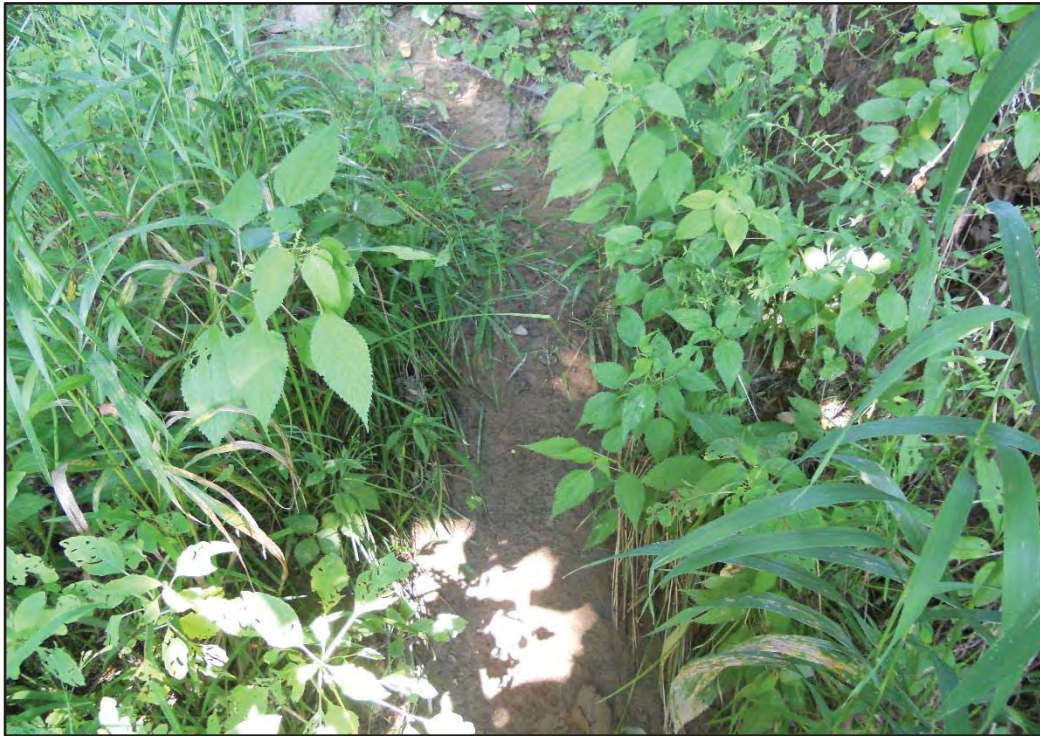
Photograph 53. Stream S016, Upstream, Facing Southwest