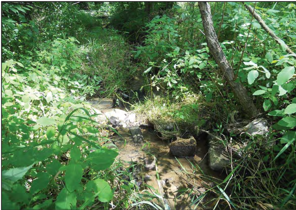
Photograph 24. Stream S001, Downstream, Facing Southeast