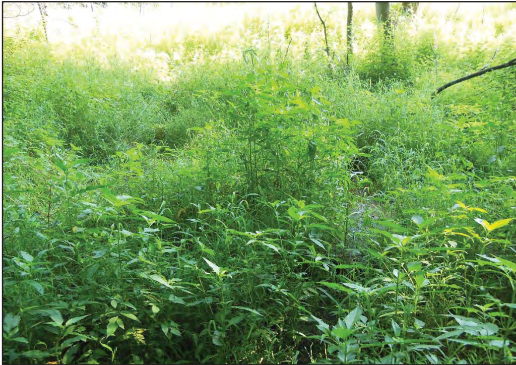
Photograph 17. Wetland W009-PEM-CATMOD2, Facing North