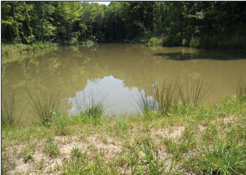
Photograph 13. Wetland W007-PUB-CAT2, Facing South