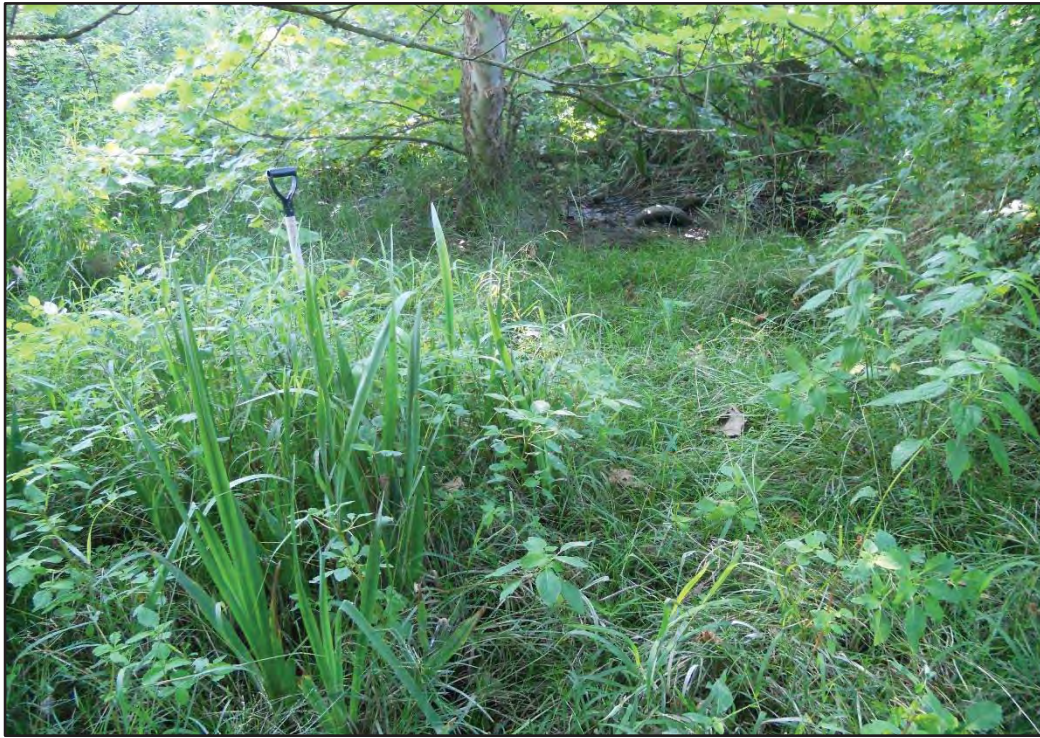
Photograph 9. Wetland W005-PEM-CAT2, Facing East