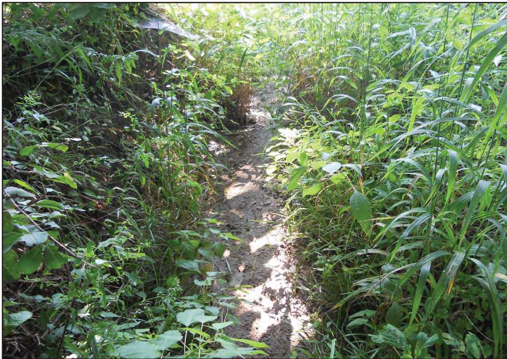
Photograph 54. Stream S016, Downstream, Facing Northeast