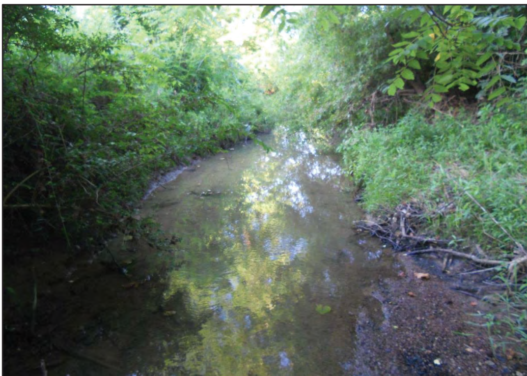
Photograph 26. Stream S002 (Horse Creek), Downstream, Facing South