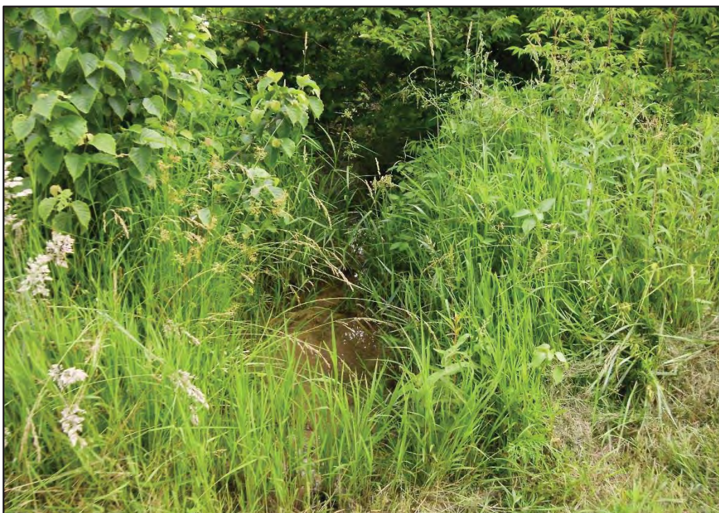
Photograph 21. Wetland W011-PEM-CAT1, Facing Southwest