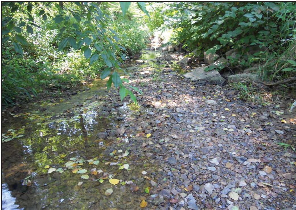
Photograph 38. Stream S008 (Sugar Run), Downstream, Facing South