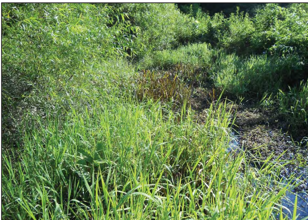
Photograph 11. Wetland W006-PEM-CATMOD2, Facing North