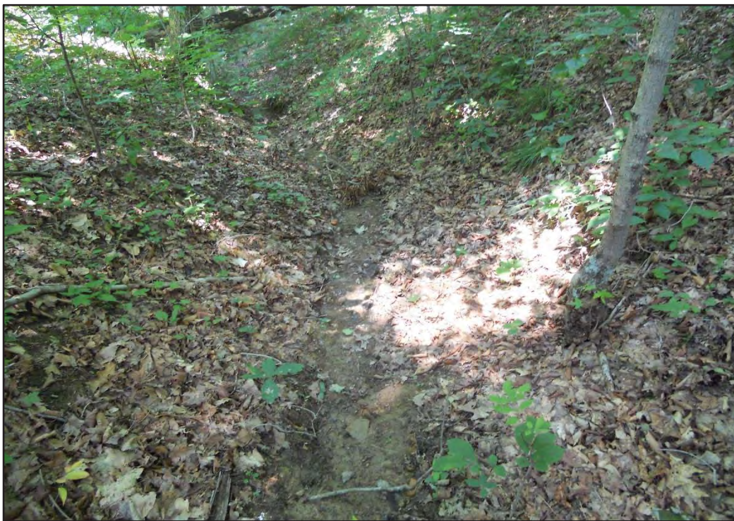
Photograph 40. Stream S009, Downstream, Facing North