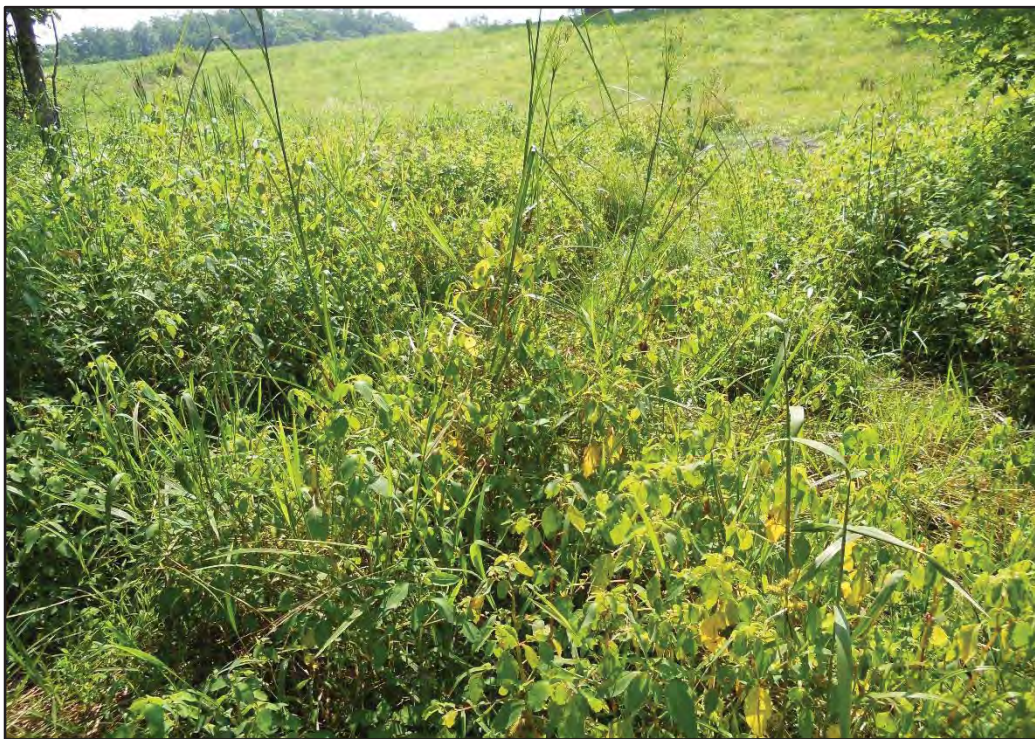
Photograph 20. Wetland W010-PEM-CATMOD2, Facing South