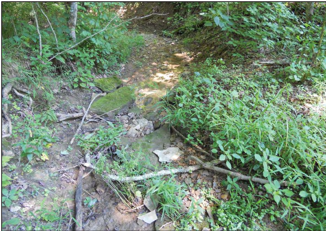
Photograph 42. Stream S010, Downstream, Facing North