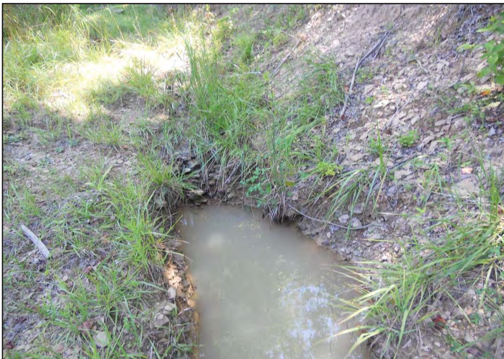
Photograph 43. Stream S011, Upstream, Facing South