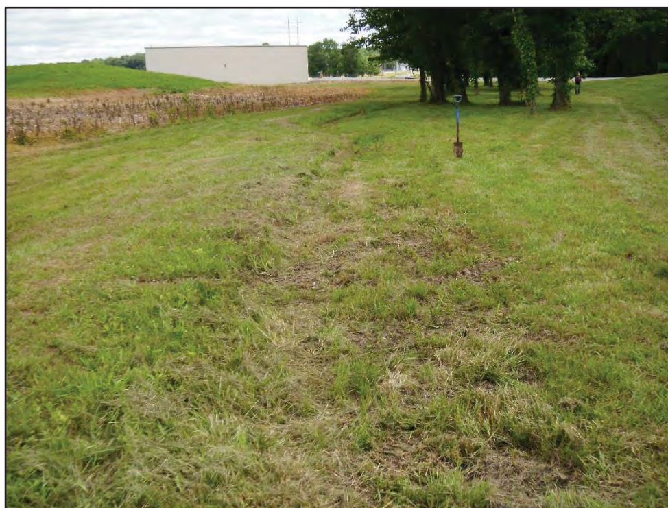
Photograph 22. Wetland W011-PEM-CAT1, Facing Northeast