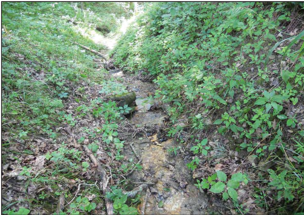
Photograph 34. Stream S006, Downstream, Facing South