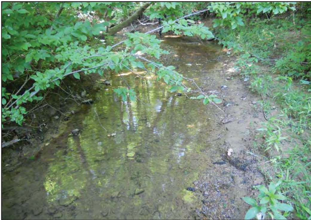
Photograph 48. Stream S013 (Sugar Run), Downstream, Facing West