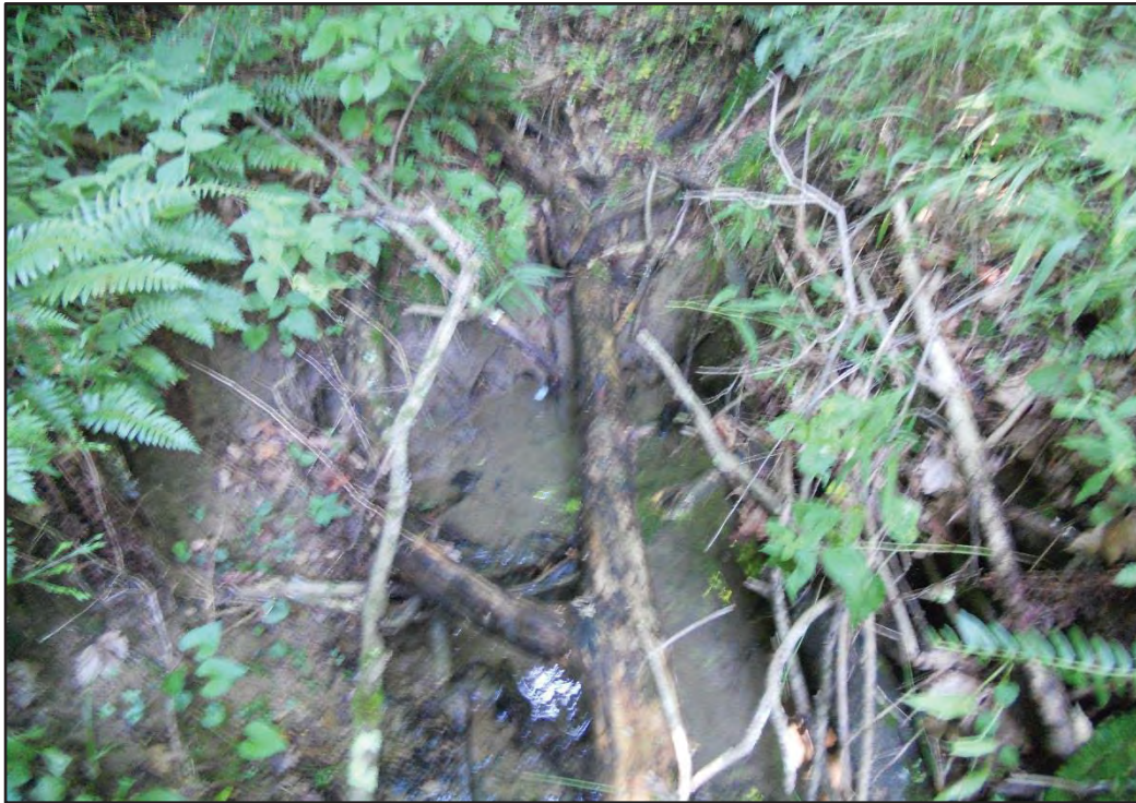
Photograph 27. Stream S003, Upstream, Facing South