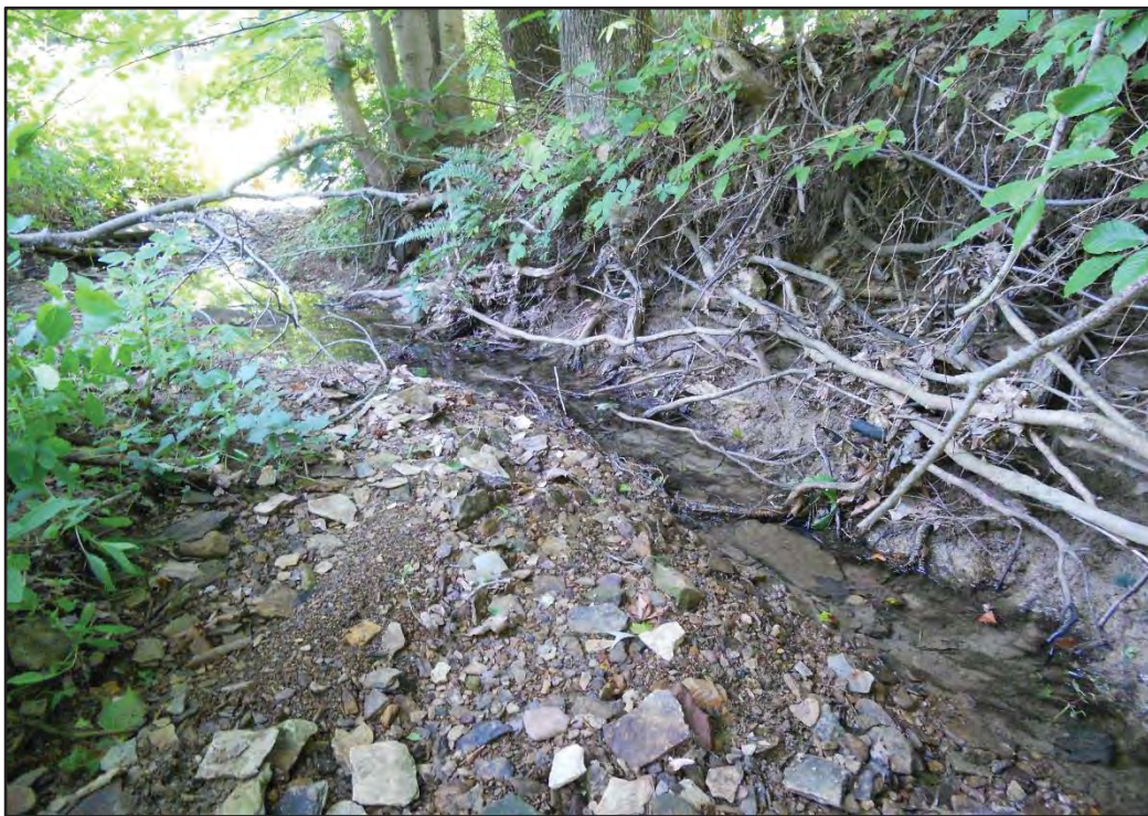
Photograph 36. Stream S007, Downstream, Facing Southeast