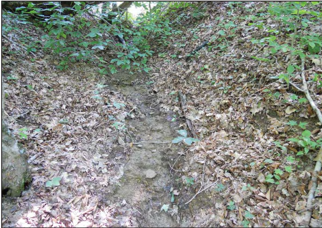
Photograph 39. Stream S009, Upstream, Facing South