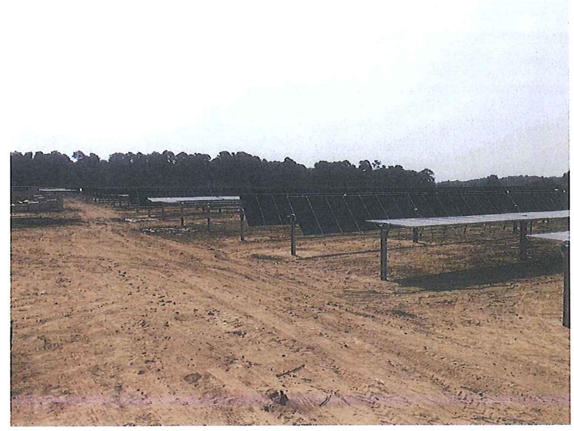
July 21, 2017