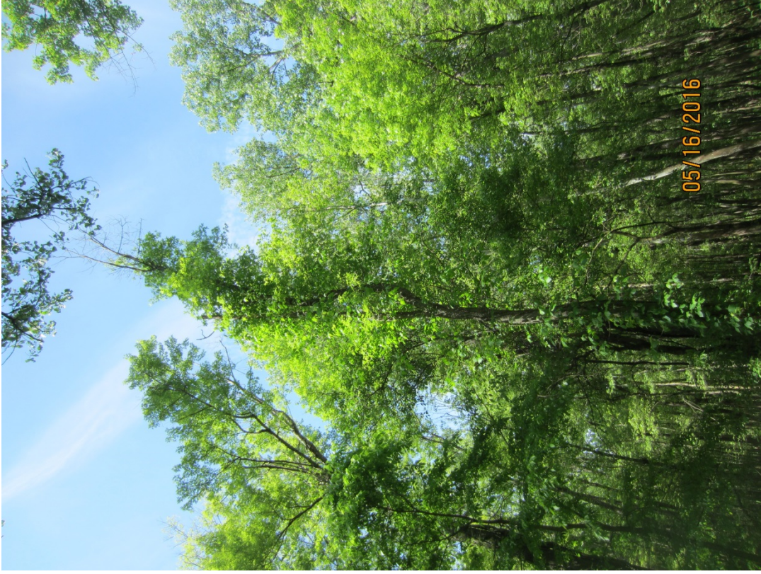
Photograph 11. View of PRT-10.