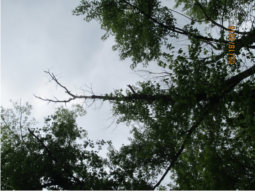
Photograph 17. View of PRT-51.