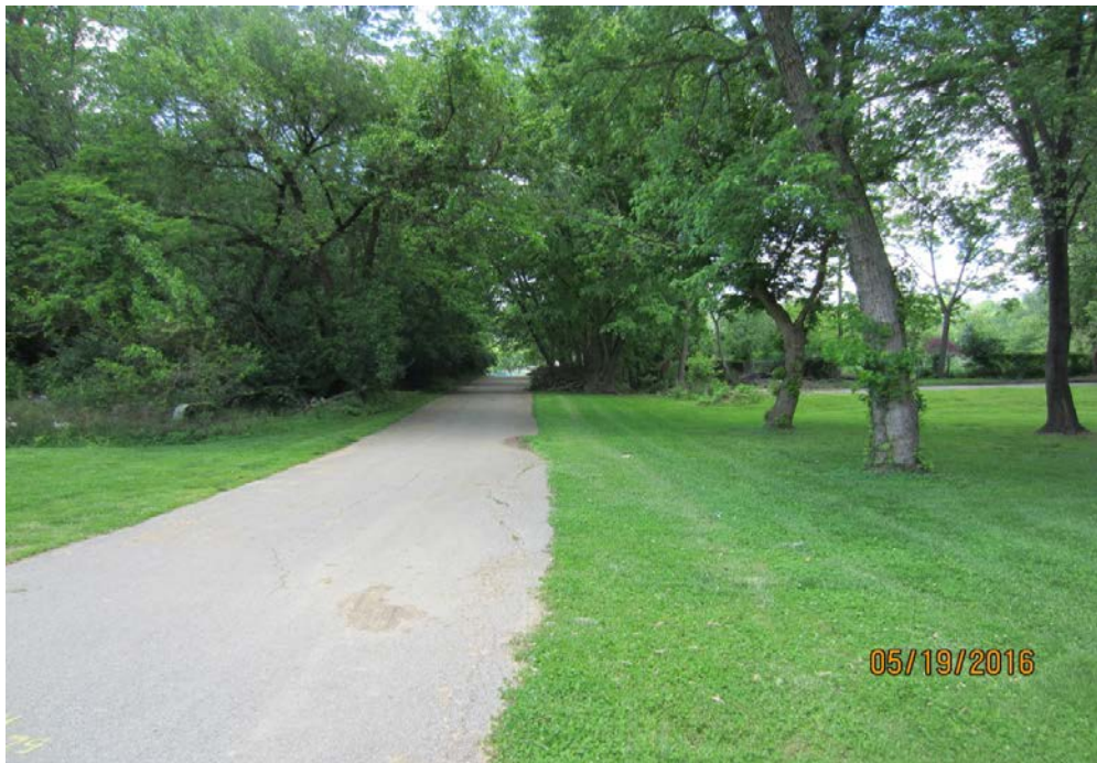
Photograph 26. View of trail and mowed park habitat on west side of Strader Avenue. Photograph taken facing north-northwest.

Line D000B Pipeline Replacement Project Cincinnati, Hamilton County, Ohio CEC Project 153-230 Photographed on May 16, 18 and 19, 2016