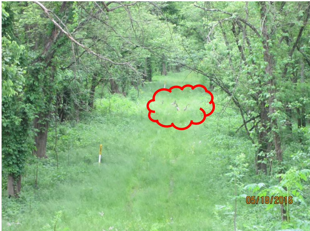
Photograph 20. Elevated view of existing bermed and maintained Line D000B ROW. Note the wild turkeys. Photograph taken facing south.

Line D000B Pipeline Replacement Project Cincinnati, Hamilton County, Ohio CEC Project 153-230 Photographed on May 16, 18 and 19, 2016