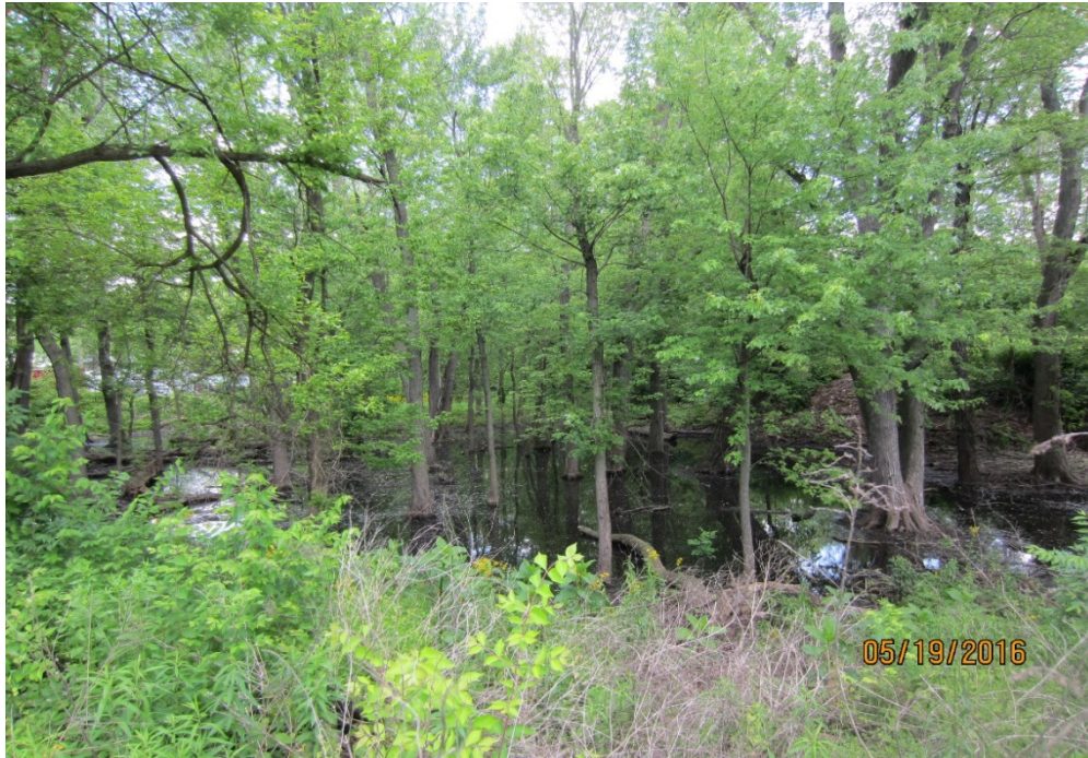
Photograph 25. View of forested wetland habitat, facing east-northeast.