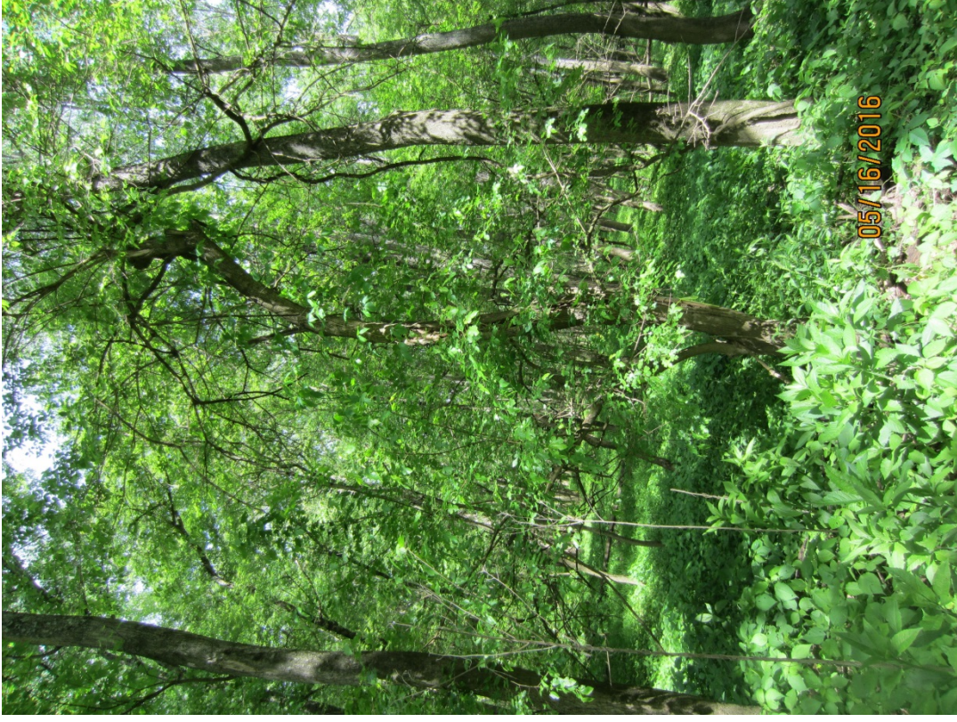
Photograph 12. View of PRT-12.

Line D000B Pipeline Replacement Project Cincinnati, Hamilton County, Ohio CEC Project 153-230 Photographed on May 16, 18 and 19, 2016