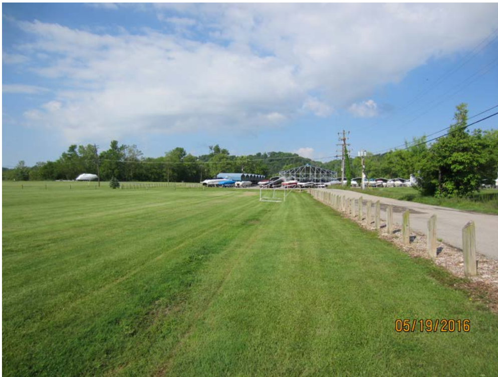
Photograph 24. View of the existing Line D000B ROW along the south side of Stites Road. Photograph taken facing west-southwest.

Line D000B Pipeline Replacement Project Cincinnati, Hamilton County, Ohio CEC Project 153-230 Photographed on May 16, 18 and 19, 2016