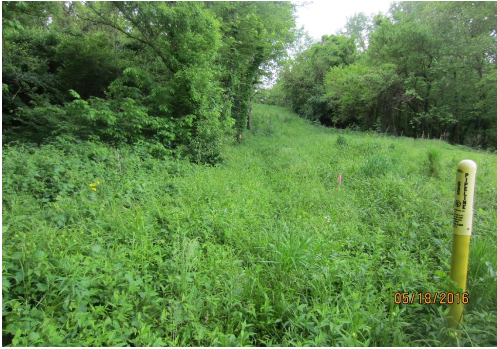
Photograph 23. View of emergent wetland habitat, facing south.