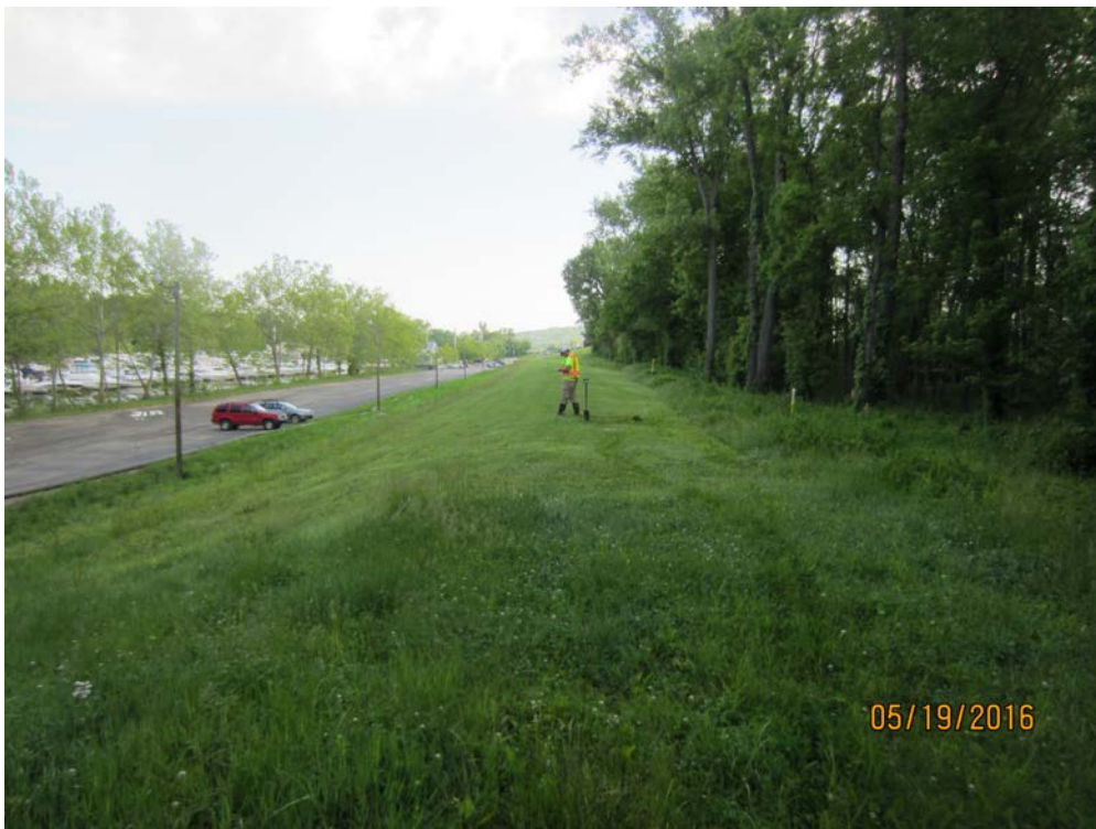
Photograph 22. View of maintained Line D000B ROW. Photograph taken facing south-southeast.

Line D000B Pipeline Replacement Project Cincinnati, Hamilton County, Ohio CEC Project 153-230 Photographed on May 16, 18 and 19, 2016