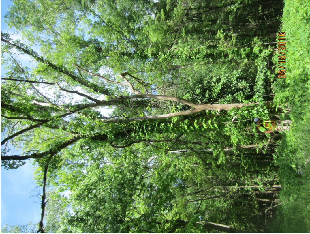
Photograph 13. View of PRT-19.