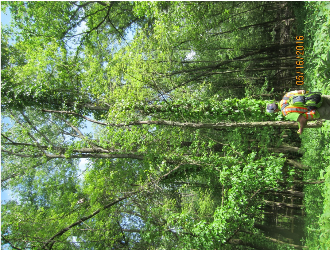
Photograph 14. View of PRT-20.

Line D000B Pipeline Replacement Project Cincinnati, Hamilton County, Ohio CEC Project 153-230 Photographed on May 16, 18 and 19, 2016