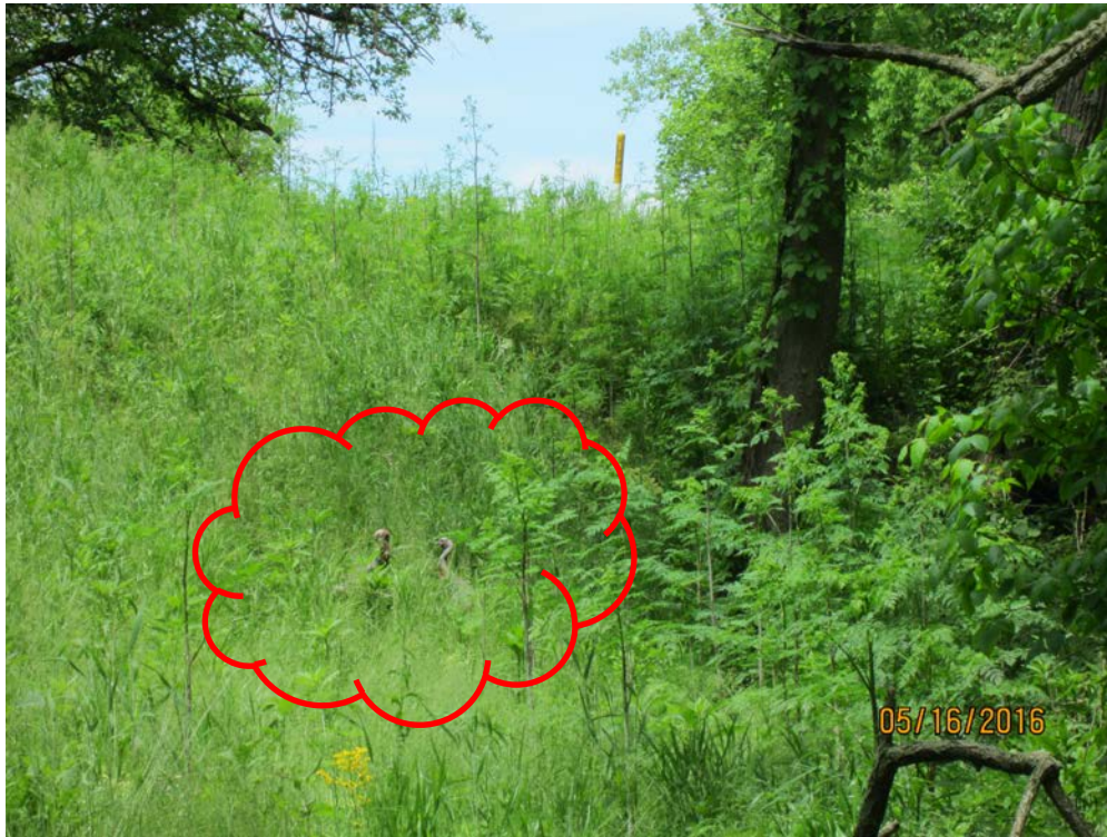
Photograph 19. Wild turkey ( Meleagris gallopavo ) from the mature forested floodplain habitat near the southern terminus of the Project.