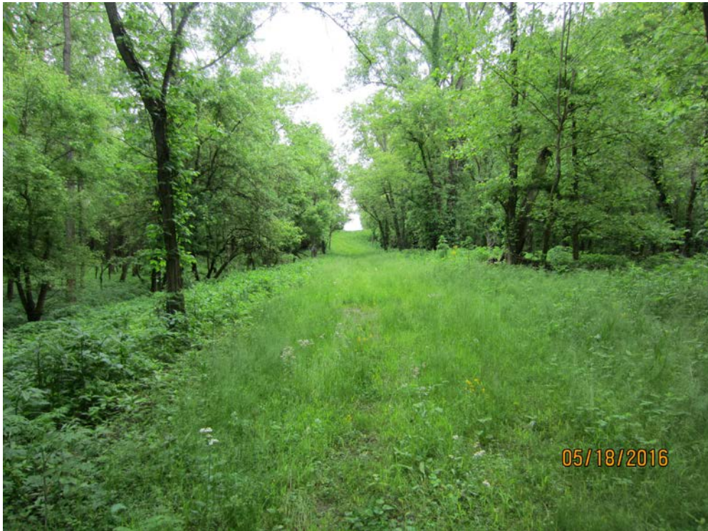
Photograph 10. Representative view of the elevated and maintained Line D000B ROW, bisecting the forested wetland habitat at the southern terminus of the Project. Photograph taken facing north.

Line D000B Pipeline Replacement Project Cincinnati, Hamilton County, Ohio CEC Project 153-230 Photographed on May 16, 18 and 19, 2016