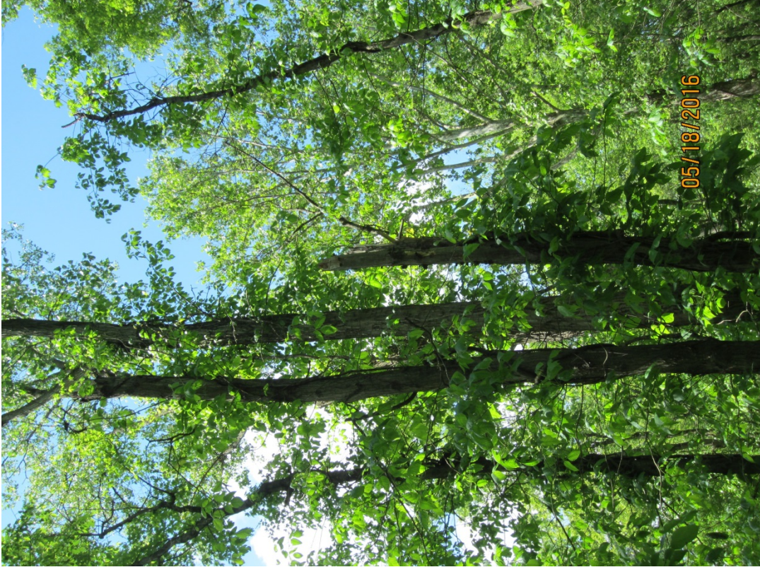
Photograph 16. View of PRT-50.

Line D000B Pipeline Replacement Project Cincinnati, Hamilton County, Ohio CEC Project 153-230 Photographed on May 16, 18 and 19, 2016