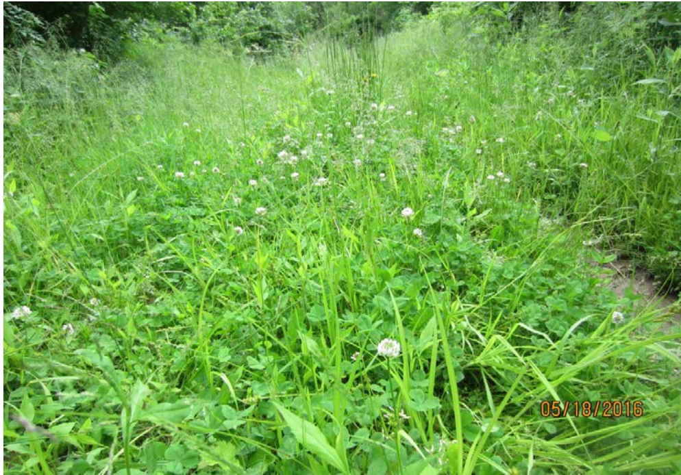
Photograph 21. View of potential running buffalo clover habitat along a trail or two track that is located on an embankment that formerly functioned as a railroad corridor, facing southwest.