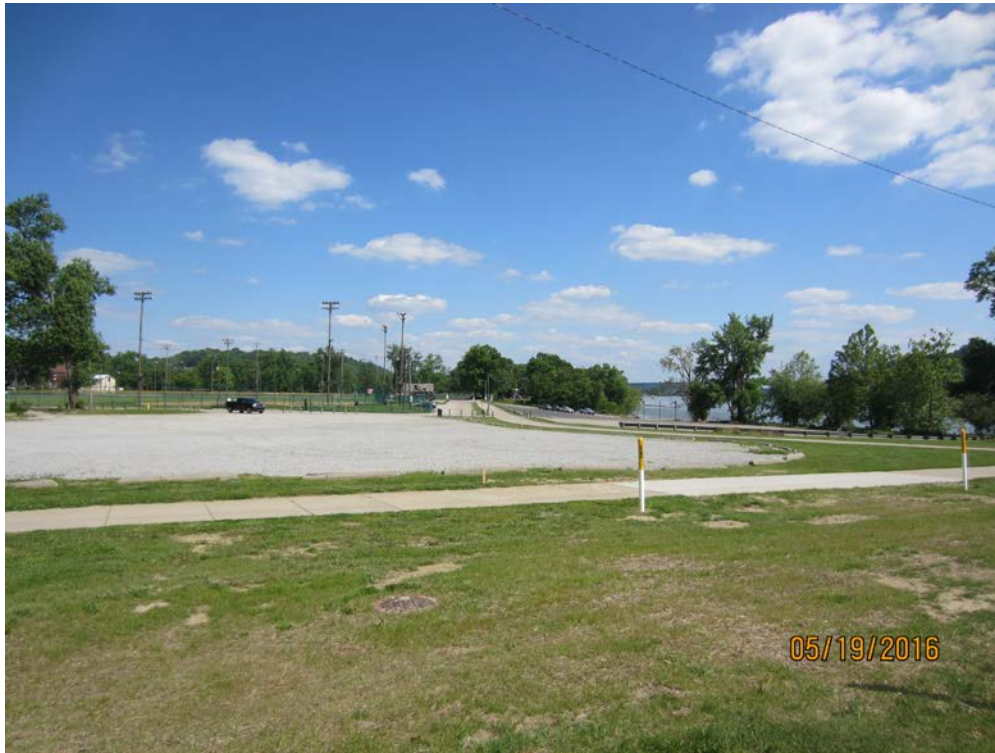
Photograph 27. View of the existing Line D000B ROW near the northern terminus of the Project. Photograph taken facing southeast.

Line D000B Pipeline Replacement Project Cincinnati, Hamilton County, Ohio CEC Project 153-230 Photographed on May 16, 18 and 19, 2016