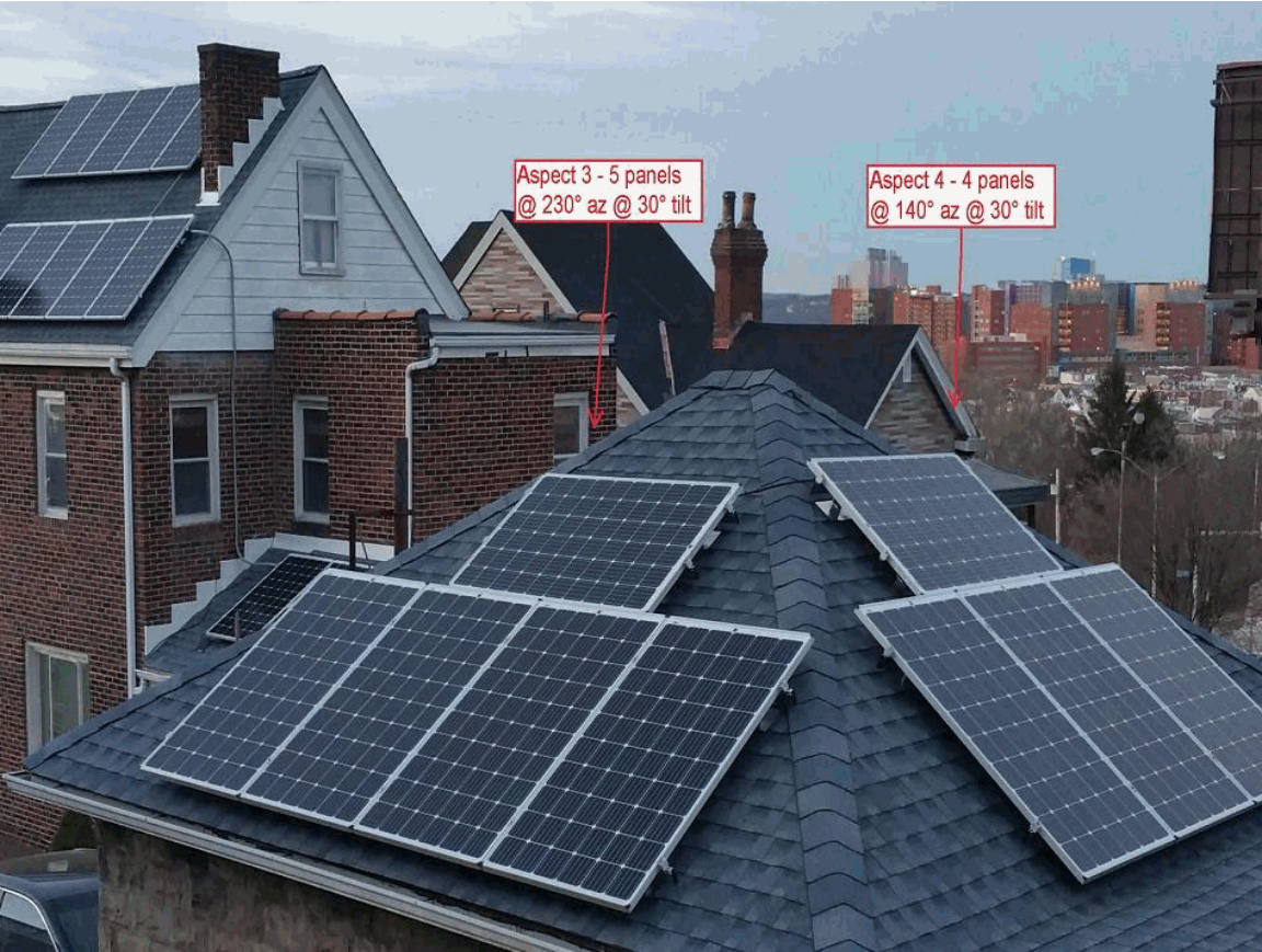
March 09, 2017