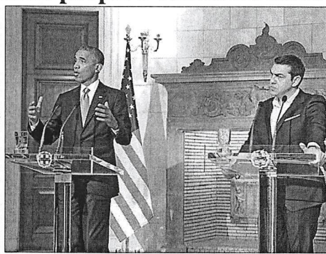
U.S. President Barack Obama, left, speaks during a news conference with Greek Prime Minister Alexis Tsipras at Marousi Mansion in Athens on Tuesday, Nov. 15, 2016. Obama is praising Greece for its financial commitment to NATO — specifically, for being one of five NATO allies that dedicated at least 2 percent of its gross domestic product to defense spending.

In his meeting with Tsipras, Obama offered a welcome message of support for the Greeks as they struggle with both economic woes and a huge influx of refugees. Obama pledged to keep pressing his view that "austerity alone cannot deliver prosperity" and that it is going to be important both with respect to debt relief and other accommodative strategies to help the Greek people in this period of