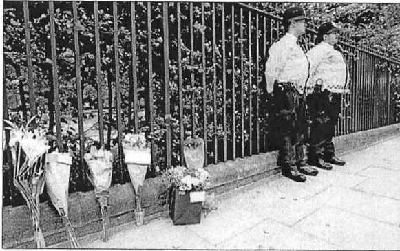
Floral tributes rest against railings Thursday Aug. 4, 2016, near the scene of a fatal stabbing on Wednesday night in Russell Square, London. London police say they have found no signs of radicalization in a knife attack which killed an American woman and injured five other people in London's Russell Square.

"Terror in London" ran the headline in the Mail