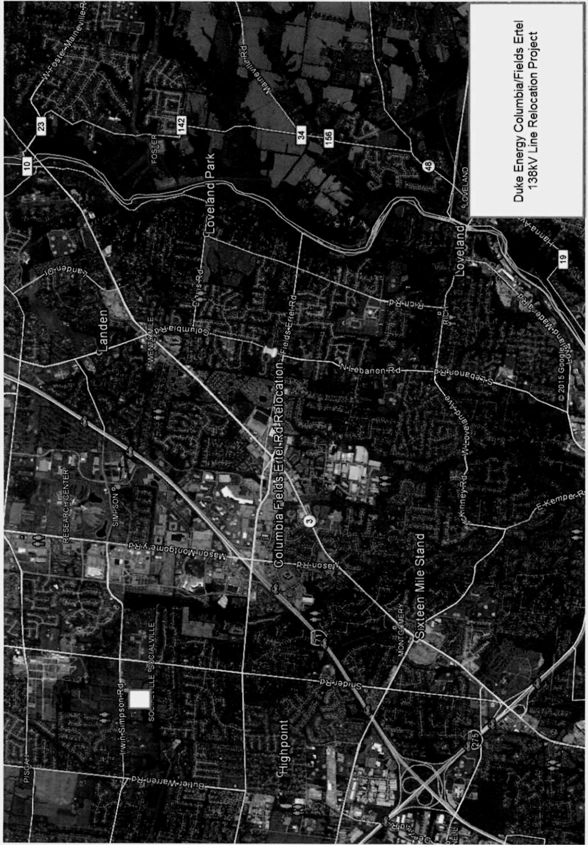
Duke Energy Columbia/Fields Eitel 138kV Line Relocation Project