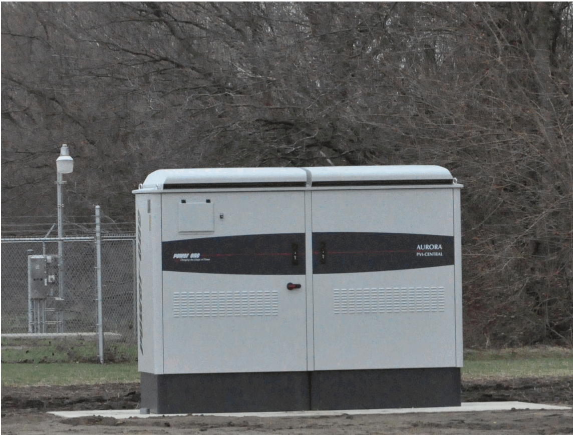
December 11, 2014