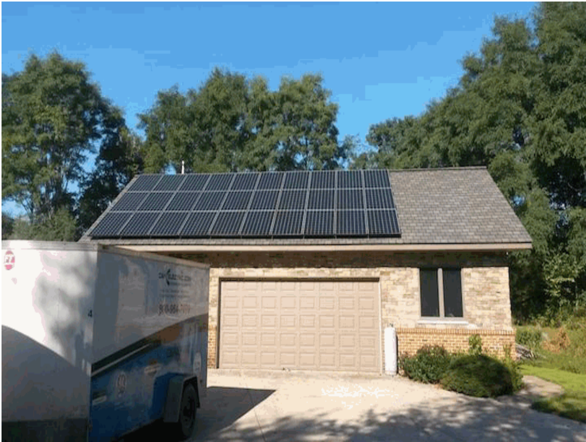
October 21, 2014