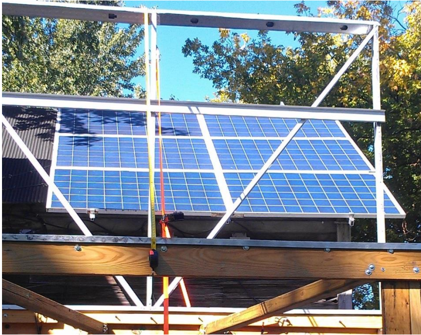
6 – AstroEnergy 250W CHSM 6610P (June, 2014)