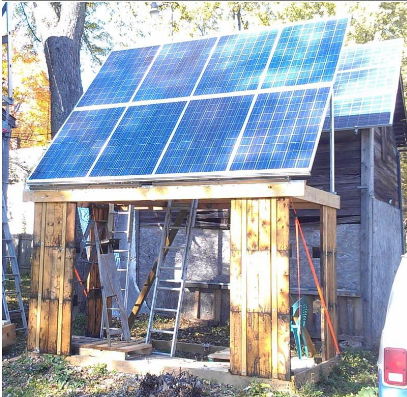
8 – JaSolar 245W JAP6 60-245/3BB (October, 2014)